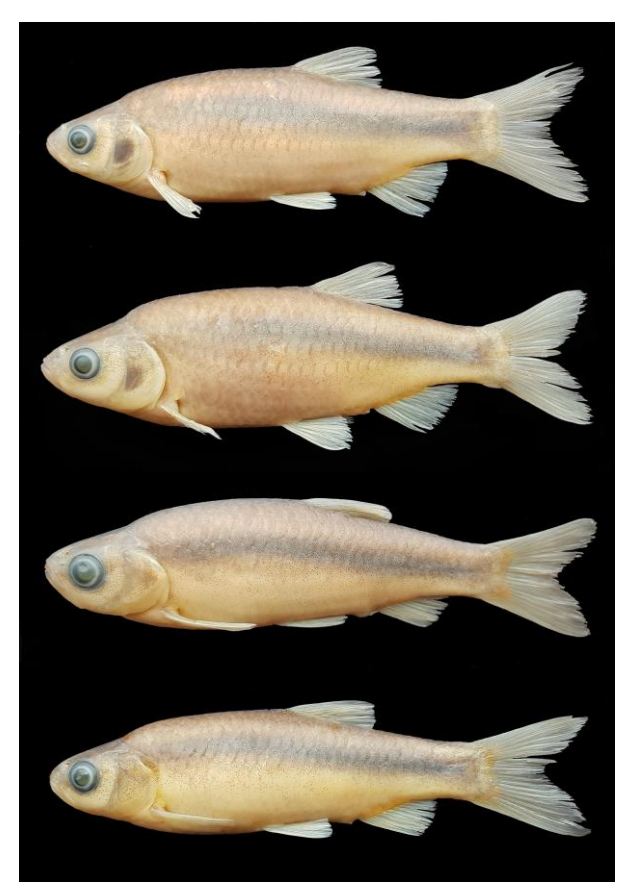
Figure 3. Petroleuciscus ninae, from the top: FFR 3845, 82 mm SL; 78 mm SL; Türkiye: stream Sarıçay; FFR 3854, 74 mm SL; 71 mm SL; Türkiye: Lake Acıgöl.