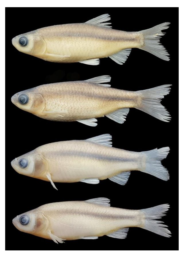
Figure 4. Petroleuciscus ninae, from the top: FFR 3860, 71 mm SL; 66 mm SL; Türkiye: inflow of Yenişehir pond, Küçük Menderes drainage; FFR 3861, 50 mm SL; 40 mm SL; Türkiye: a northeastern drainage of Tahtalı Reservoir.