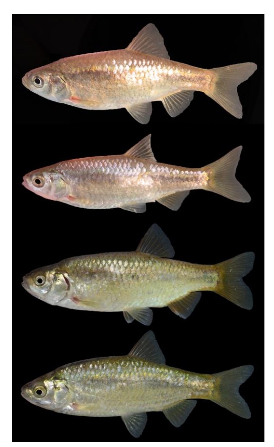
Figure 5. Petroleuciscus ninae , from the top: FFR 3860, 71 mm SL; 64 mm SL; inflow of Yenişehir Pond, Küçük Menderes Drainage; FFR 3861, 50 mm SL; a north-eastern drainage of Tahtalı Reservoir; FFR 3853, 72 mm SL; Yenicekent DSİ pomps, Büyük Menderes River; not preserved, about 60 mm SL, Stream Akçay Büyük Menderes drainage.