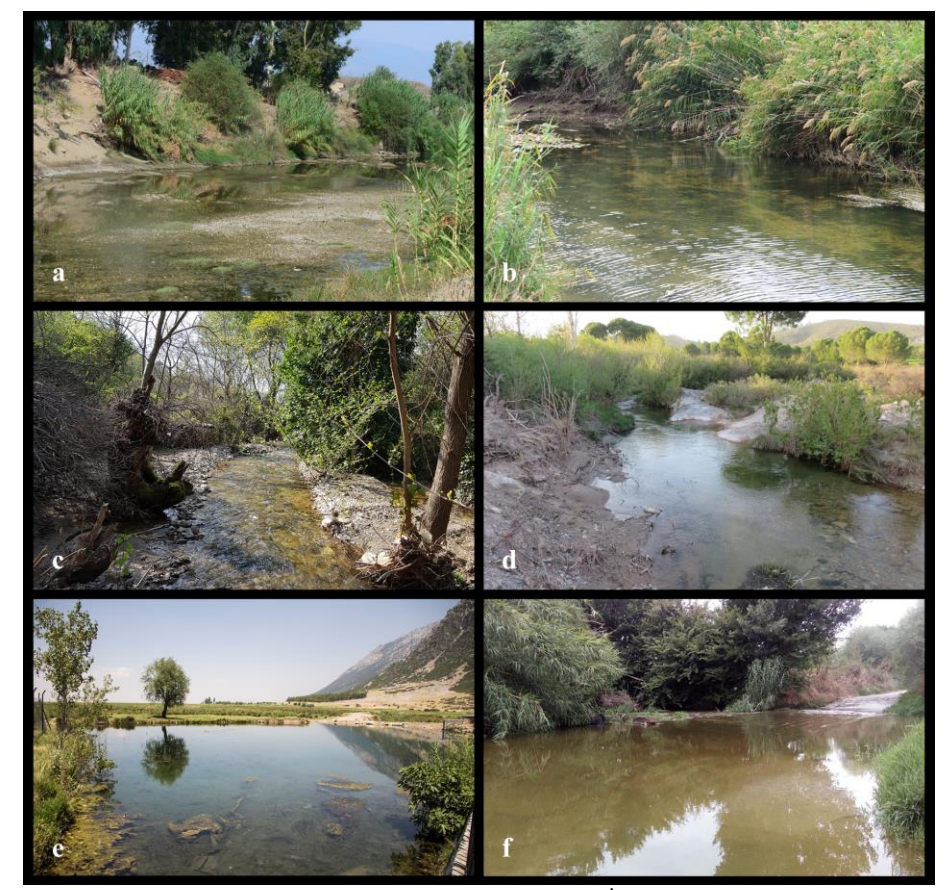
Figure 2. Habitat of Petroleuciscus ninae : a, Stream Akçay; b, Yenicekent DSİ pom station, Büyük Menderes River; c, inflow of Yenişehir Pond, Küçük Menderes Drainage; d, Stream Balaban, Tahtalı Reservoir Drainage; e, Spring Gemiş, Lake Acı Basin; f, Sarıçay River.

The zoogeographic distribution of Petroleuciscus ninae and P. smyrnaeus in the Turkish Aegean Sea drainages, with P. smyrnaeus inhabiting between the rivers Bakırçay and Gediz (around İzmir), and P. ninae inhabiting Tahtalı Reservoir basin to the north and Sarıçay River to the south, nested within the range of the Capoeta and Chondrostoma species in the same region. Capoeta aydinensis and Chondrostoma turnai distributed in Büyük Menderes River and southern