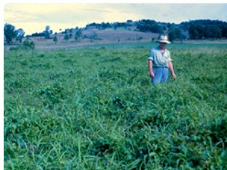
Green panic with glycine, south east Queensland Australia (cv. Petrie)