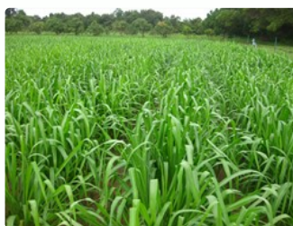
Ready for cut-and-carry (cv. Mun River)