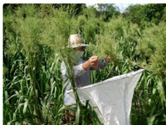
Bumping ripe seed of cv. Mun River into catching cone, Ubon Ratchathani, Thailand