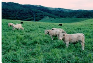
Well managed Megathyrsus maximus and Neonotonia wightii pasture, Port Laguerre, New Caledonia