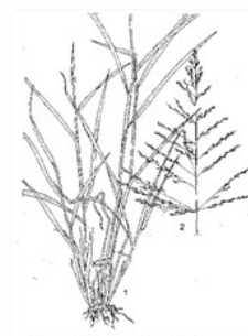
Line illustration (var. trichoglume = M. maximus )