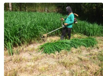
Cut-and-carry high quality young cv. Mombasa to feed goats, Thailand