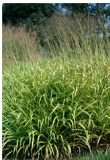
Tall medium type, common guinea, Australia (cv. Riversdale)

Because of the morphological and agronomic variability, the species is treated here as 2 broad non-taxonomic types: