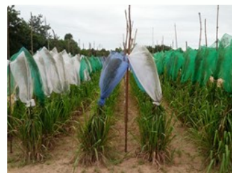
Bagged seedheads for seed collection (cv. Mun River)