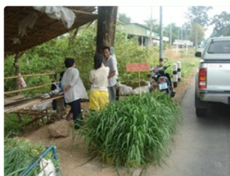
Roadside sale, E Thailand