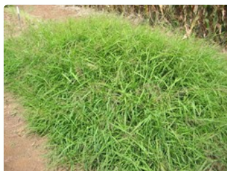
Low-growing, fine leafed type (CPI 60016)