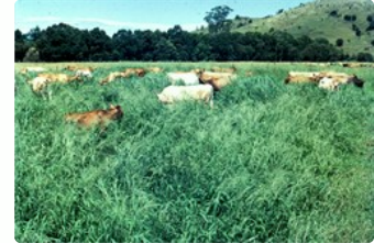
Green panic, SE Queensland (cv. Petrie)