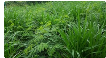
With Leucaena leucocephala , Myanmar