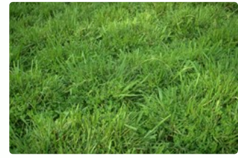
Grazed stand of cv. Tobiatã with Arachis pintoï . Colombia.