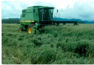
Mechanical seed harvest, north Queensland Australia (cv. Gatton)

English: Guinea grass, buffalo grass, bush buffalo grass, purple-top buffalo grass, rainbow grass, Sabi panicum, Tanganyika grass,