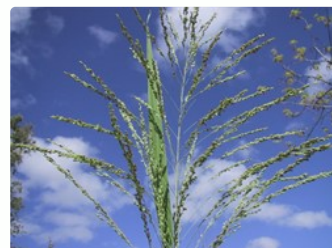
Open panicle as found in most Megathyrsus maximus ecotypes