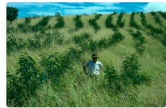
Gatton panic and leucaena, central Queensland Australia (cv. Gatton)