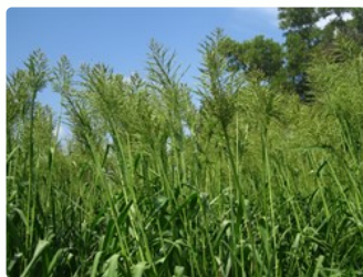
Compact panicle in cv. Mun River