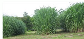
Tall varieties, cv. Vencedor (L), cv. Tanzania (M), cv. Mombaca (R) (ca. 2m tall in image)