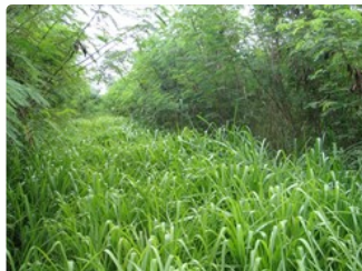
Between L. leucocephala hedgerows, E Paraguay