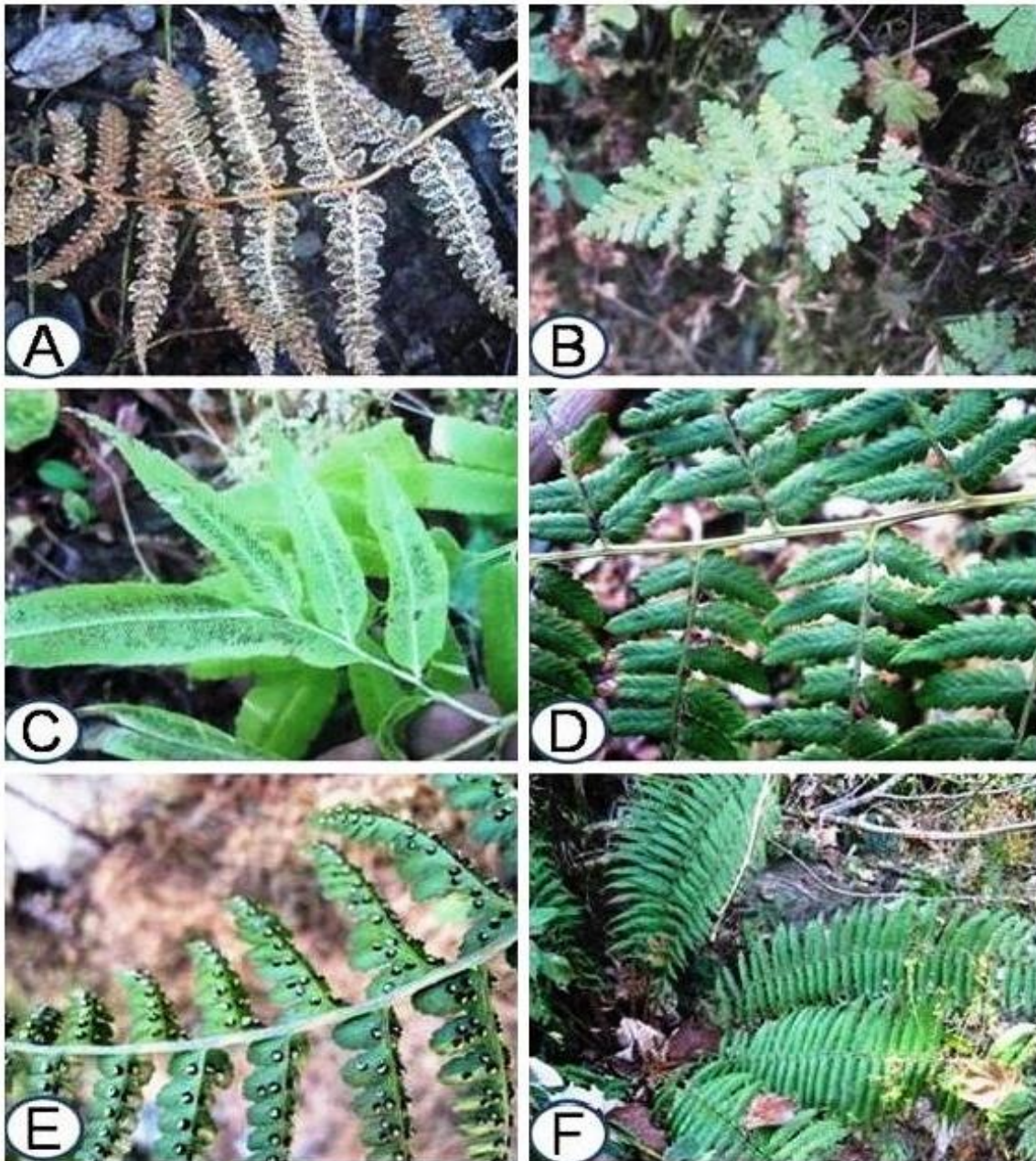
Figure 3. A, Athyrium schimperi Moug. ex Fée; B, Cheilanthes farinosa (Forssk.) Kaulf; C, Coniogramma procerum (Wall.) Fée.; D, Diplazium polypodioides Blume; E, Dryopteris caroli-hopei Fraser-Jenkin; F, Dryopteris wallichiana Wall.

The plant was terrestrial and found to grow on humus-rich mountain slopes with high moisture at various elevations, usually at edge of forests or in clearings, not in deep shade. On the way to Kedarkantha from Sankri, 7430 ft., N 31° 04.331' E 078° 11.413', 5.11.2012, SKB 253031; 8094 ft., N 31° 03.612' E 078° 11.342', 5.11.2012, SKB 253051. 2 km before Jakhol from Sankri, 7060 ft., N 31° 06.733' E 078° 14.029', 6.11.2012, SKB 253070. Sankri local, 6479 ft., N 31° 04.618' E 078° 11.007', 7.11.2012, SKB 253074.