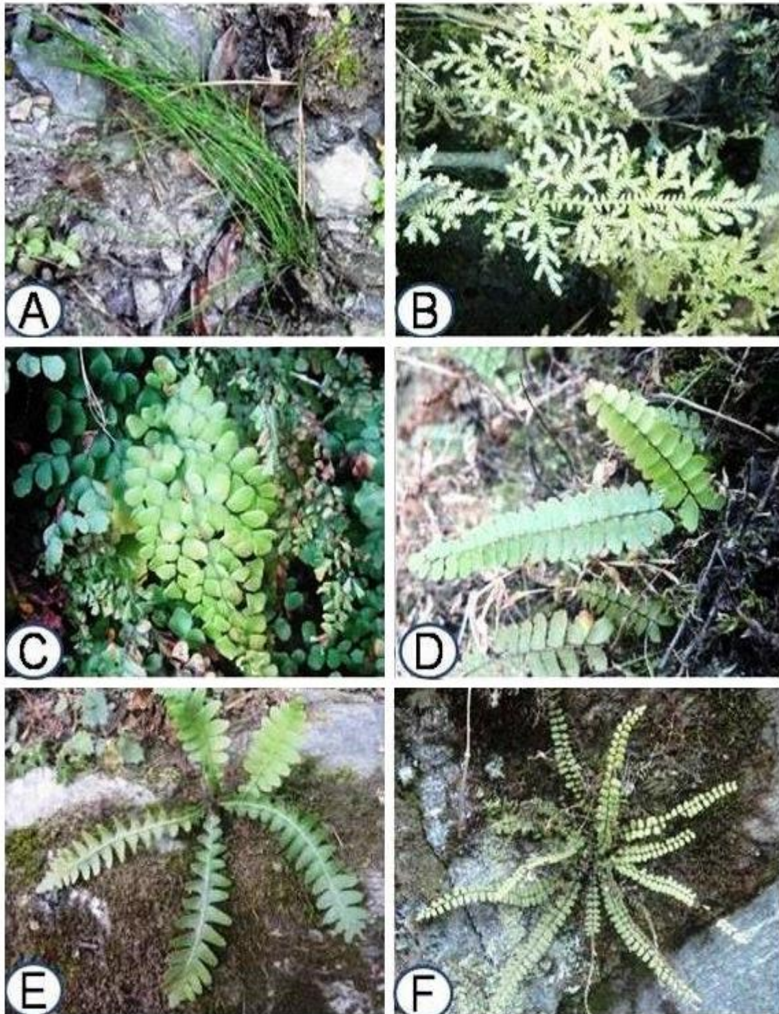
Figure 2. A, Equisetum diffusum D. Don; B, Selaginella kraussiana (Kuntze) A. Braun; C, Adiantum venustum D. Don; D, Adiantum Phillipense L.; E, Asplenium dalhousiae Hook.; F, Asplenium trichomanes L.

The plant was growing adjacent to water channel in the sandy soil near Sankri. In spite of being a common species, it was located in a single locality, 6282 ft., N 31° 04.552' E 078° 10.652', 7.11.2012, SKB 253085.