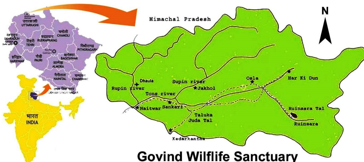
Figure 1. Map of Govind Wildlife Sanctuary in Uttarkashi district showing the locations of study areas.

Pteridaceae and Polypodiaceae, and the families with representation of single species were Blechnaceae, Coniogramaceae, Equisetaceae, Osmundaceae Pteridaceae, Pteridiaceae, Selaginellaceae, Sinopteridaceae (Table.1). Among the plants collected, genus Dryopteris had maximum, 10 species followed by the genus Polystichum with 8 species, Pteris with 5 species, Asplenium and Athyrium with 3 species, Adiantum , Onichium , Lepisorus , and Polypodiodes with 2 species and rest genus had 1 species each (Table 1). Only 2 species of fern-allies like Equisetum diffusum D. Don and Selaginella kraussiana (Kuntze) A. Braun were found and rest were true ferns. One population of the species Dryopteris caroli-hopei Fraser-Jenkin (Fig. 3E) was found in one locality with single individual, Pteris wallichiana J. Agardh (Fig. 5D) was found to grow luxuriantly in a single patch in single locality. The populations of Pteridium aquilinum (Fig. 5A) were more in most of the localities and were growing like weeds. The families, genus and species identified were listed alphabetically.