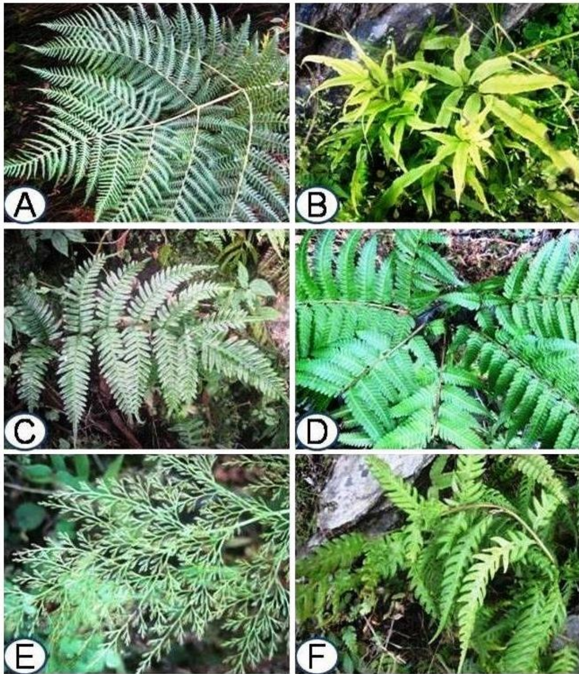
Figure 5. A, Pteridium aquilinum (L.) Kuhn; B, Pteris cretica Linn; C, Pteris excelsa Gaud; D, Pteris wallichiana J. Agardh; E, Onychium contiguum Wall ex Hope; F, Woodwardia unigemmata (Makino) Nakai.