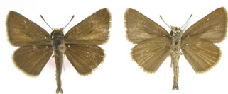
Fig. 8. Copaeodes castanea : Pilão de Pedra, São José dos Pinhais, Paraná, 850m, 28-III-1977, Mielke leg., DZUP 25.175.