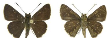
Fig. 11. Gallio carasta : 16 km NO Bateias, Campo Largo, Paraná, 800m 11-III-2000, Mielke leg., OM 51.646.

Hesperiidae than Ponta Grossa (Mielke et al. 2012a), given the exceptionally sampling effort made in this last municipality. Both locations present a similar vegetation landscape, characterized by the mixture of grasslands with Araucaria Forest; therefore it is expected that the butterfly composition should be similar between Balsa Nova and those localities.