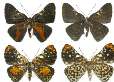
Fig. 17. Symmachia aconia : (male above) Morro do Anhangava, Quatro Barras, Paraná, 1435m, 11-III-2010, E. Carneiro leg., DZUP 25.235; (female below) Britador, Turvo, Paraná, 1000m, 19-II-2010, D.R. Dolibaina, leg., DZUP 25.195