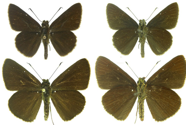
Fig. 12. Lerema duroca lenta : (male above) Pilão de Pedra, São José dos Pinhais, Paraná, 850m, 11-II-1993, O & C. Mielke leg., OM 34.799; (female below) São Luiz do Purunã, Balsa Nova, Paraná, 950m, 9-II-1981, Mielke & Casagrande, DZUP 25.115.