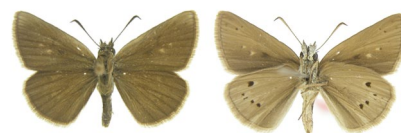
Fig. 16. Panca subpunctuli : Arroio Tiririca, Bom Jesus, Rio Grande do Sul, 1000m, 27-II-1973, Mielke leg., DZUP 24.775.