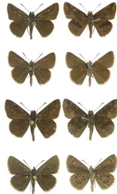
Fig. 14. Species of Vidius (from above to below). Vidius vidius : Curitiba, Paraná, 900m, 13-II-1975, O. Mielke leg., DZUP 1.682; Vidius fido : Vila Velha, Ponta Grossa, Paraná, 900m, 8-III-1971, Mielke leg., DZUP 25.035; Vidius similis : Pilão de Pedra, São José dos Pinhais, Paraná, 18-II-1982, Mielke & Casagrande leg., DZUP 25.275; Vidius mictra : 30 km L Tibagi, Tibagi, Paraná, 1050m, 14-XII-2008, O.-C. Mielke leg. DZUP 25.285.