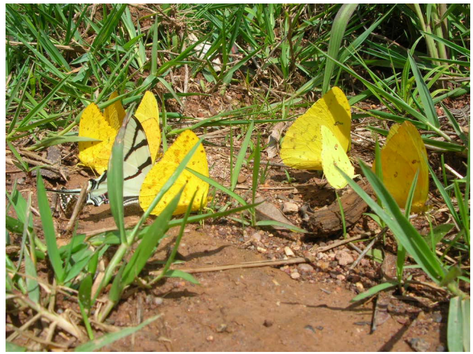
Fig. 6. Different butterfly species puddling on mud in São Luiz do Purunã, Balsa Nova, Paraná. Pyrgus orcynoides (Giacomelli, 1928), Eurytides bellerophon (Dalman, 1823), Phoebis argente argente (Fabricius, 1775), Phoebis philea philea (Linnaeus, 1763), and Phoebis sennae marcellina (Cramer, 1777).