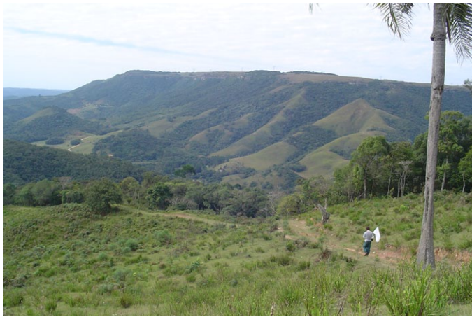
Fig. 2. Typical habitat in São Luiz do Purunã, where grassland habitats are found in a mosaic landscape with forest patches.