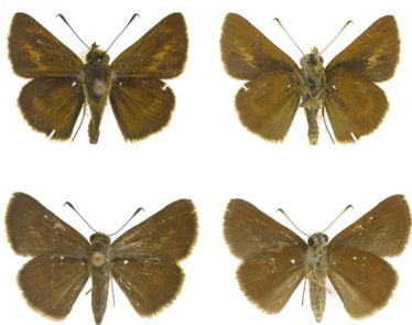
Fig. 9. Corticea obscura : (male above) Curitiba, Paraná, 900m, 9-III-1971, O. Mielke leg. DZUP 25.295; (female below) Parque Pedras Brancas, Lages, Santa Catarina, 920m, 13-II-1973, Mielke & Sakakibara leg., DZUP 24.795.