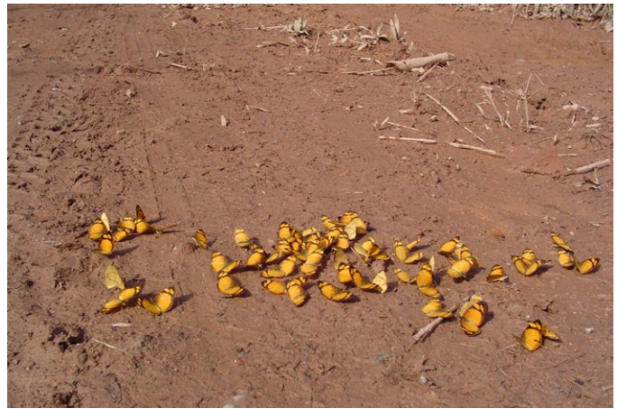
Fig. 5. Aggregation of Tegosa claudina puddling on mud in São Luiz do Purunã, Balsa Nova, Paraná.