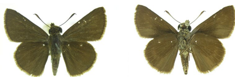
Fig. 10. Euphyes cherra : Vila Velha, Ponta Grossa, Paraná, 900m, 1-III-1967, Mielke leg., DZUP 25.005.