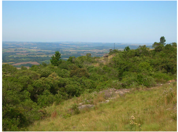
Fig. 4. View of the grassland area where the butterflies were sampled.