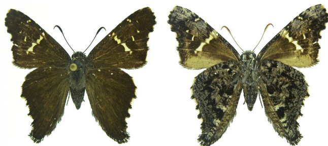
Fig. 7. Typhedanus azyrus : Alto da Serra, Morretes, Paraná, 800m, 19-III-1989, Mielke leg., OM 21.489.