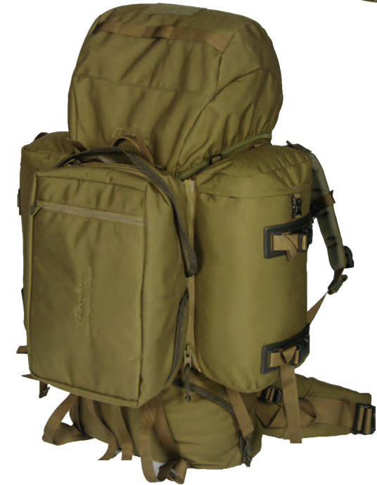
MMPS CRUSADER - ORGANISER PLUS POCKET

MMPS DELIVERS THE FLEXIBILITY TO CARRY ANY LOAD FROM 10L UP TO 120L OF KIT PLUS SPECIFIC FUNCTIONAL POCKETS LIKE HYDRATION & ORGANISER POCKET