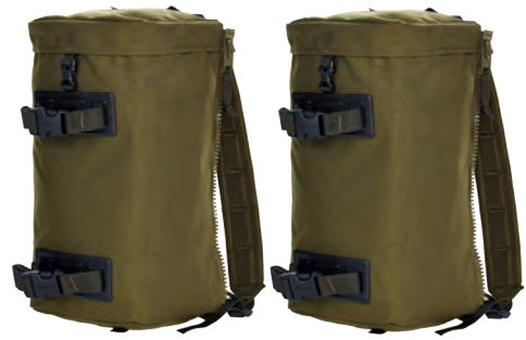
MMPS LARGE POCKETS