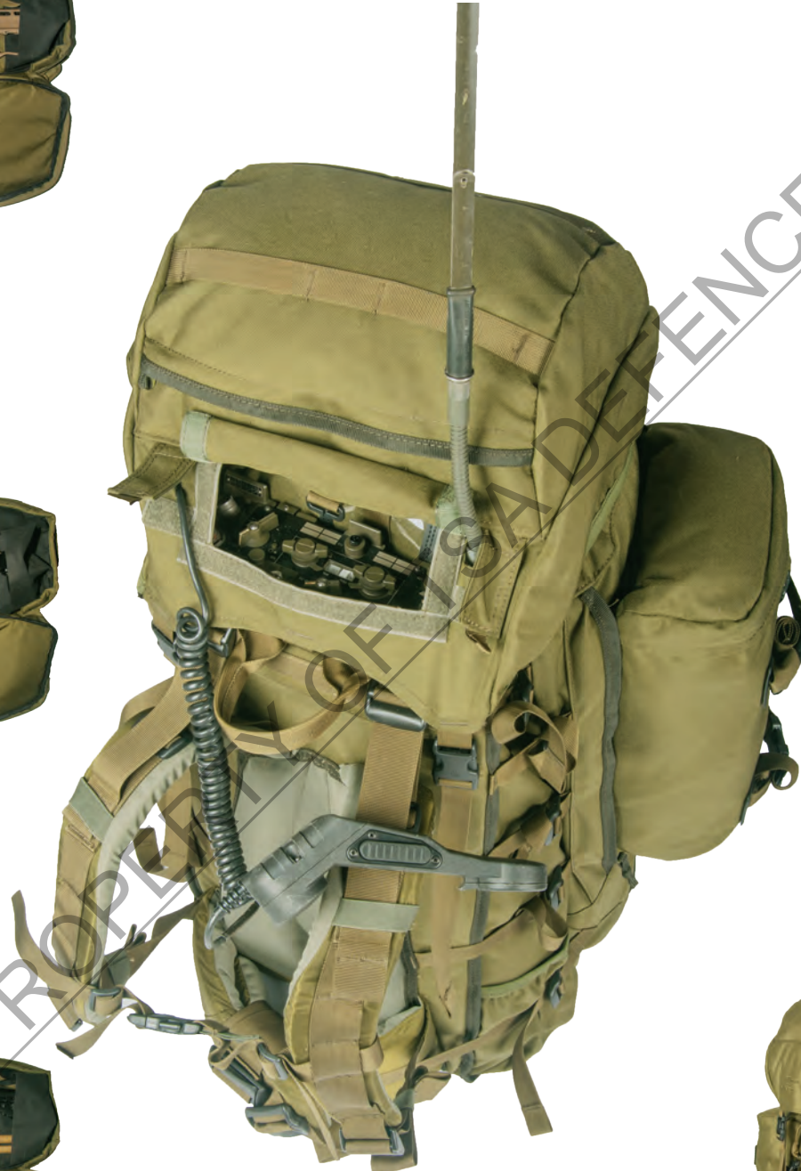
FMPS CRUSADER EC