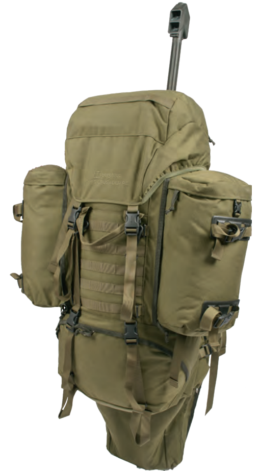
SMPS DRAGBAG LONG SMPS FOLDABLE DAYPACK & SIDE POCKETS