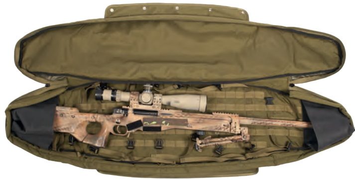
SMPS DRAGBAG LONG