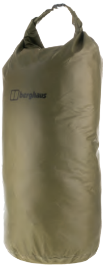
MMPS POCKET LINER