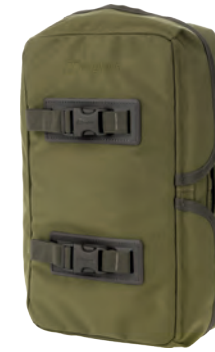
MMPS ORGANISER POCKET