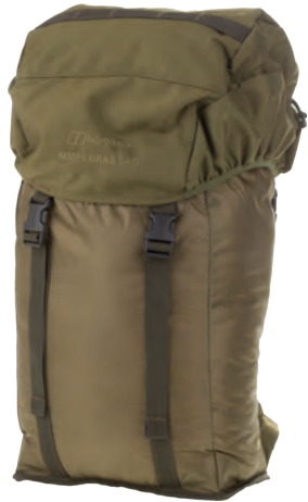
MMPS GRAB BAG