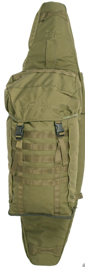
SMPS DRAGBAG LONG & SMPS FOLDABLE DAYPACK