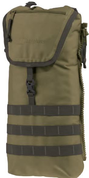
MMPS HYDRATION POCKET