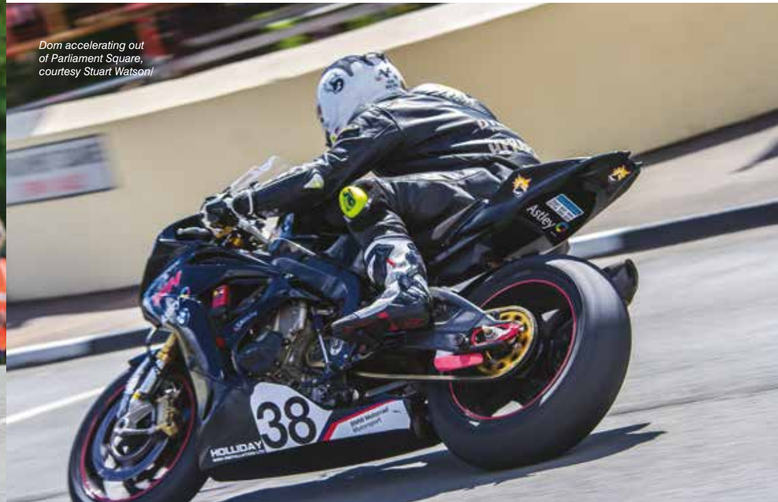
Dom accelerating out of Parliament Square, courtesy Stuart Watson!