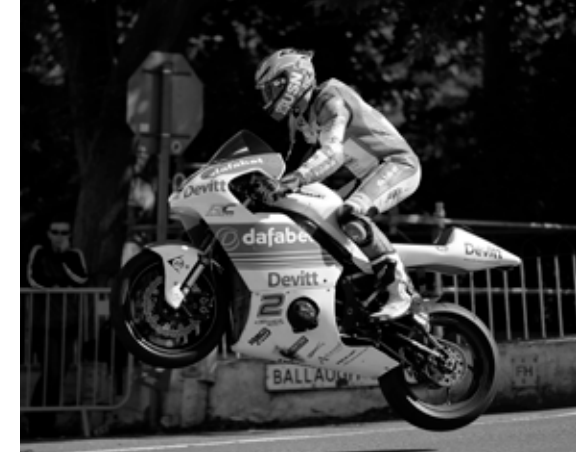
Leaping Ballaugh Bridge