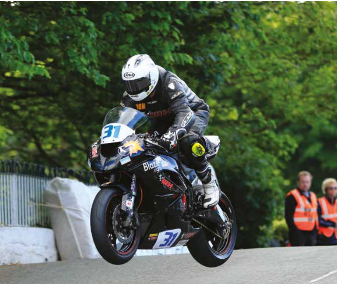
Riding high at Ballaugh