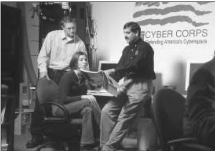
TU has emerged as a national leader in computer security education and research – conducting extensive sponsored research through its federally-endorsed Center for Information Security and training computer security Ph.D.s.