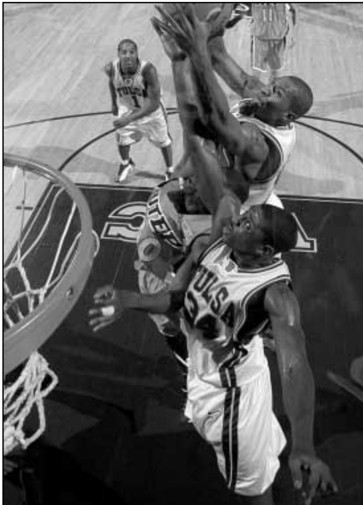
The men's basketball team soared to the top with it's first ever WAC tournament championship. Even more impressive, TU's student-athletes' high academic standards made them the only school to be ranked in the top 10 in all 3 USA Today/NCAA Academic Achievement Awards categories.