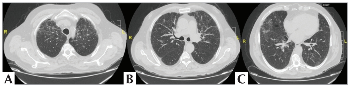
Figure 2. In chest computed tomography, irregular reticulations and ground-glass areas in both lungs (A-C), scattered air cysts in both lung parenchyma (C).

Although 5% of LIP cases are asymptomatic, chronic cough and progressive dyspnea are the most common complaints. Respiratory symptoms are present in most patients at diagnosis. Weight loss, fever, night sweats, pleuritic chest pain, muscle weakness, arthralgia are other systemic symptoms. On physical examination, clubbing (10%), hepatosplenomegaly, lymphadenopathy, parotitis, and arthritis can be seen due to the etiology. Clubbing is a common physical finding, peripheral and mediastinal lymphadenopathy, and splenomegaly are scarce (3). In our case, increased dyspnea in the last six months was the most important symptom, auscultation findings of the respiratory system was normal and other systems findings were also considered normal.