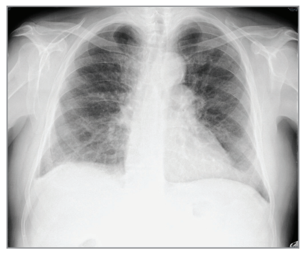
Figure 1. Posteroanterior chest radiography shows flattening of the right diaphragm, prominence in the pulmonary conus, enlargement in the right paratracheal area, diffuse reticular densities prominent towards the lower zones.

Posteroanterior chest radiography was compatible with diffuse reticular densities that became apparent towards the lower zones (Figure 1). As a result of