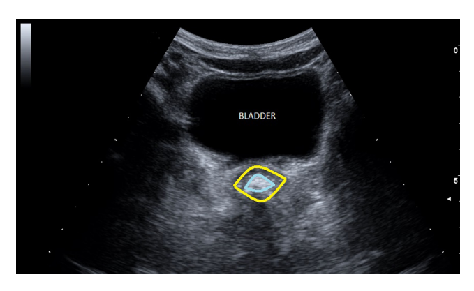
Figure 3. Five-year-old boy. Axial plane USG images at bladder neck. The inner wall (blue line) and outer wall (yellow line) of the rectum are shown. The rectum wall thickness was measured from the front wall near the bladder.