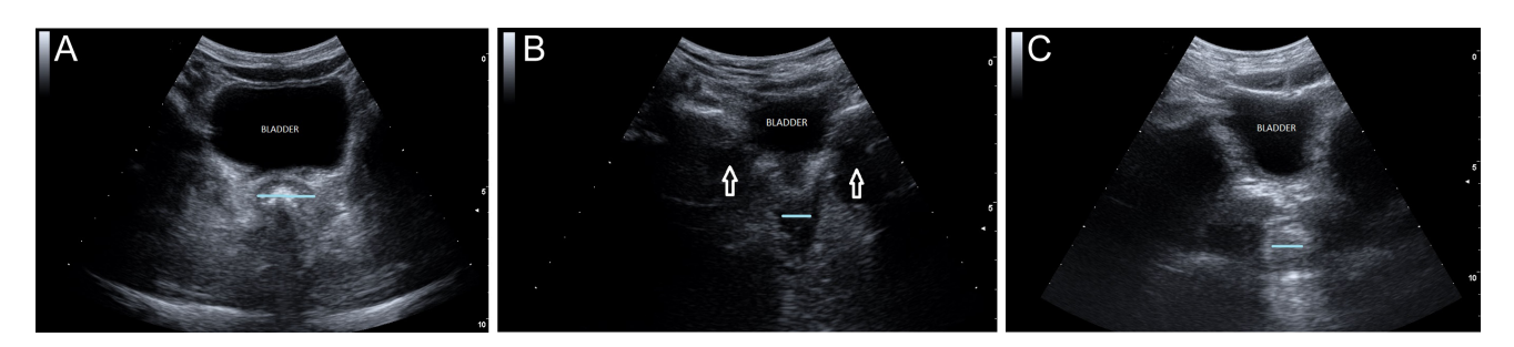
Figure 2. Five-year-old boy. (A) In the axial plane, the US image taken at the symphysis level, the rectum mediolateral diameter (blue line) was measured from outer wall to outer wall. (B) The diameter of the rectum (blue line) was determined by a similar method at the level of the ischial spine. (C) The white arrows show the areas with acoustic shadow created by the spine. The transducer angles downwards. When the ischial spine echo disappears, the bladder neck is reached. The rectum diameter was measured from this level (blue line).

Turk J Gastroenterol 2022; 33(12): 1062-1068 Doğan et al. Measurement of Rectal Diameter by Ultrasonography