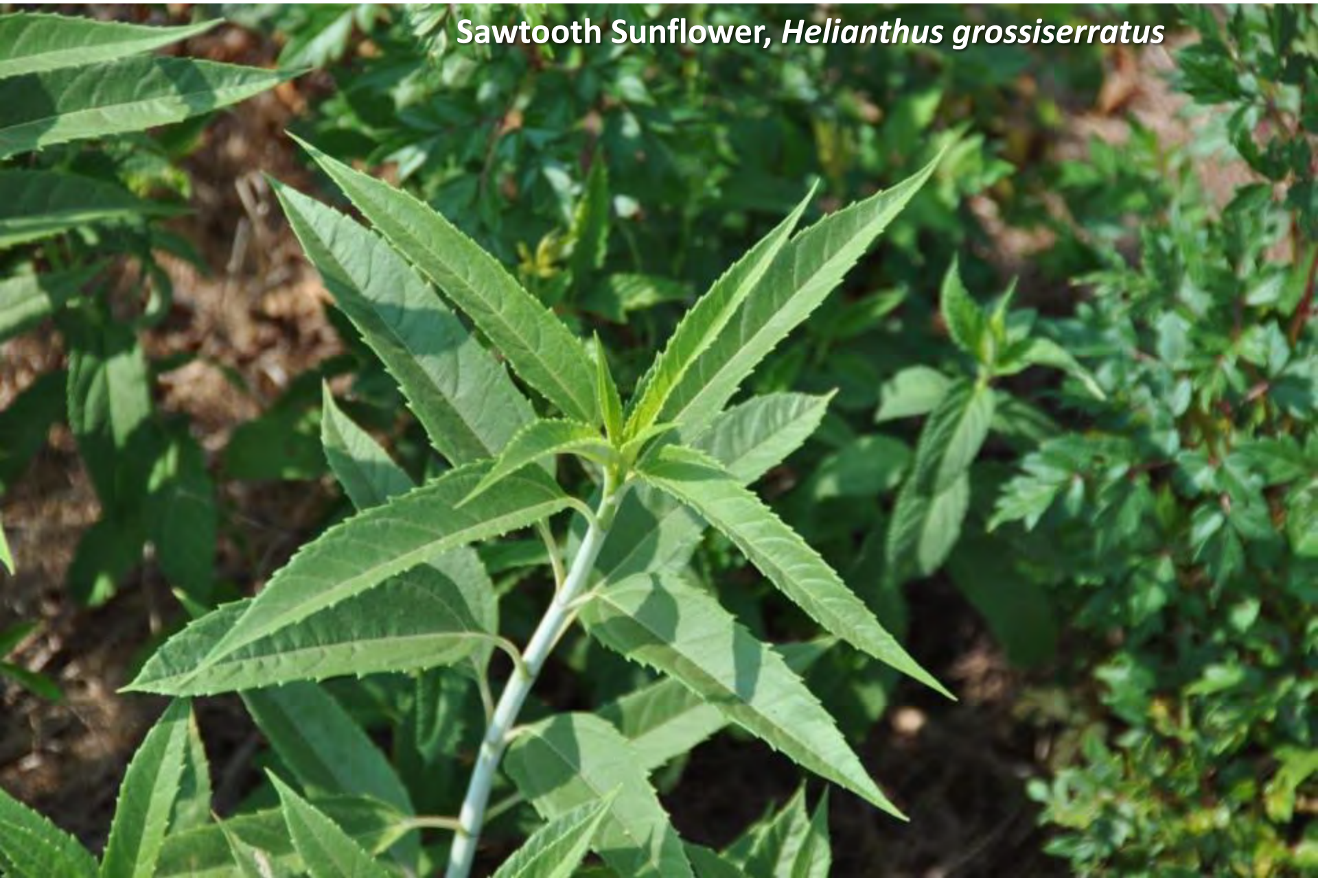
Sawtooth Sunflower, Helianthus grossiserratus