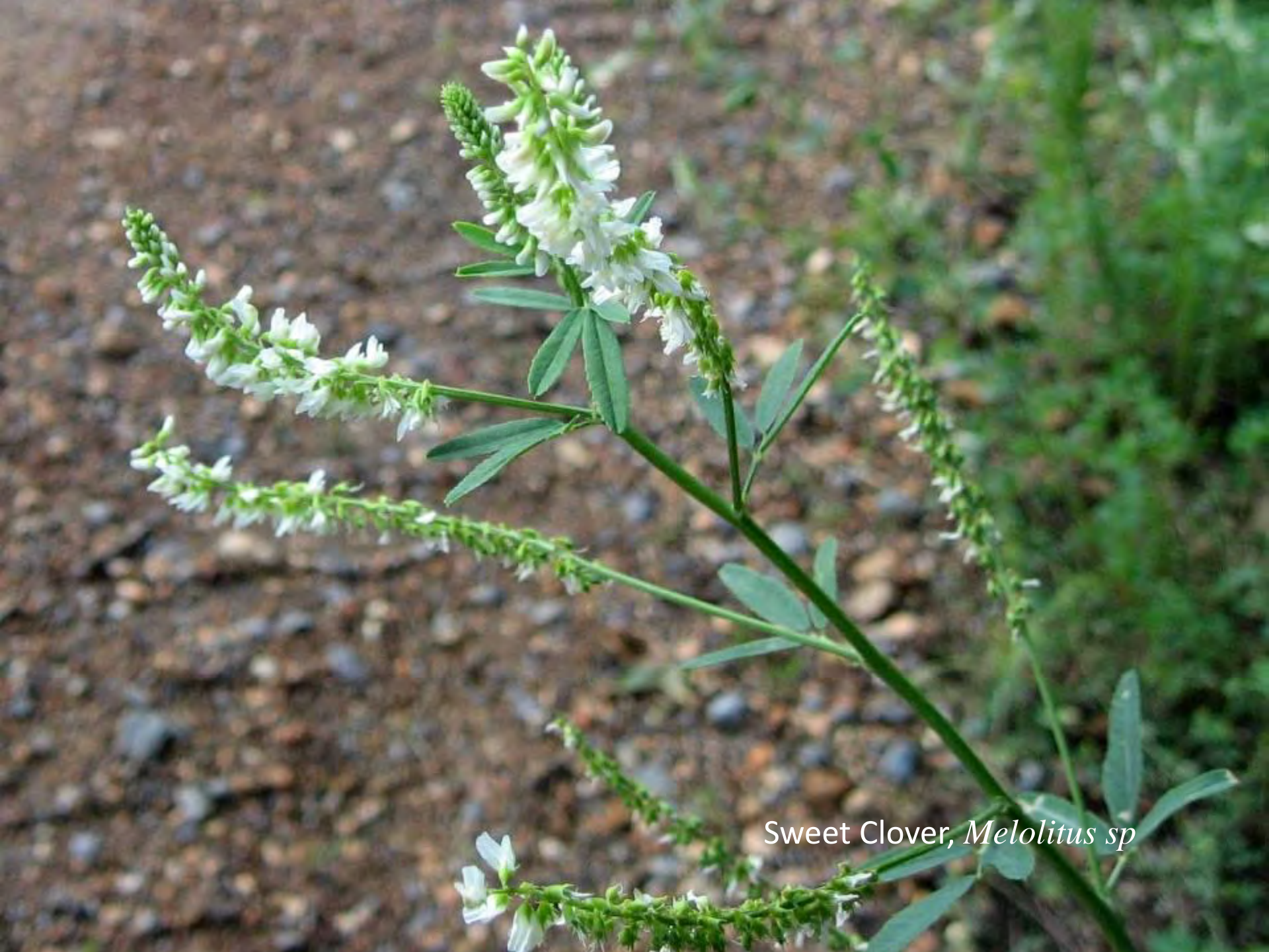
Sweet Clover, Melilotus sp