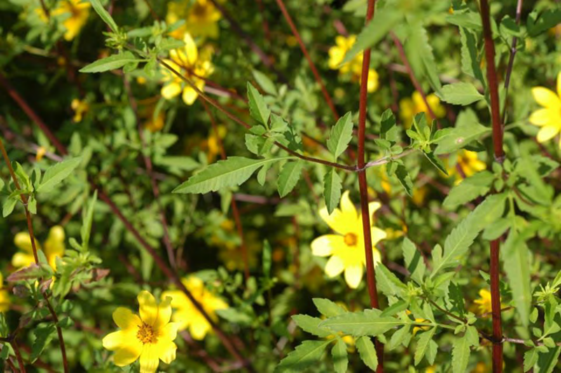
Tickseed Sunflower, Bidens aristosa