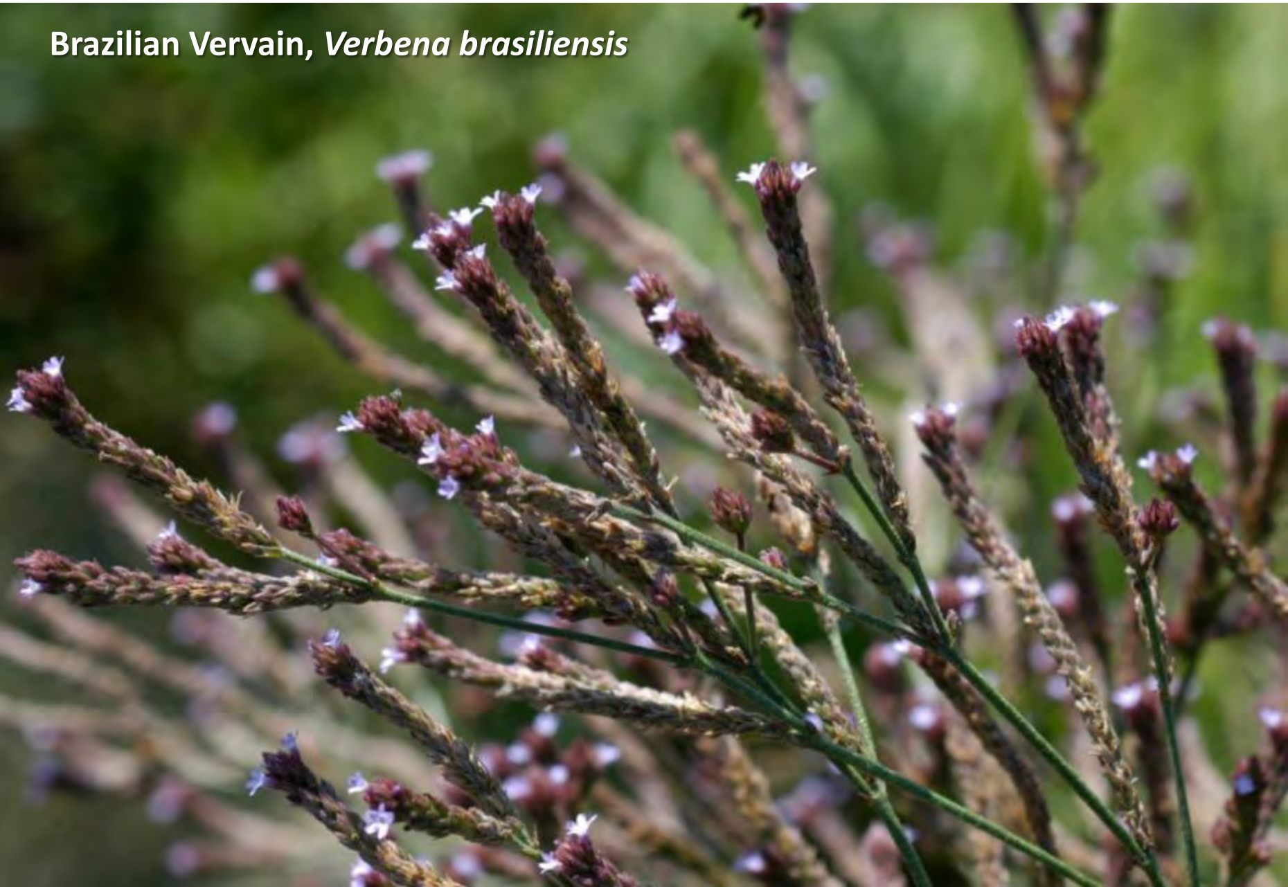
Brazilian Vervain, Verbena brasiliensis