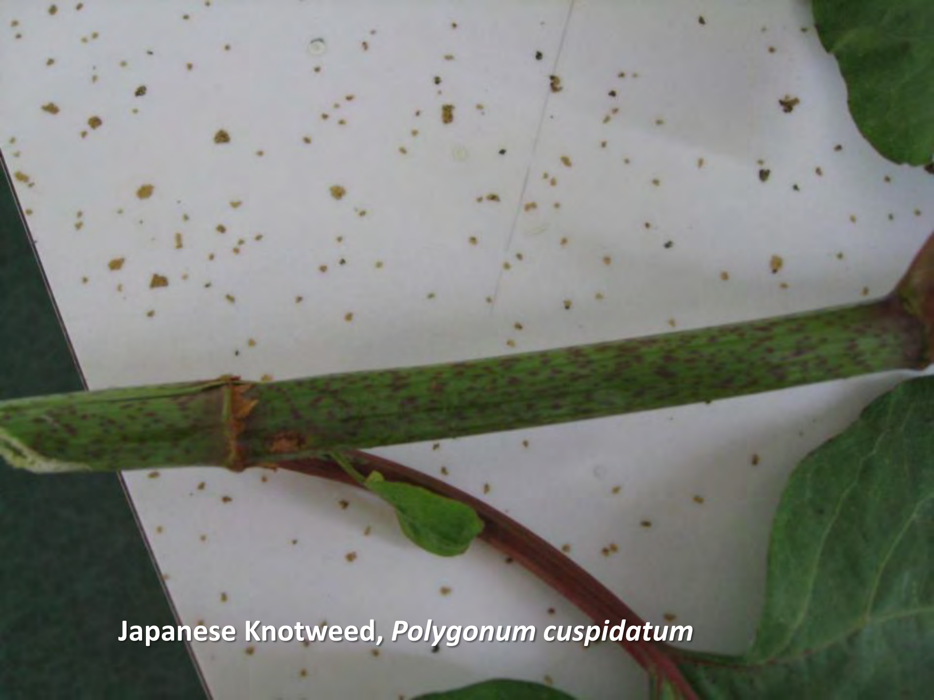
Japanese Knotweed, Polygonum cuspidatum