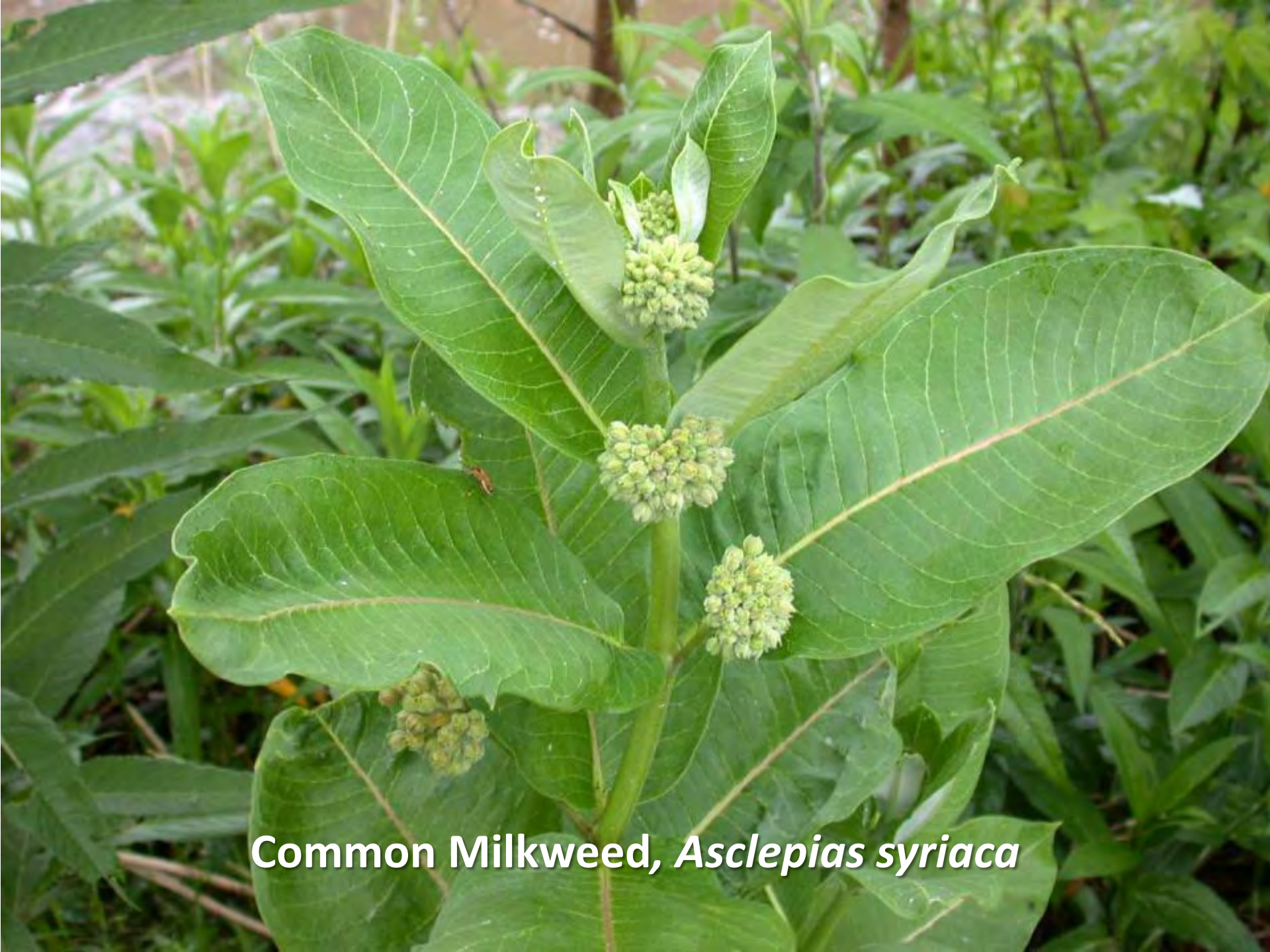
Common Milkweed, Asclepias syriaca