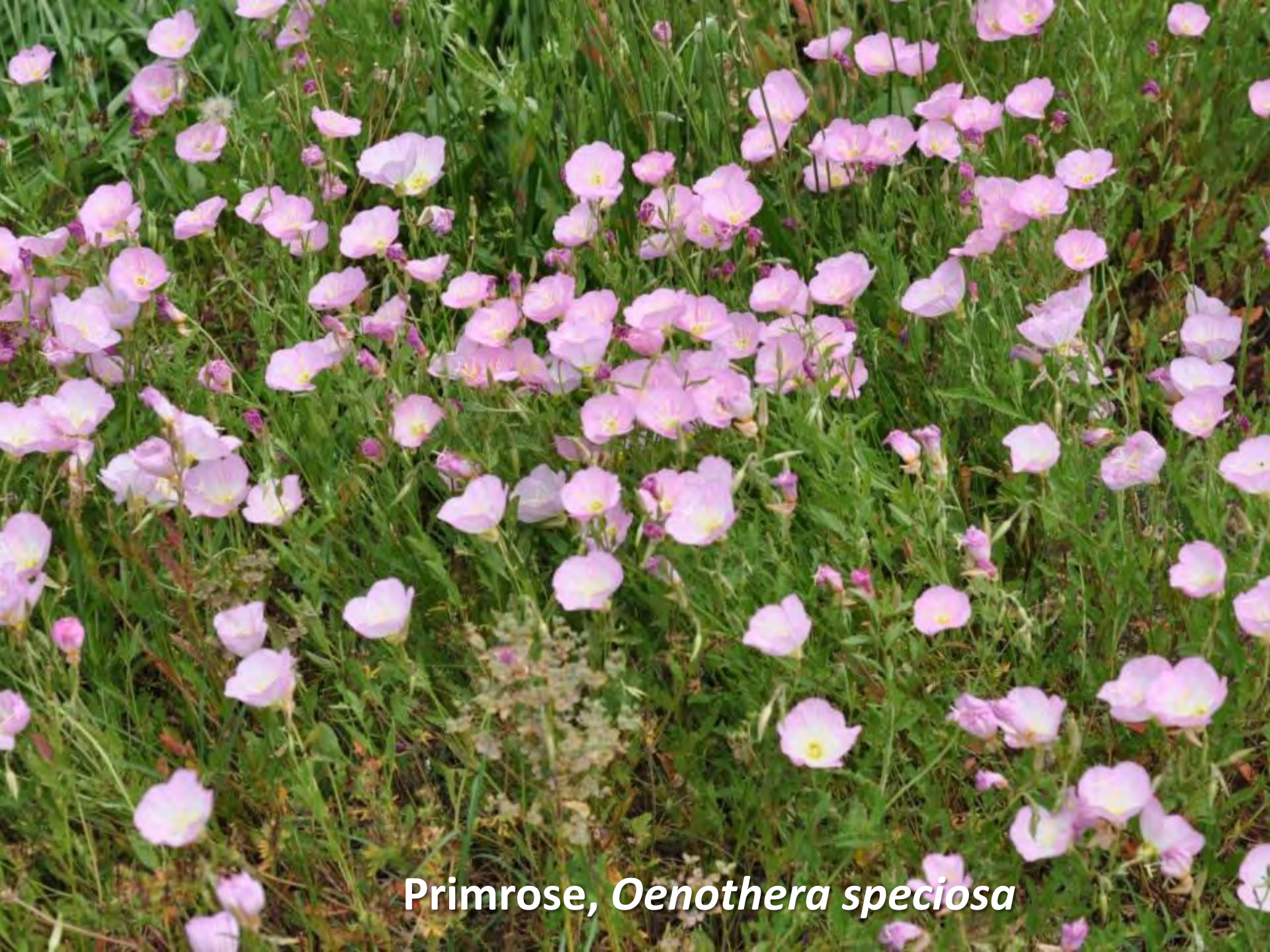
Primrose, Oenothera speciosa