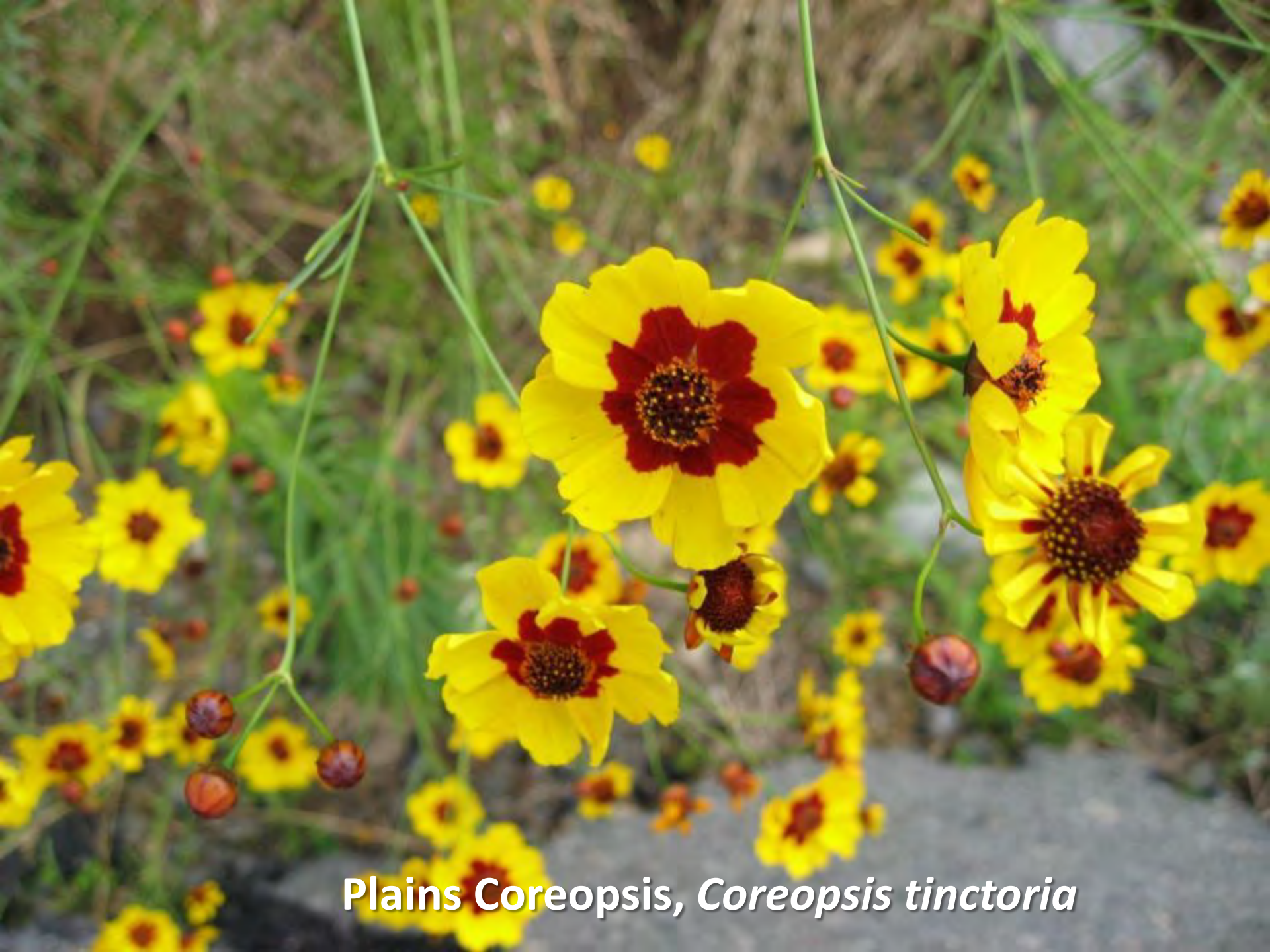
Plains Coreopsis, Coreopsis tinctoria