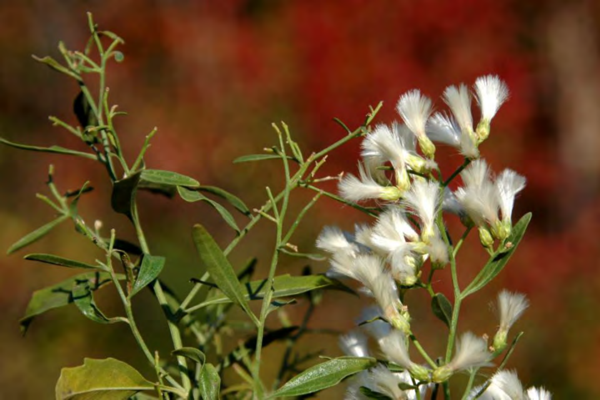
Groundsel Tree, Sea Myrtle, Baccharis halimifolia