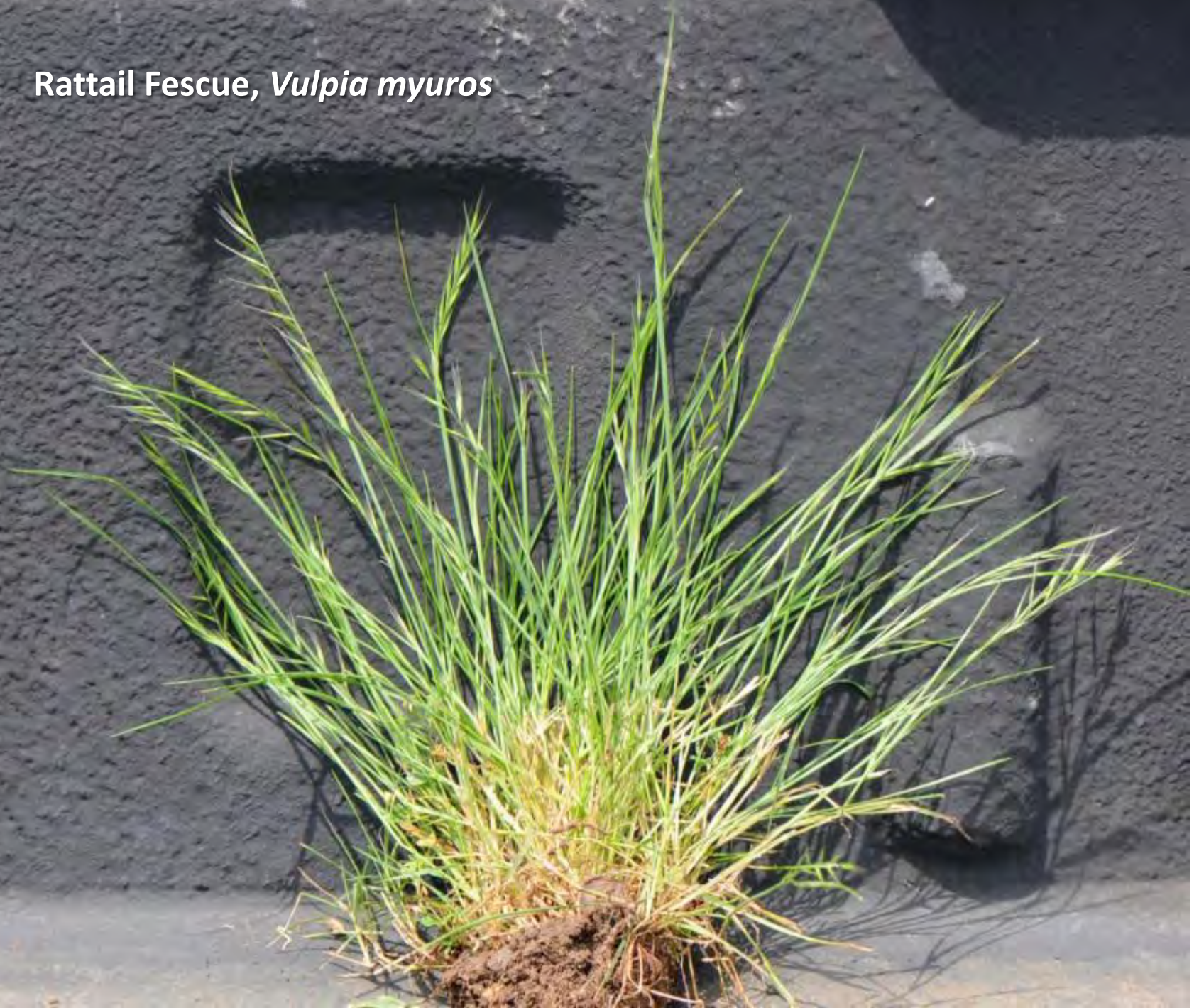
Rattail Fescue, Vulpia myuros