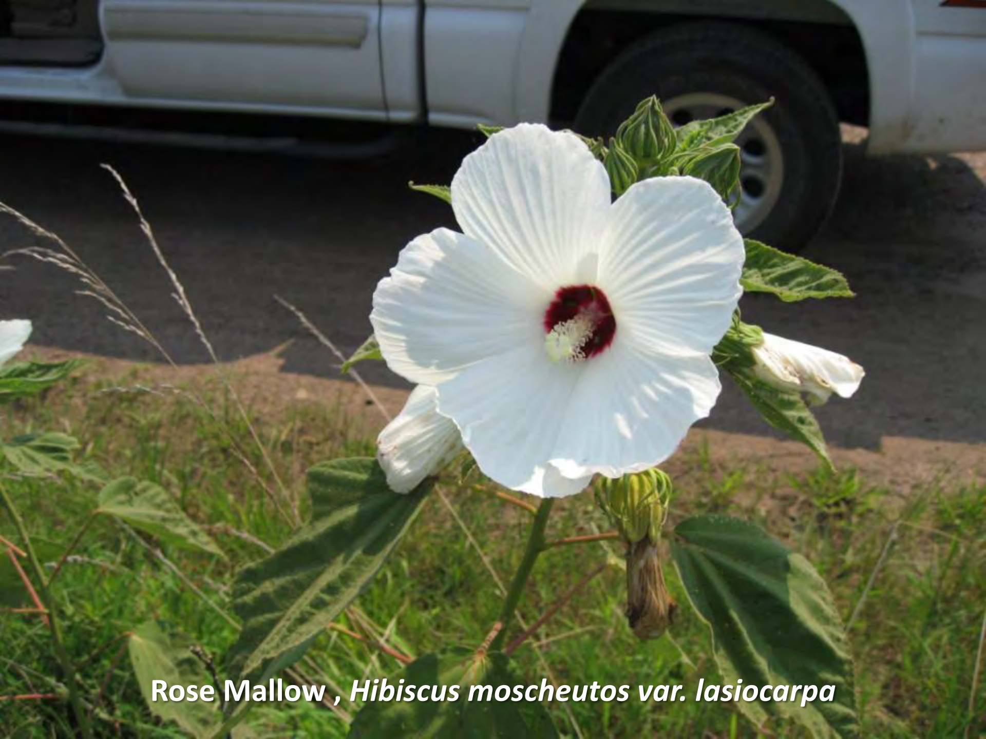
Rose Mallow , Hibiscus moscheutos var. lasiocarpa