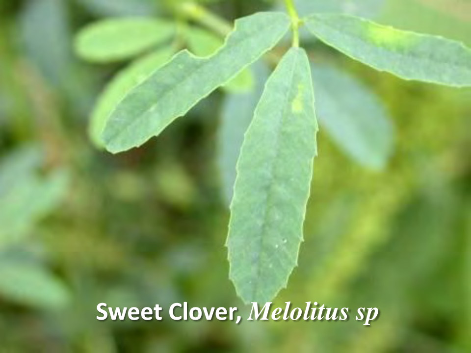
Sweet Clover, Melilotus sp