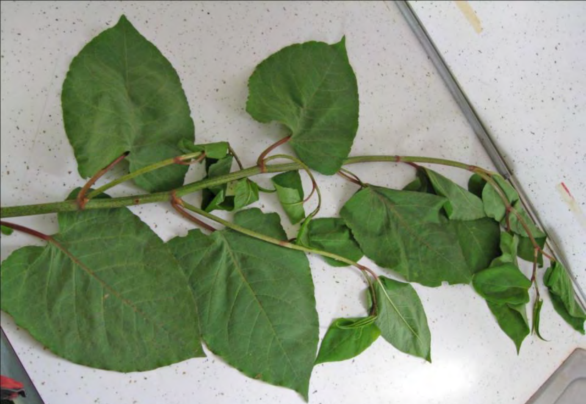
Japanese Knotweed, Polygonum cuspidatum