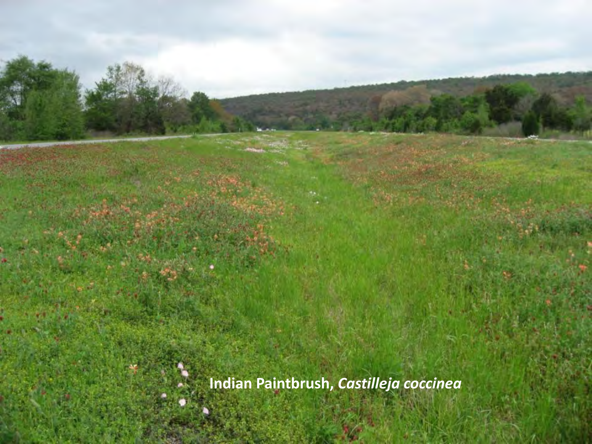
Indian Paintbrush, Castilleja coccinea