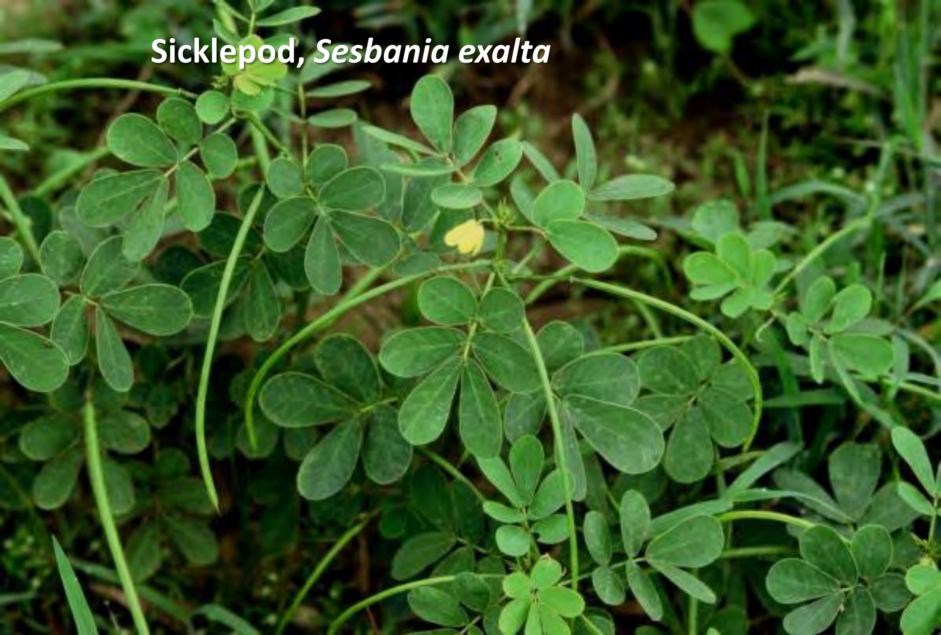
Sicklepod, Sesbania exalta