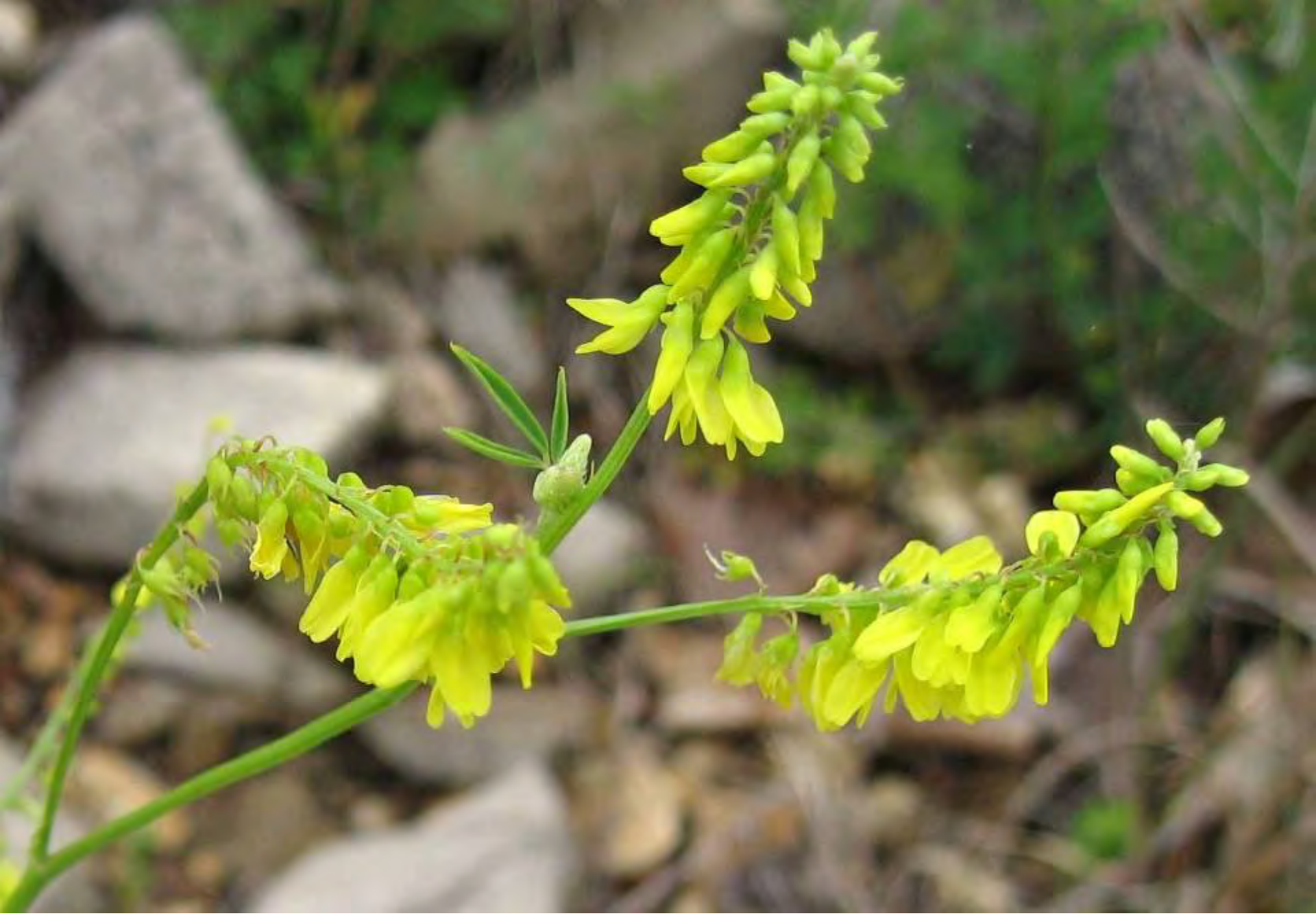
Sweet Clover, Melilotus sp