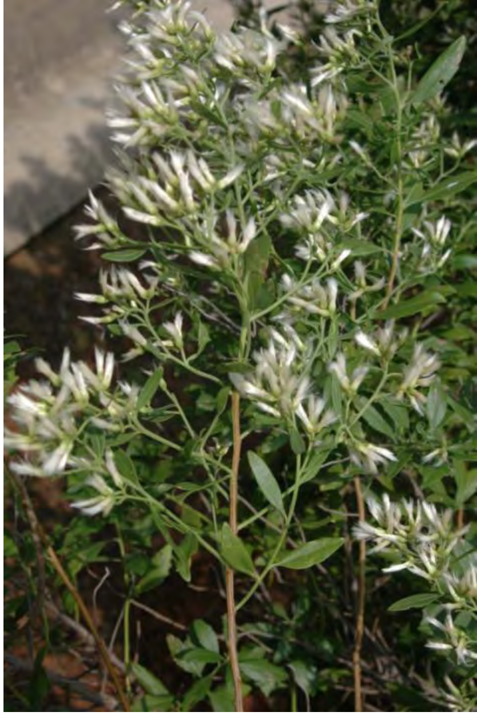
Groundsel Tree, Sea Myrtle, Baccharis halimifolia