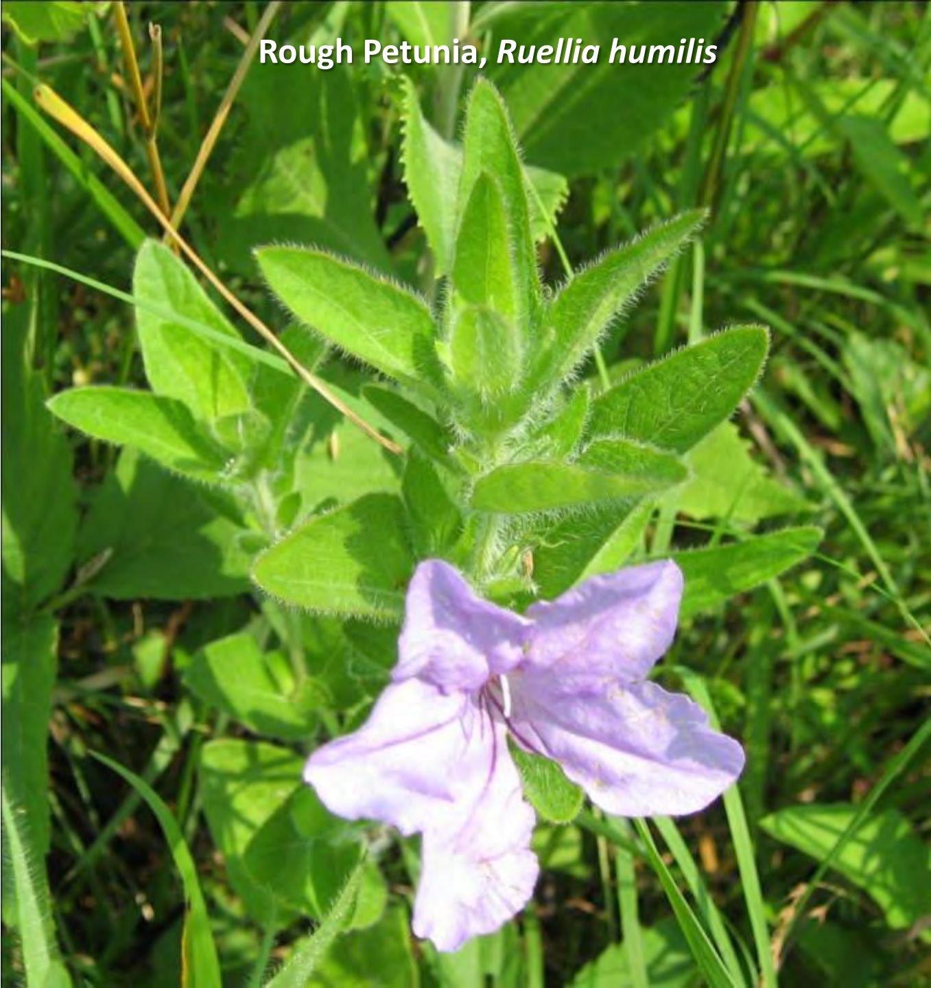
Rough Petunia, Ruellia humilis