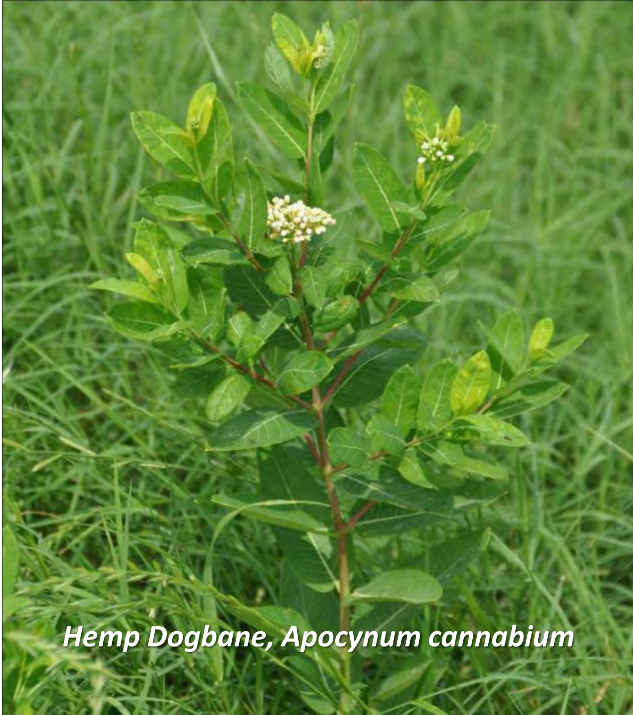
Hemp Dogbane, Apocynum cannabinum