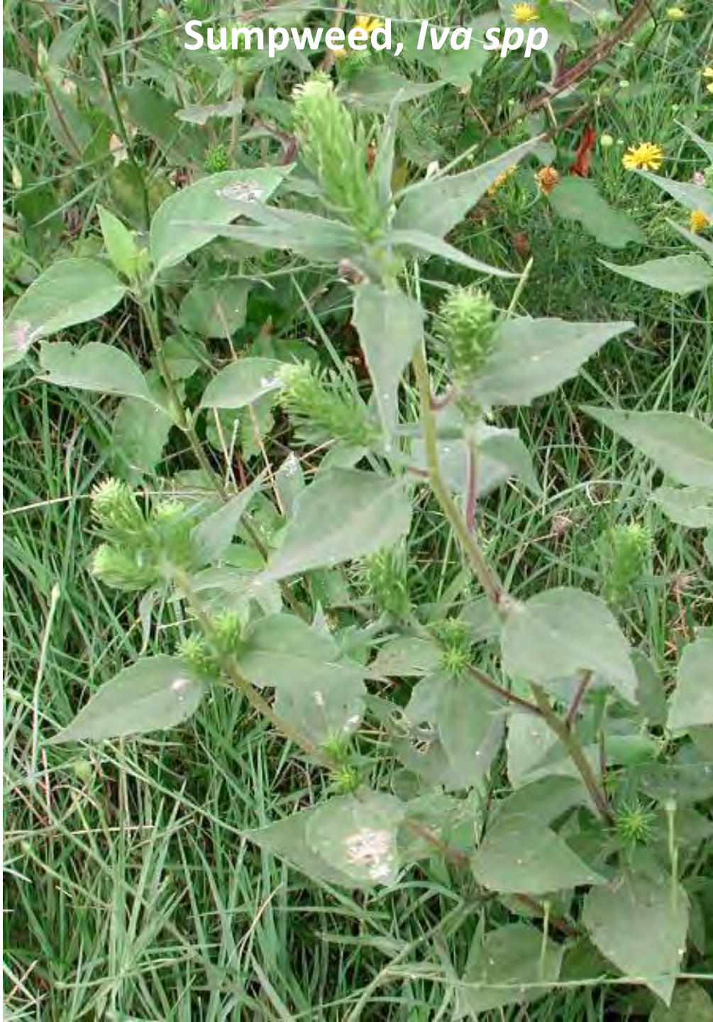
Sumpweed, Iva spp