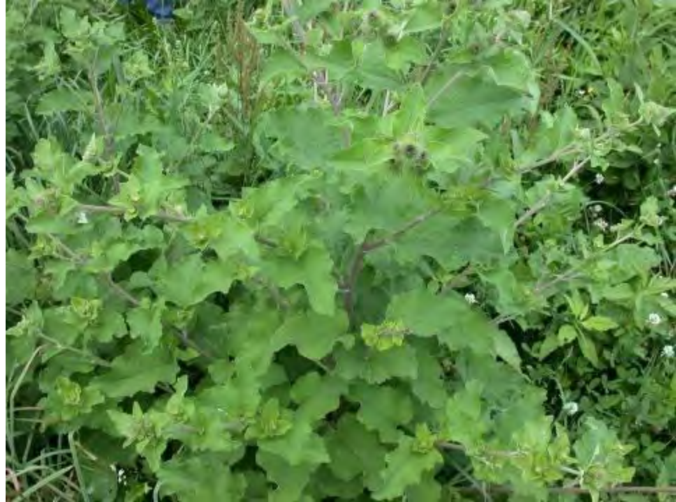
Burdock, Arctium minus