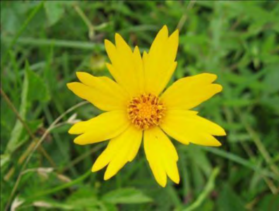
Tickseed Coreopsis, Coreopsis lanceolata