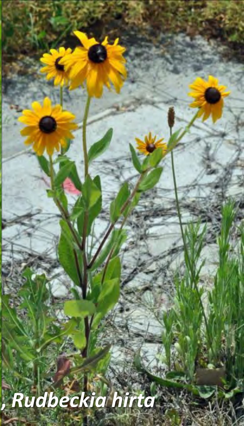
Brown-eyed Susan, Rudbeckia hirta