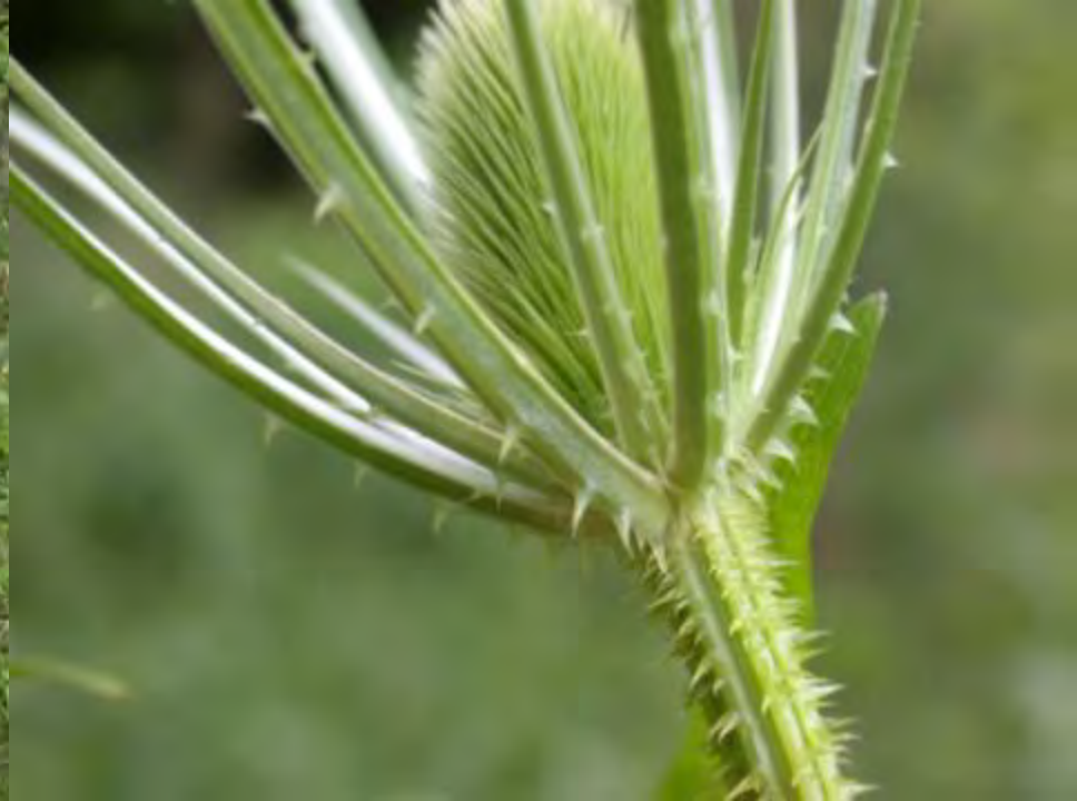
Teasel, Dipsacus fullonum