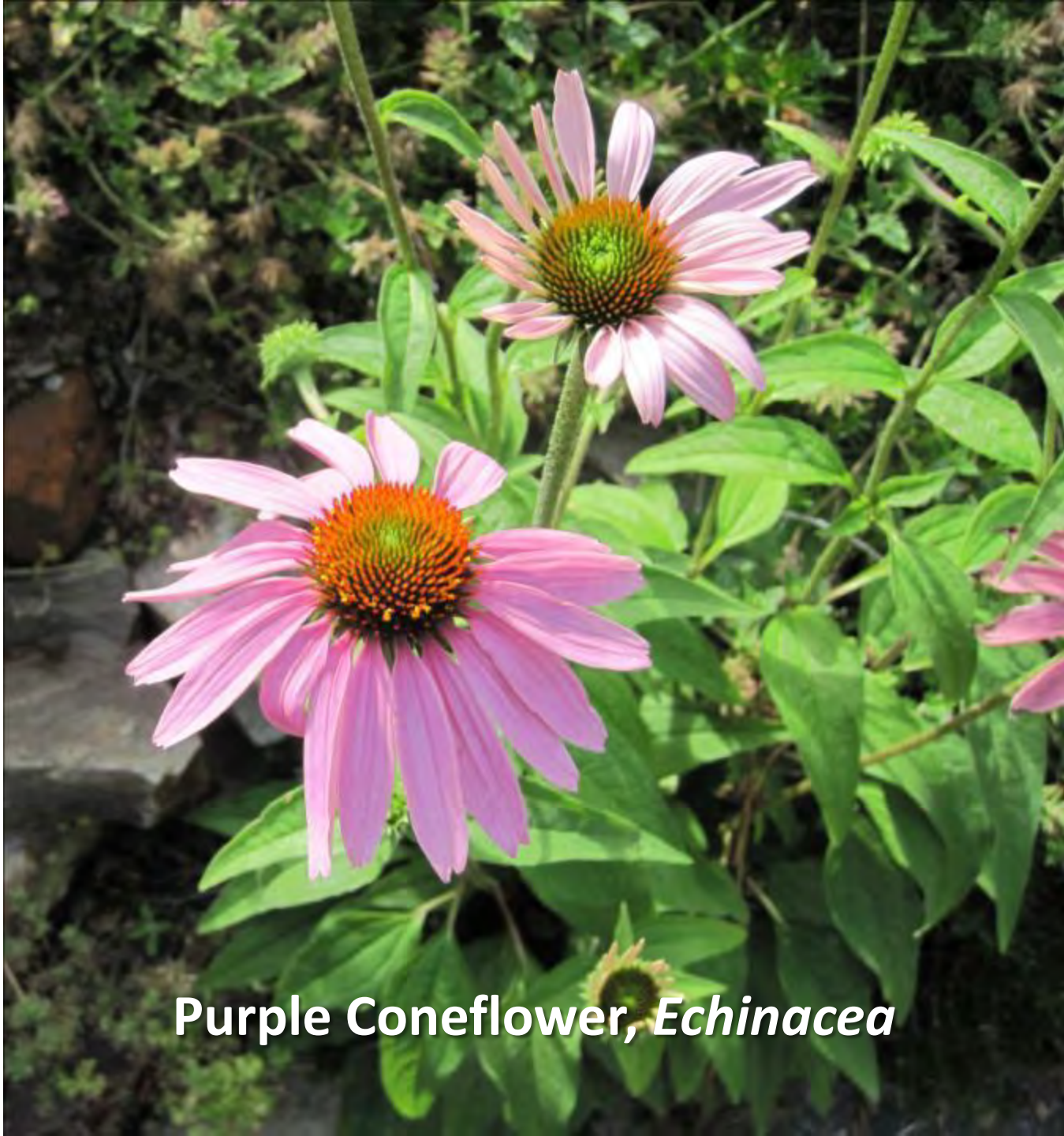
Purple Coneflower, Echinacea