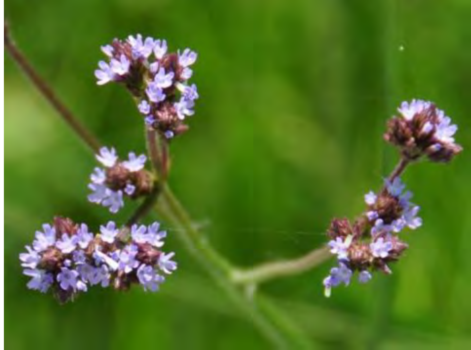
Brazilian Vervain, Verbena brasiliensis