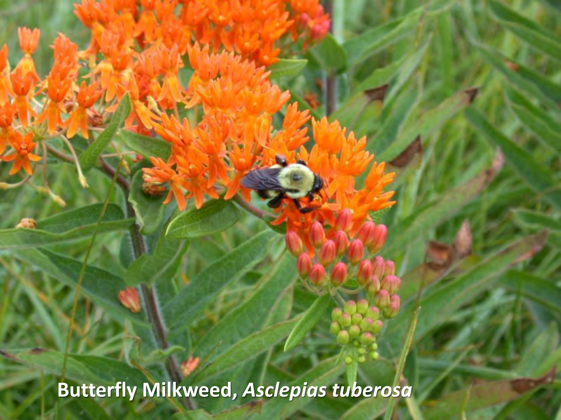
Butterfly Milkweed, Asclepias tuberosa