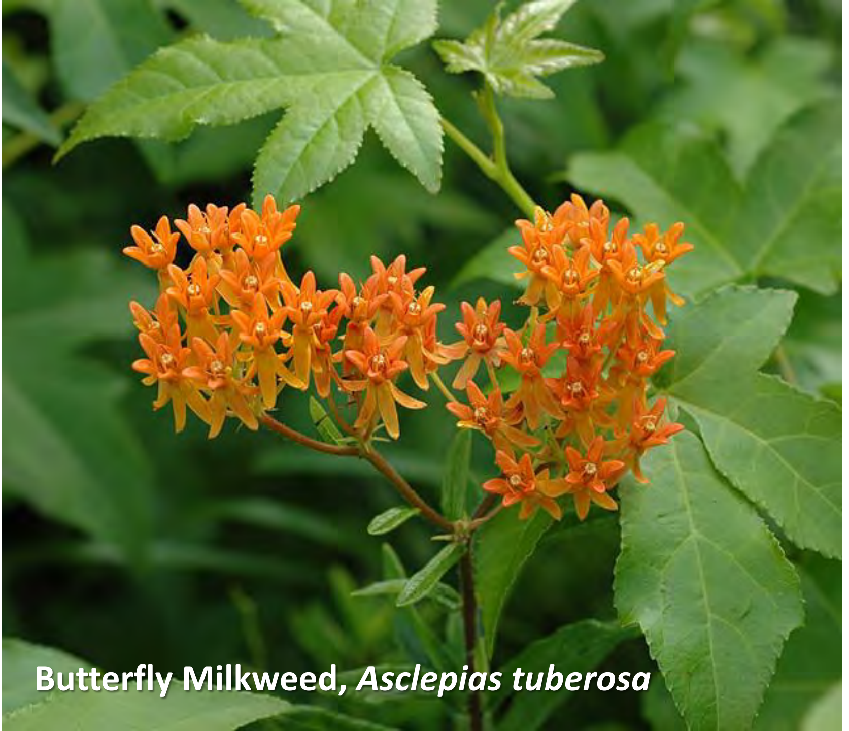
Butterfly Milkweed, Asclepias tuberosa