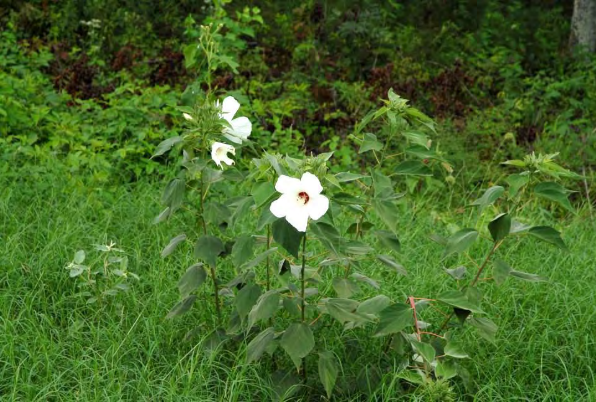
Rose Mallow, Hibiscus moscheutos var. lasiocarpa