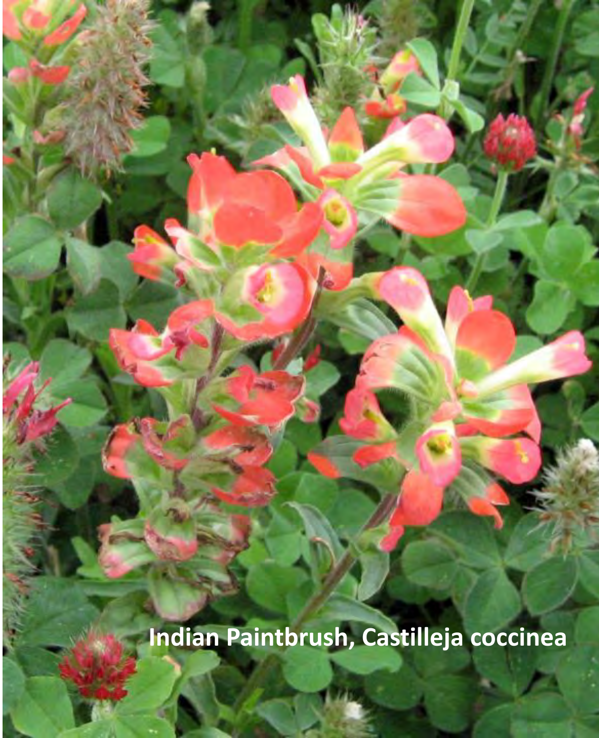
Indian Paintbrush, Castilleja coccinea