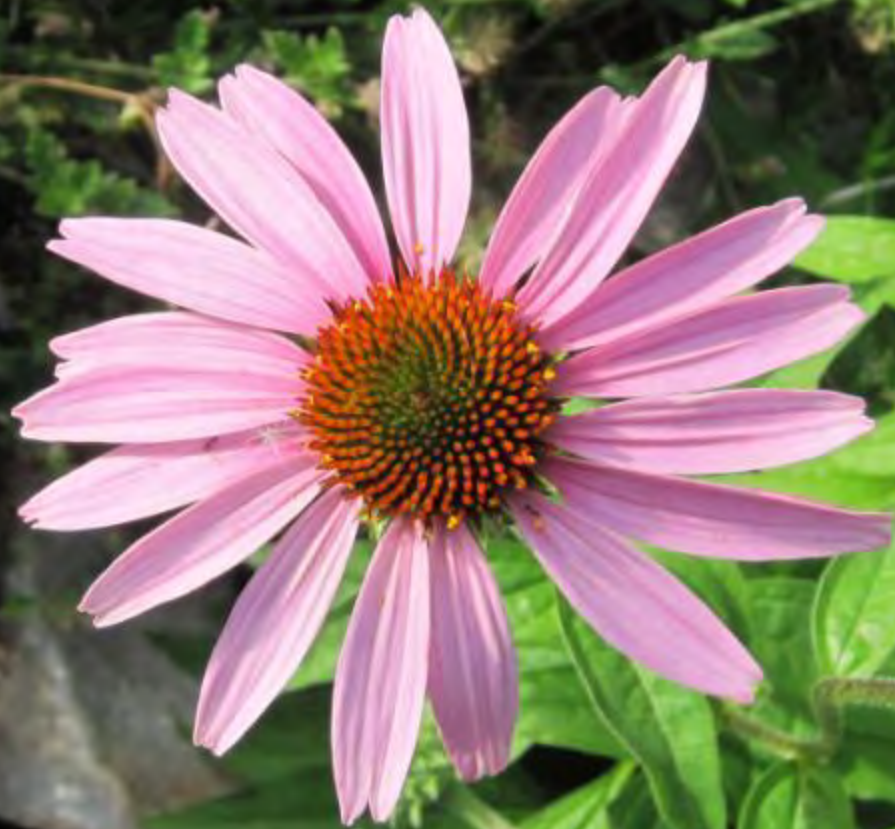
Purple Coneflower, Echinacea