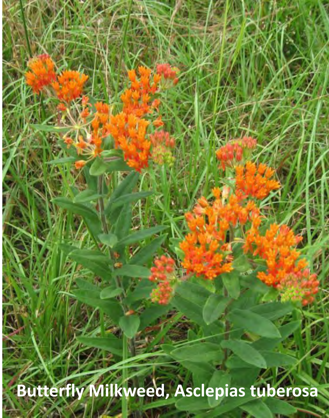
Butterfly Milkweed, Asclepias tuberosa