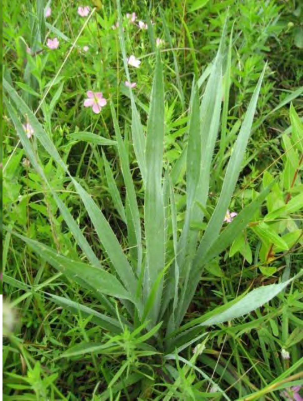
Eryngium yuccifolium Rattlesnake Master