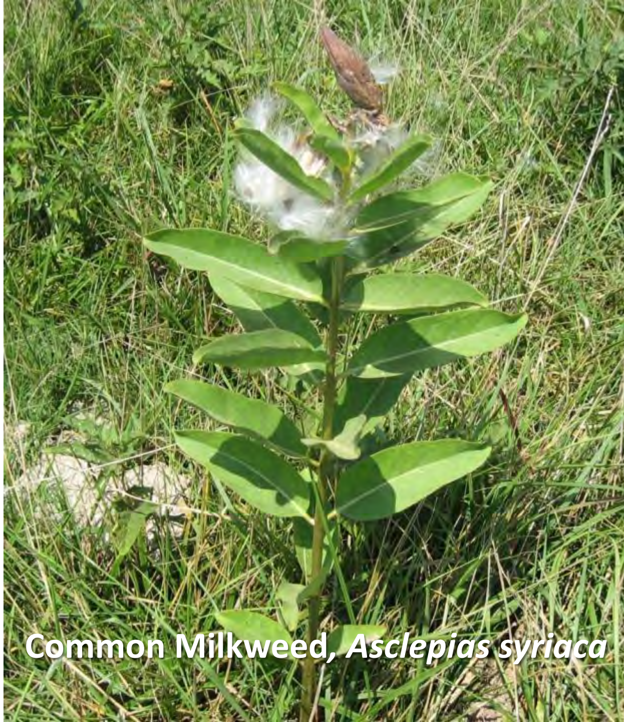
Common Milkweed, Asclepias syriaca