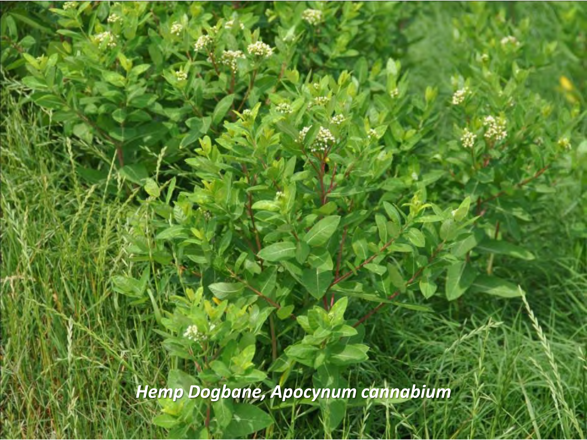
Hemp Dogbane, Apocynum cannabinum