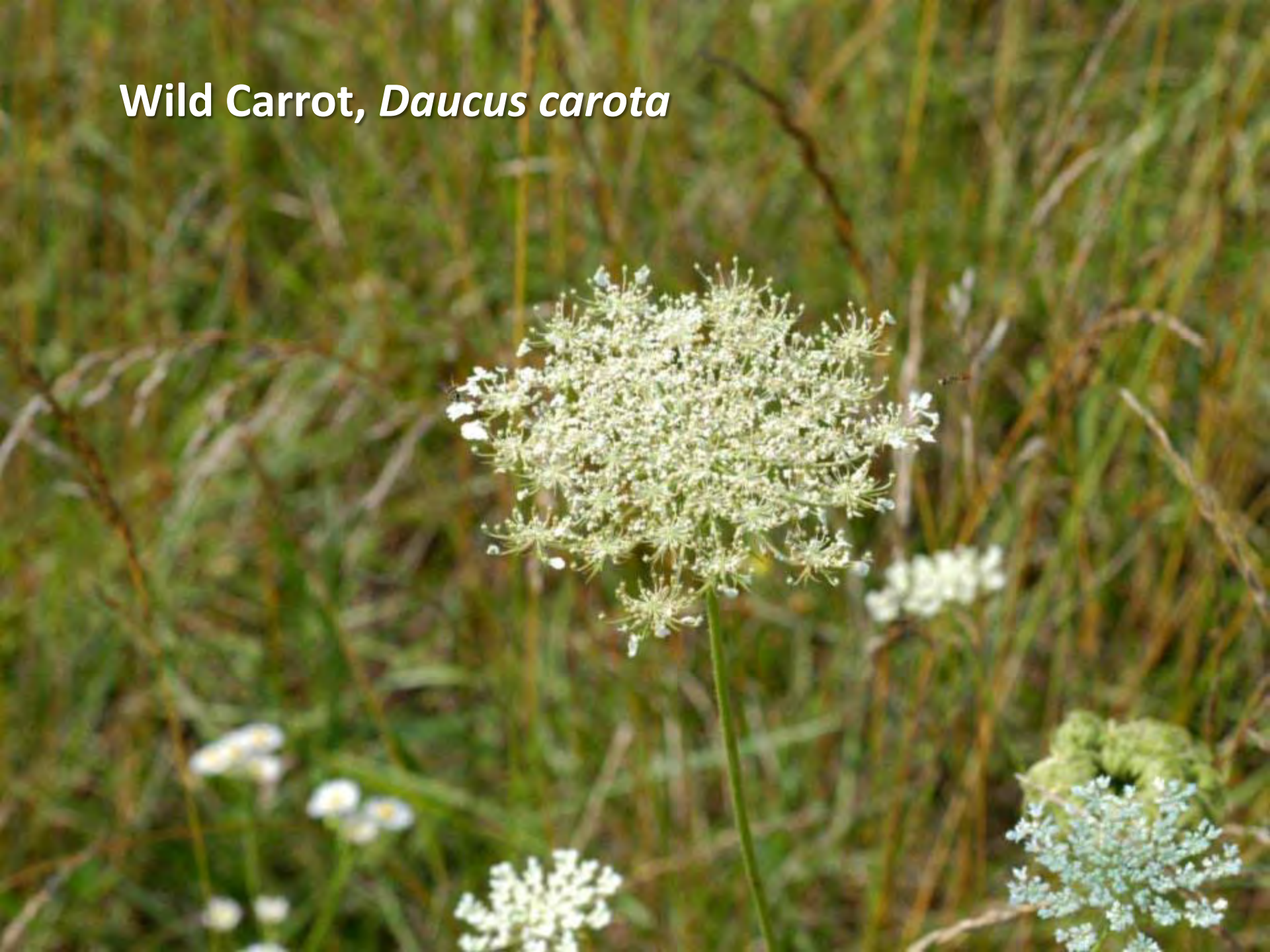
Wild Carrot, Daucus carota