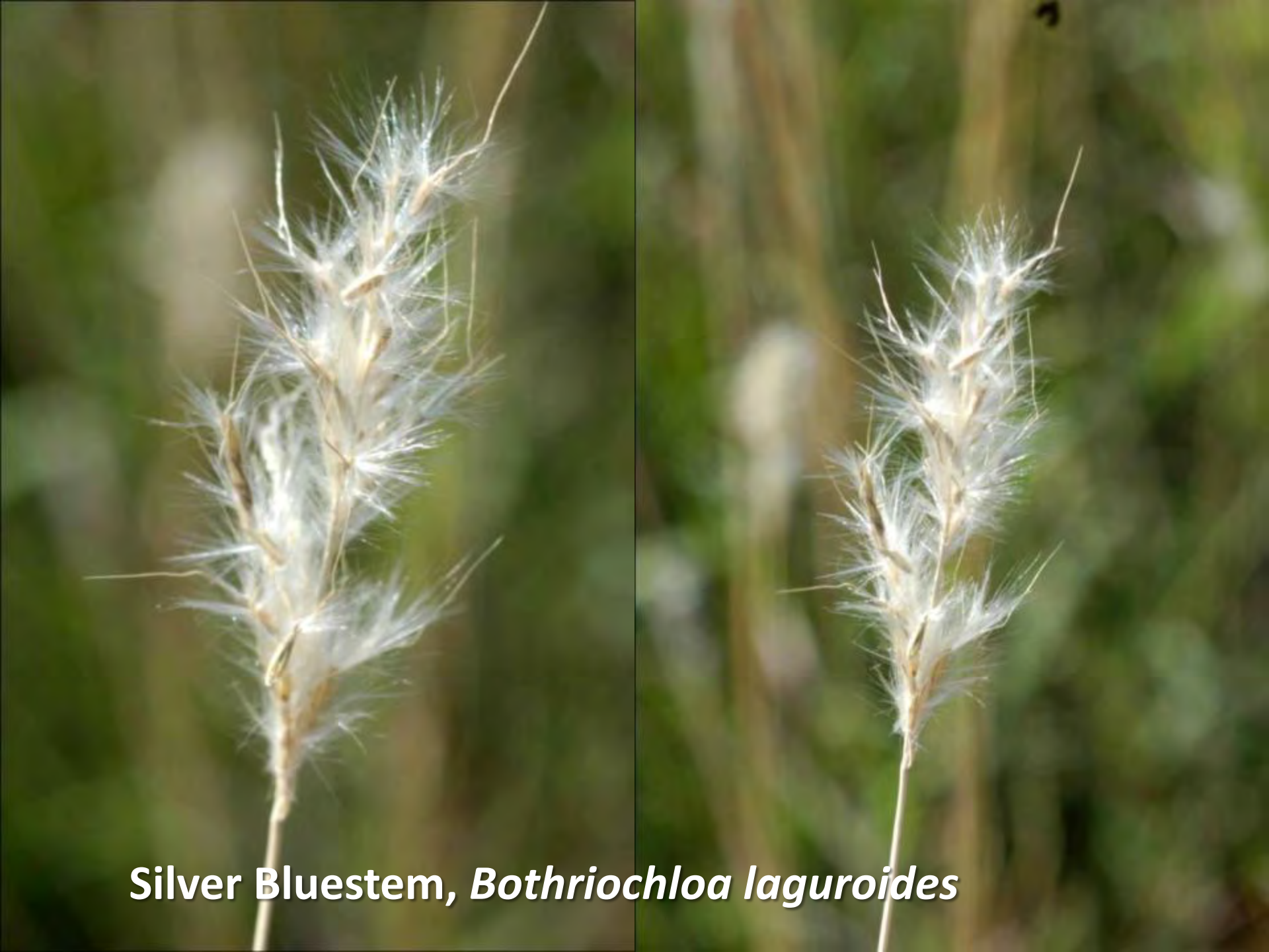
Silver Bluestem, Bothriochloa laguroides