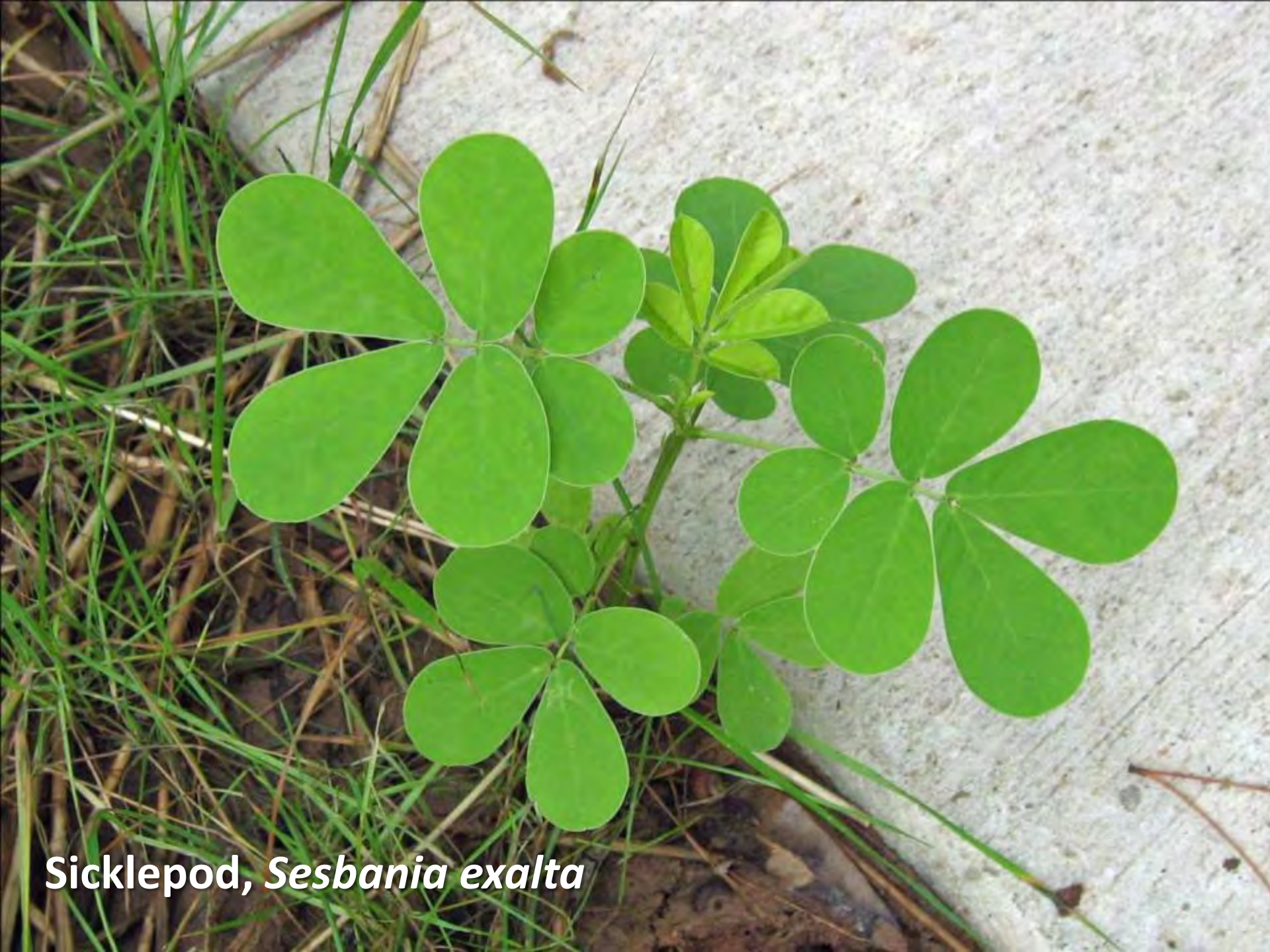
Sicklepod, Sesbania exalta