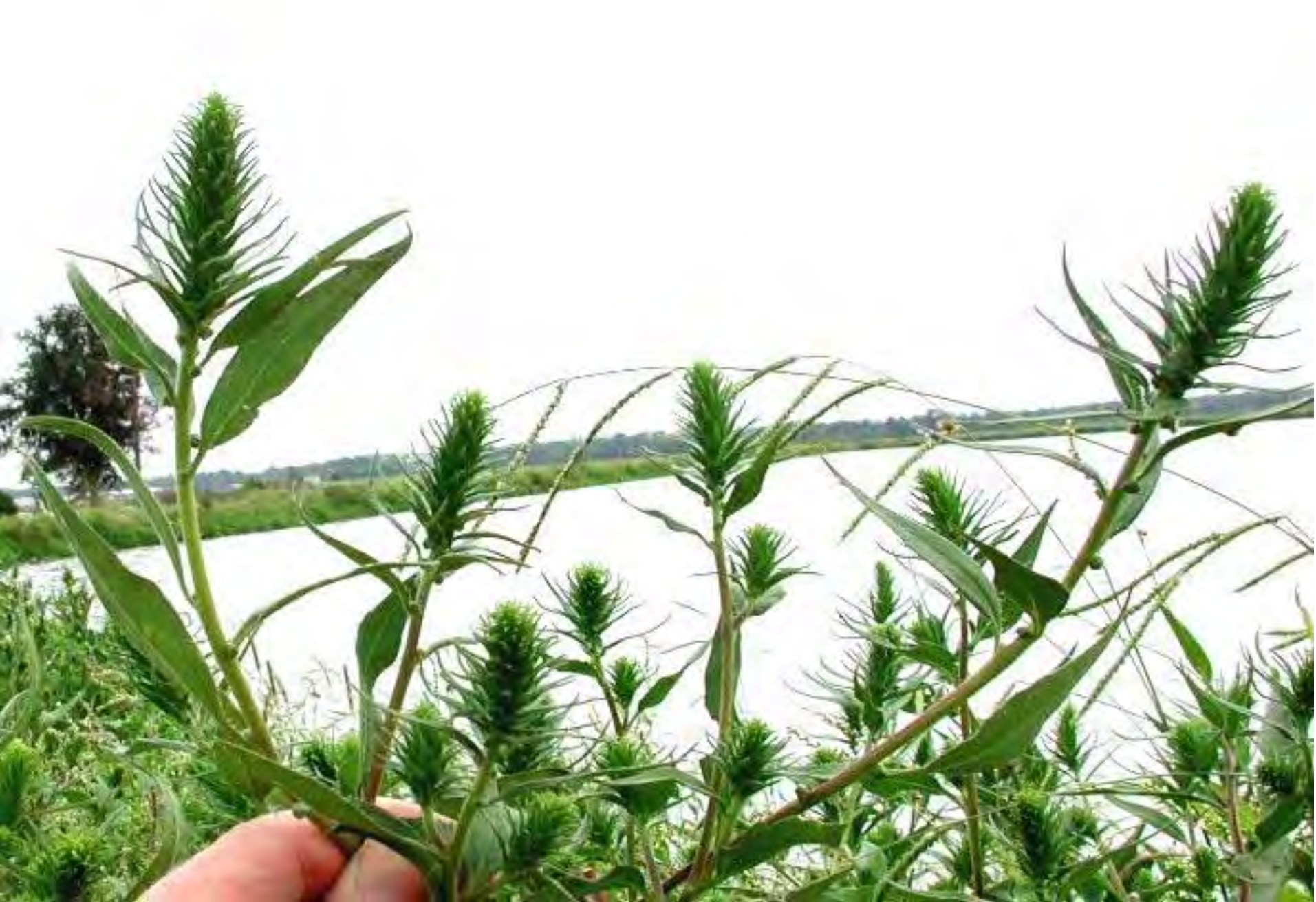
Sumpweed, Iva spp