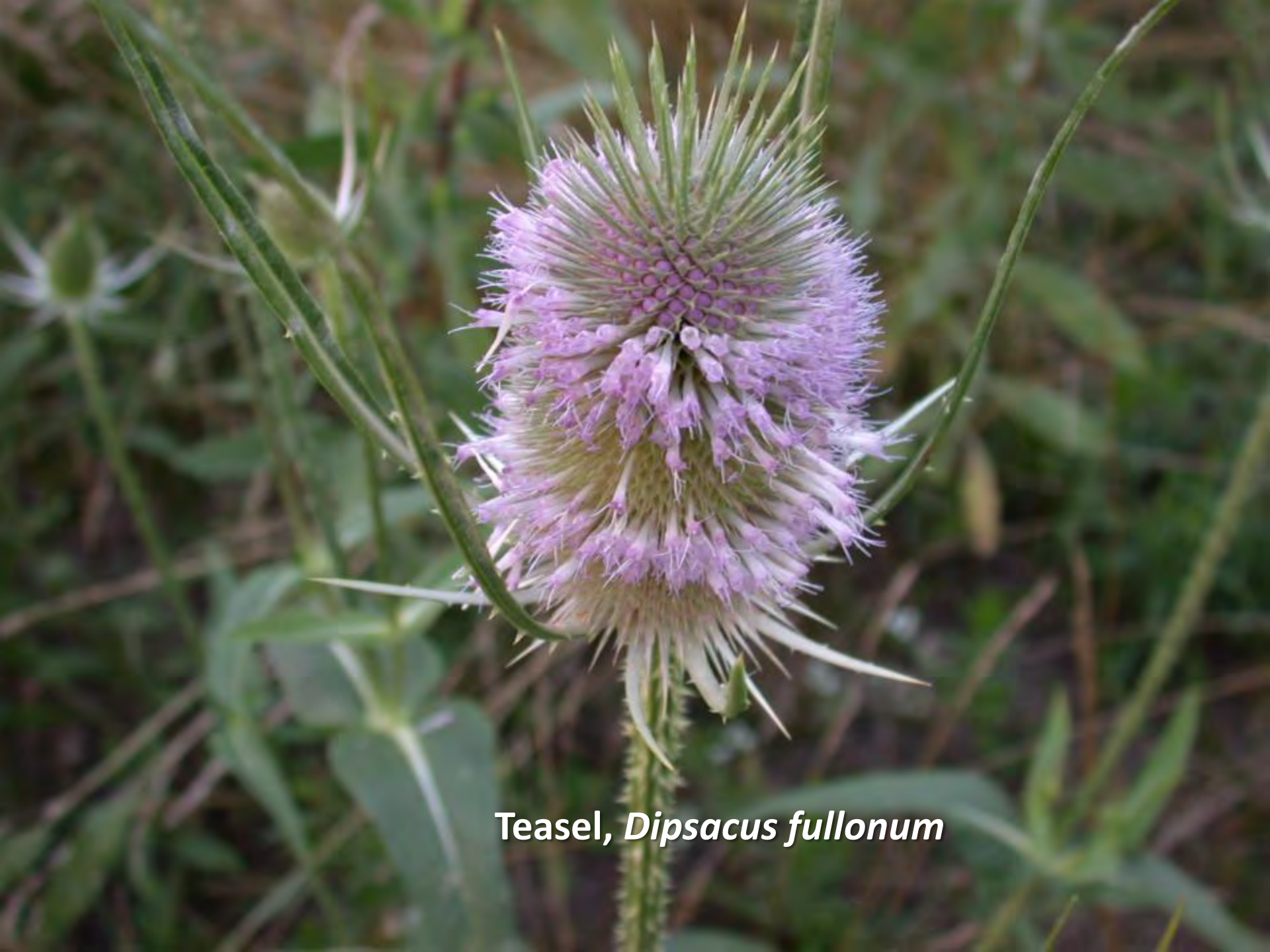
Teasel, Dipsacus fullonum