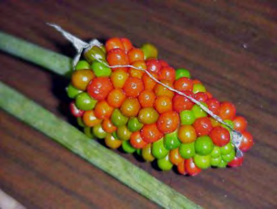
Green Dragon, Arisaema dracontium