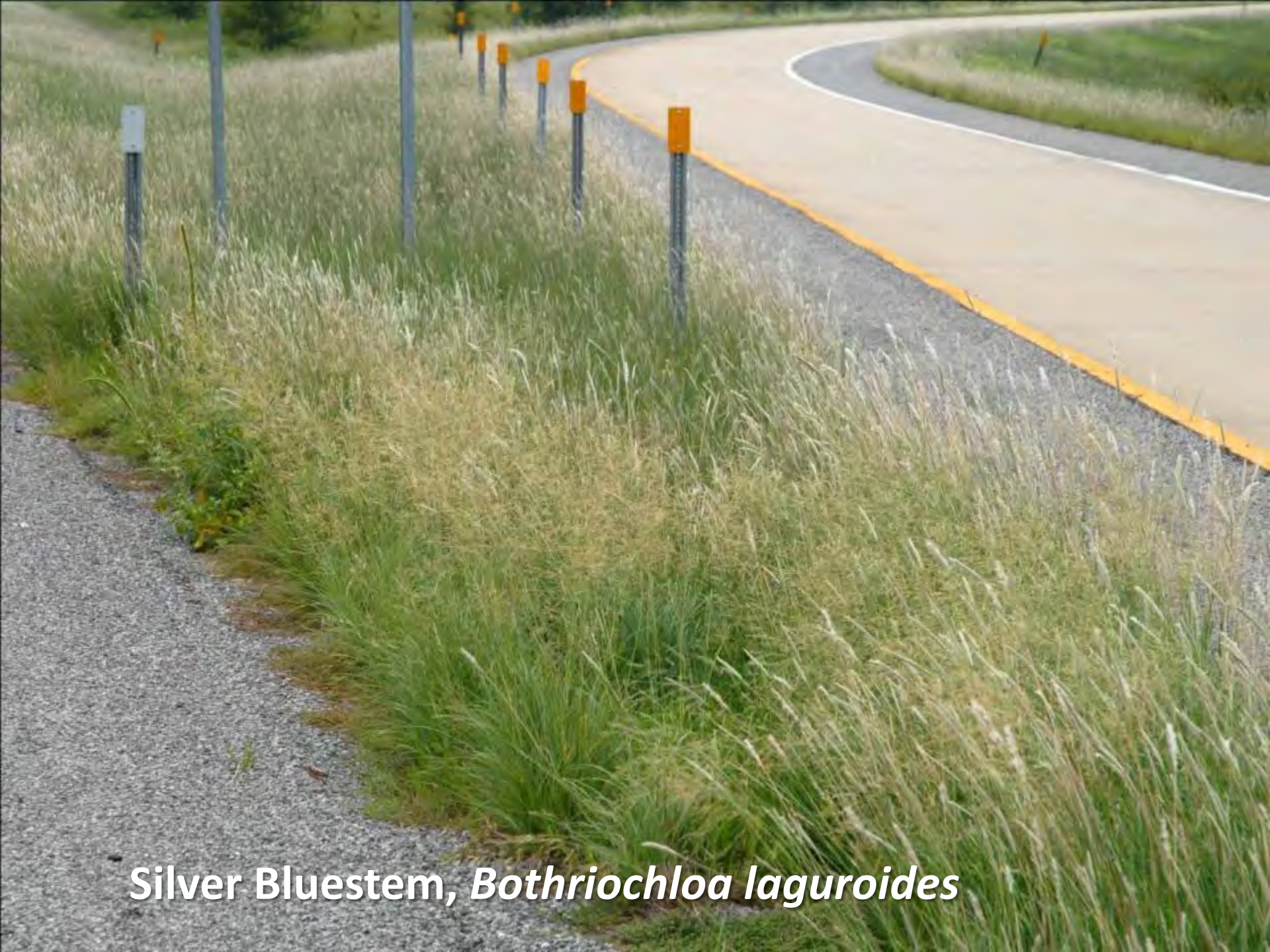
Silver Bluestem, Bothriochloa laguroides