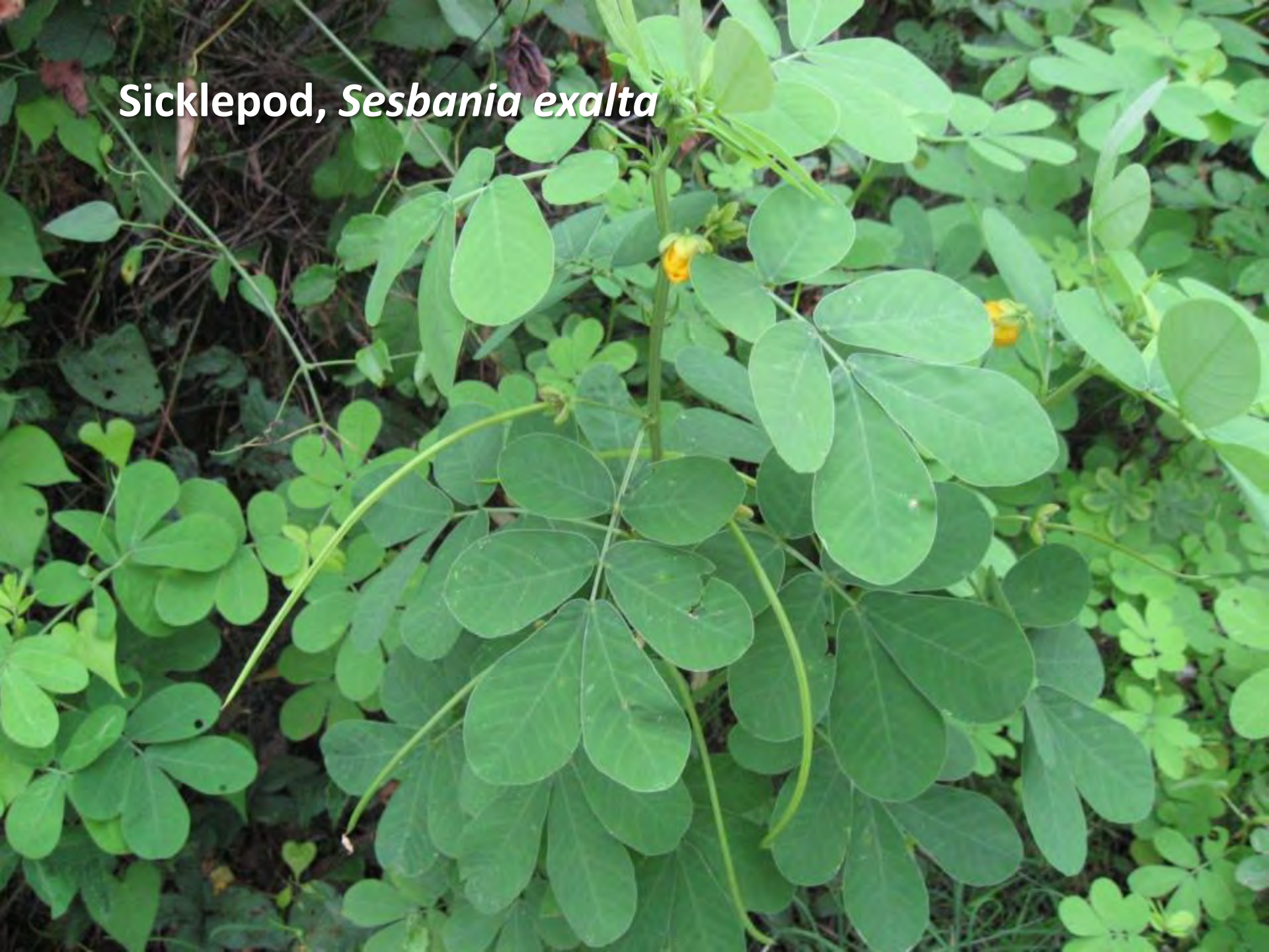
Sicklepod, Sesbania exalta