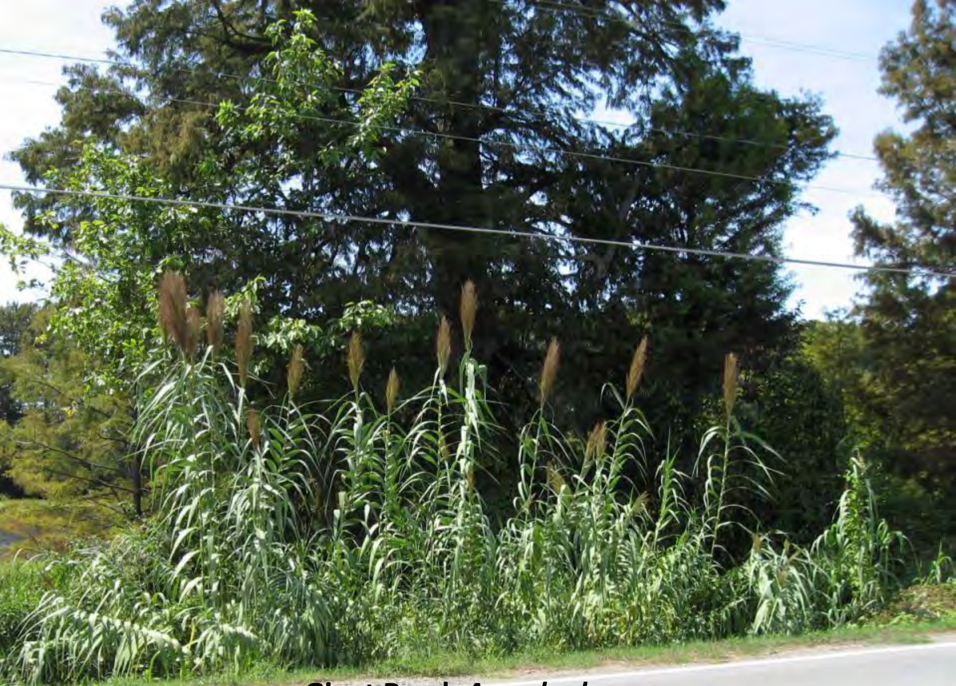
Giant Reed, Arundo donax