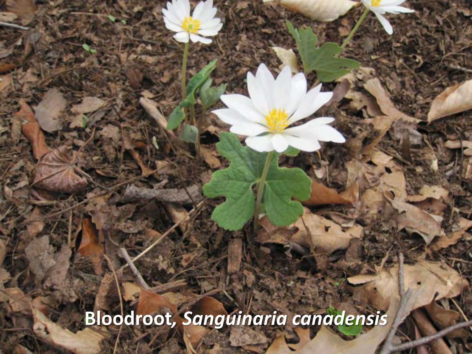
Bloodroot, Sanguinaria canadensis