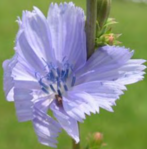
Chicory, Cichoria intybus