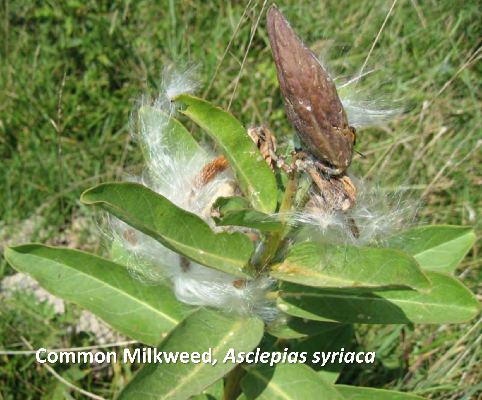
Common Milkweed, Asclepias syriaca