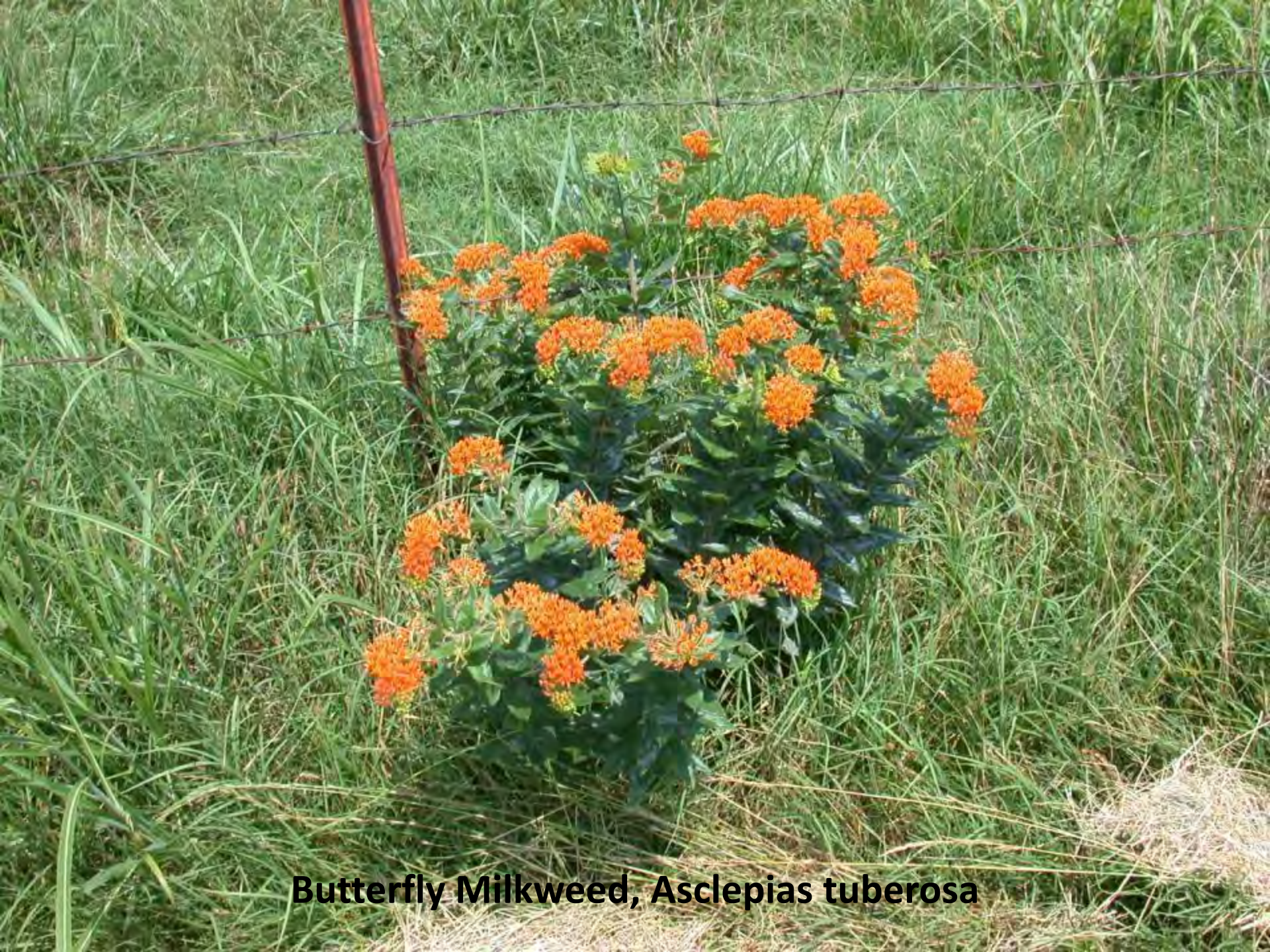
Butterfly Milkweed, Asclepias tuberosa