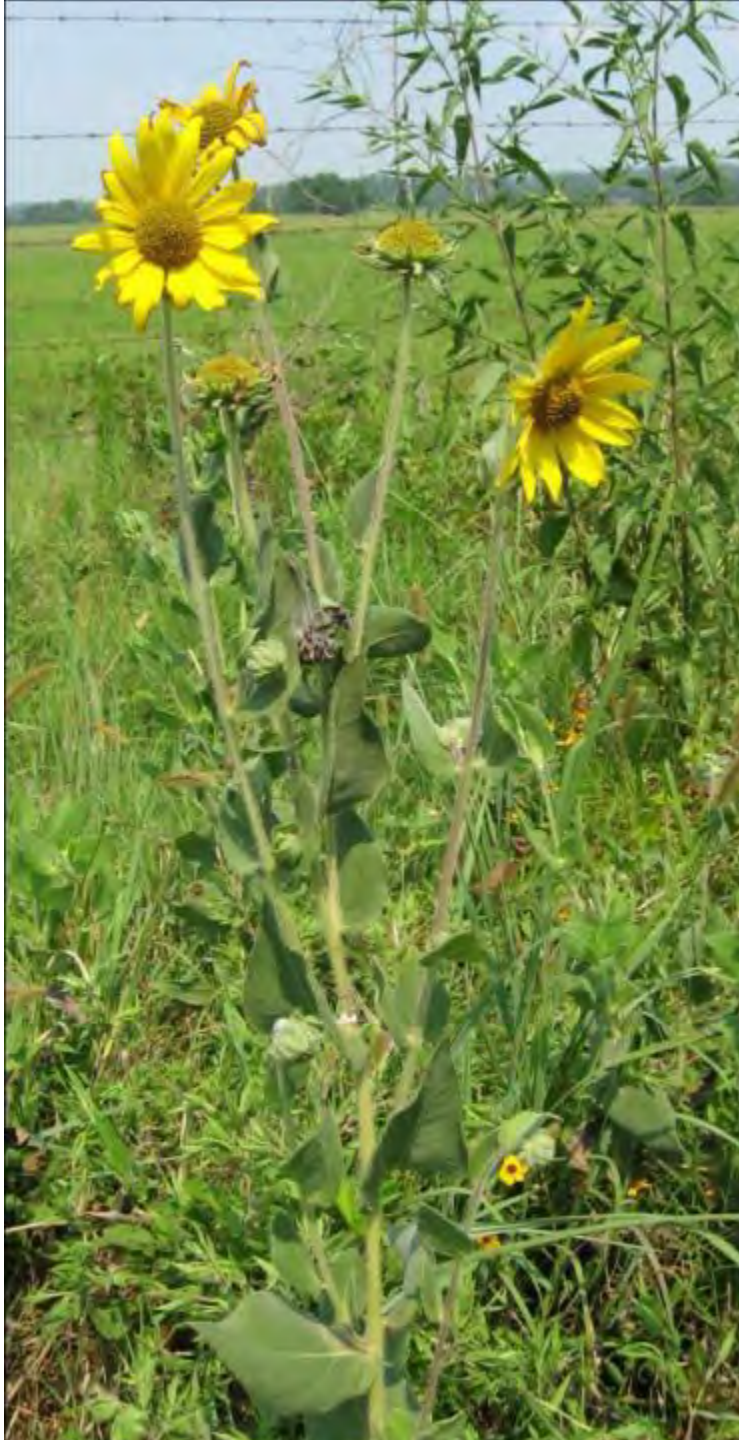
Ashy Sunflower, Helianthus mollis