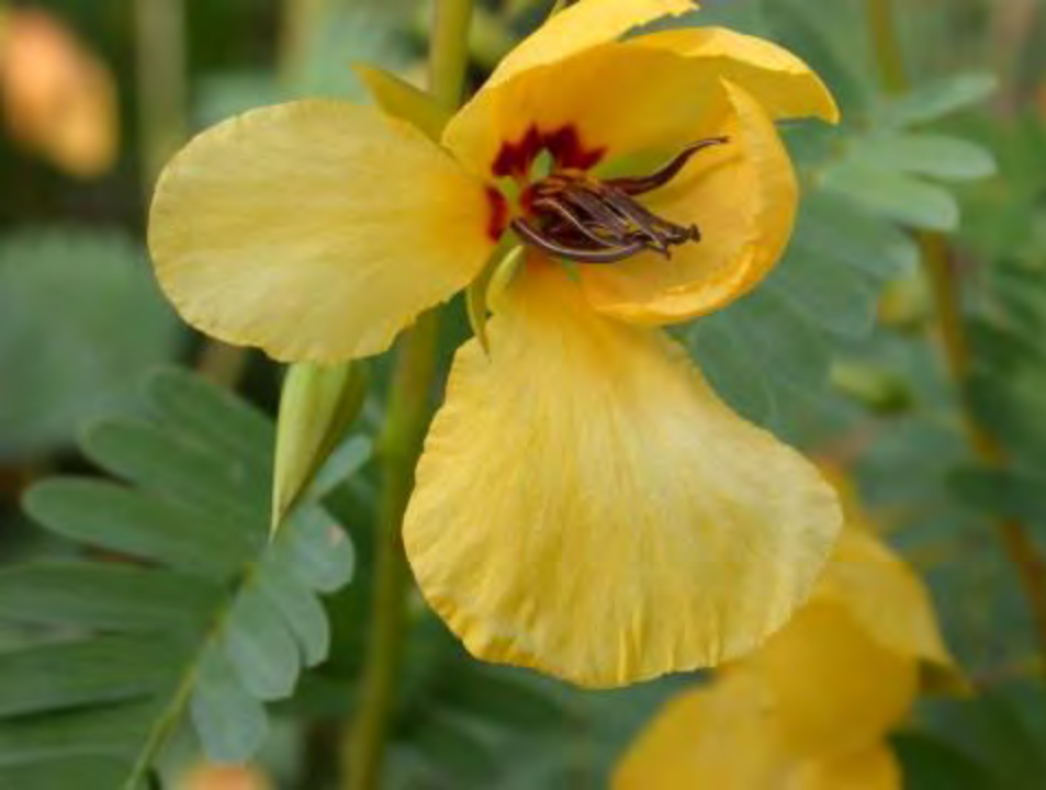
Partridge Pea, Cassia fasciculata