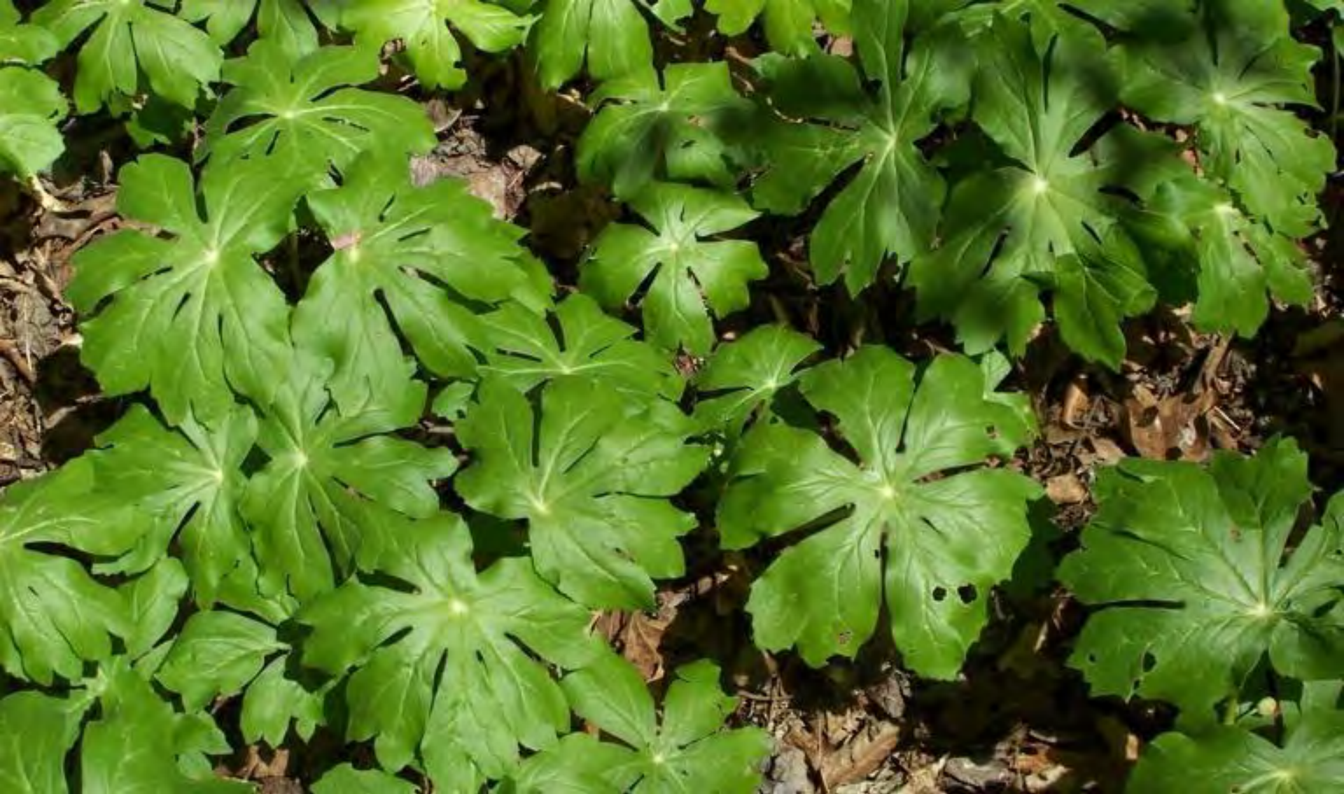
Mayapple Podophyllum peltatum