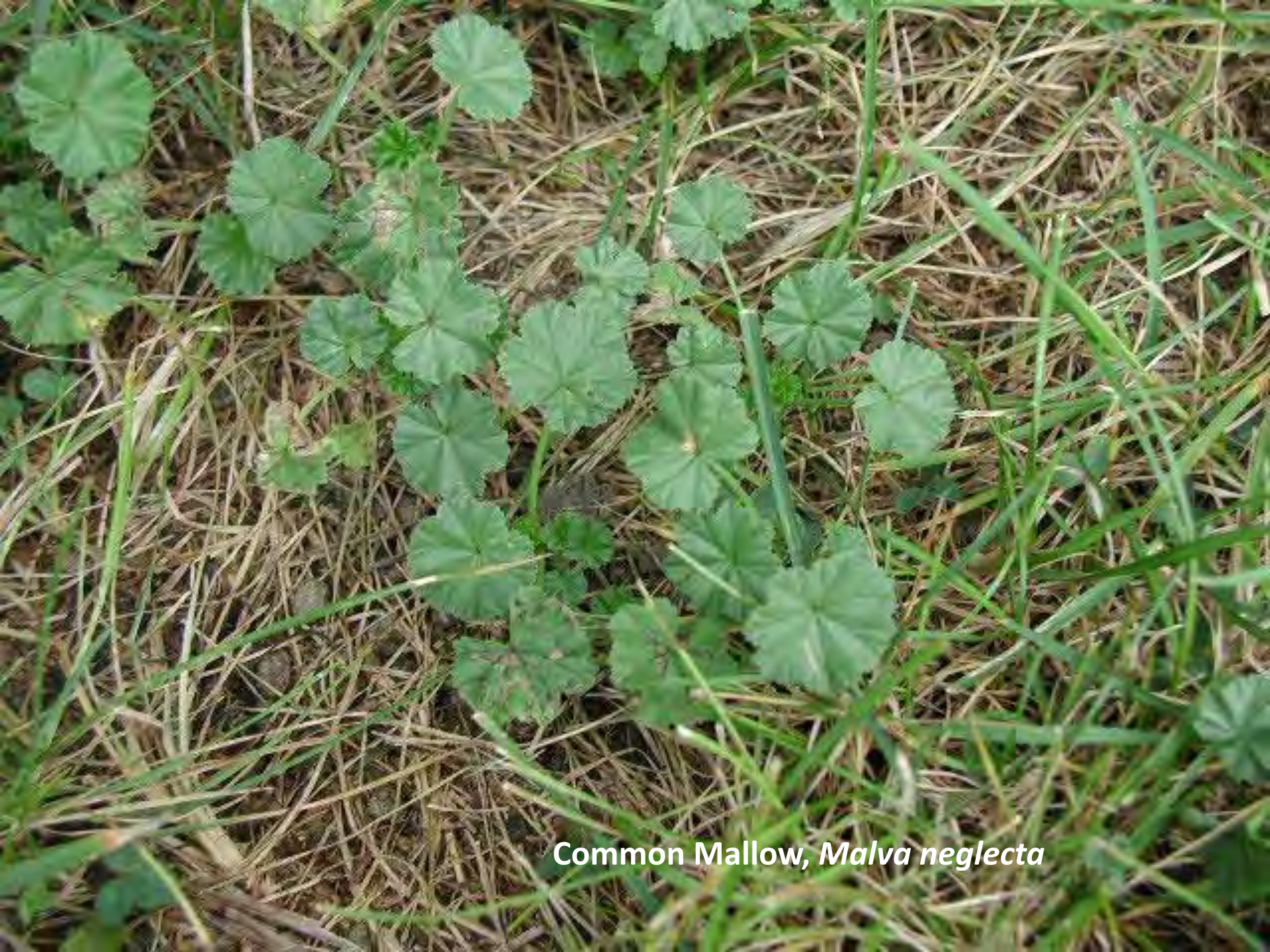
Common Mallow, Malva neglecta