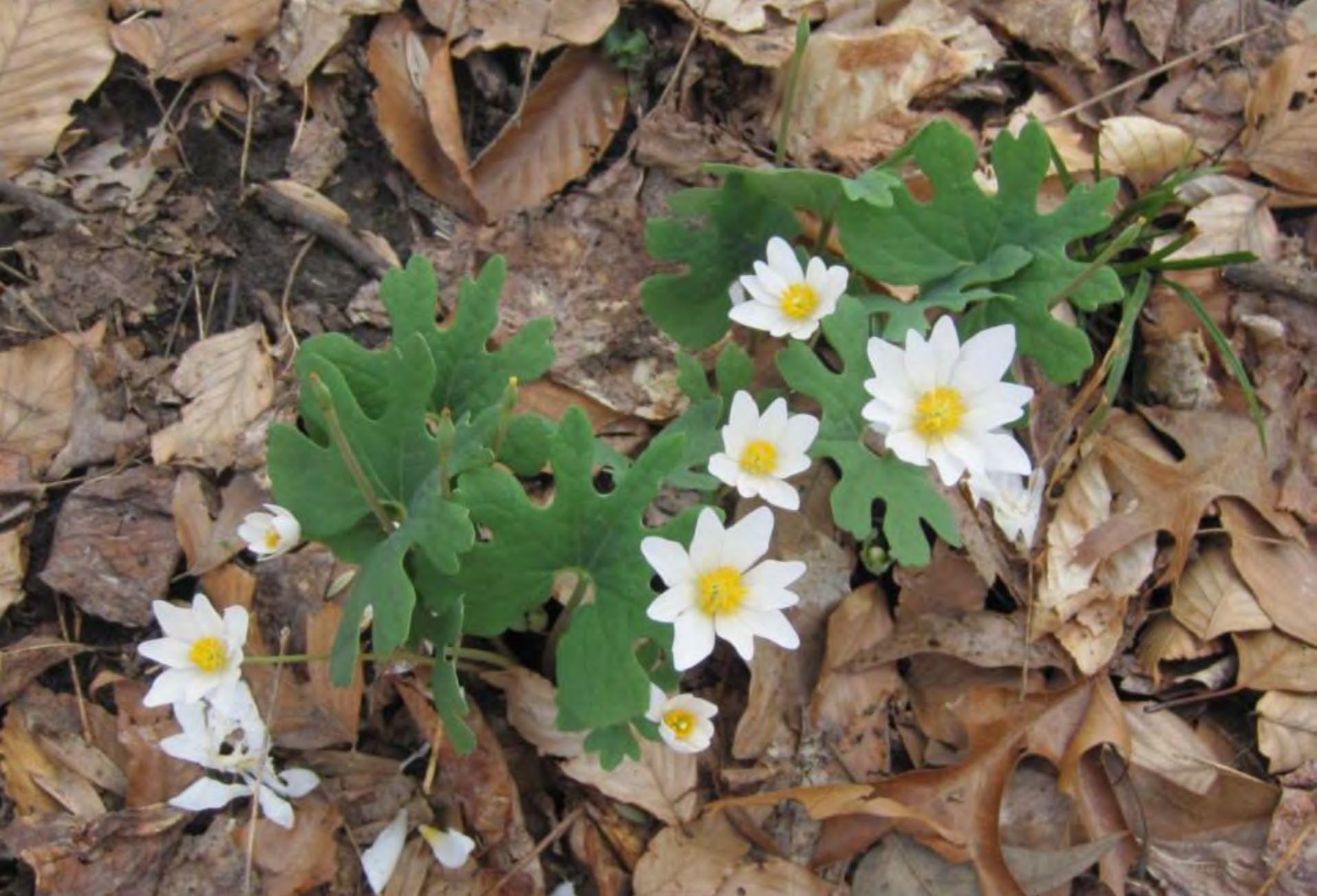
Bloodroot, Sanguinaria canadensis