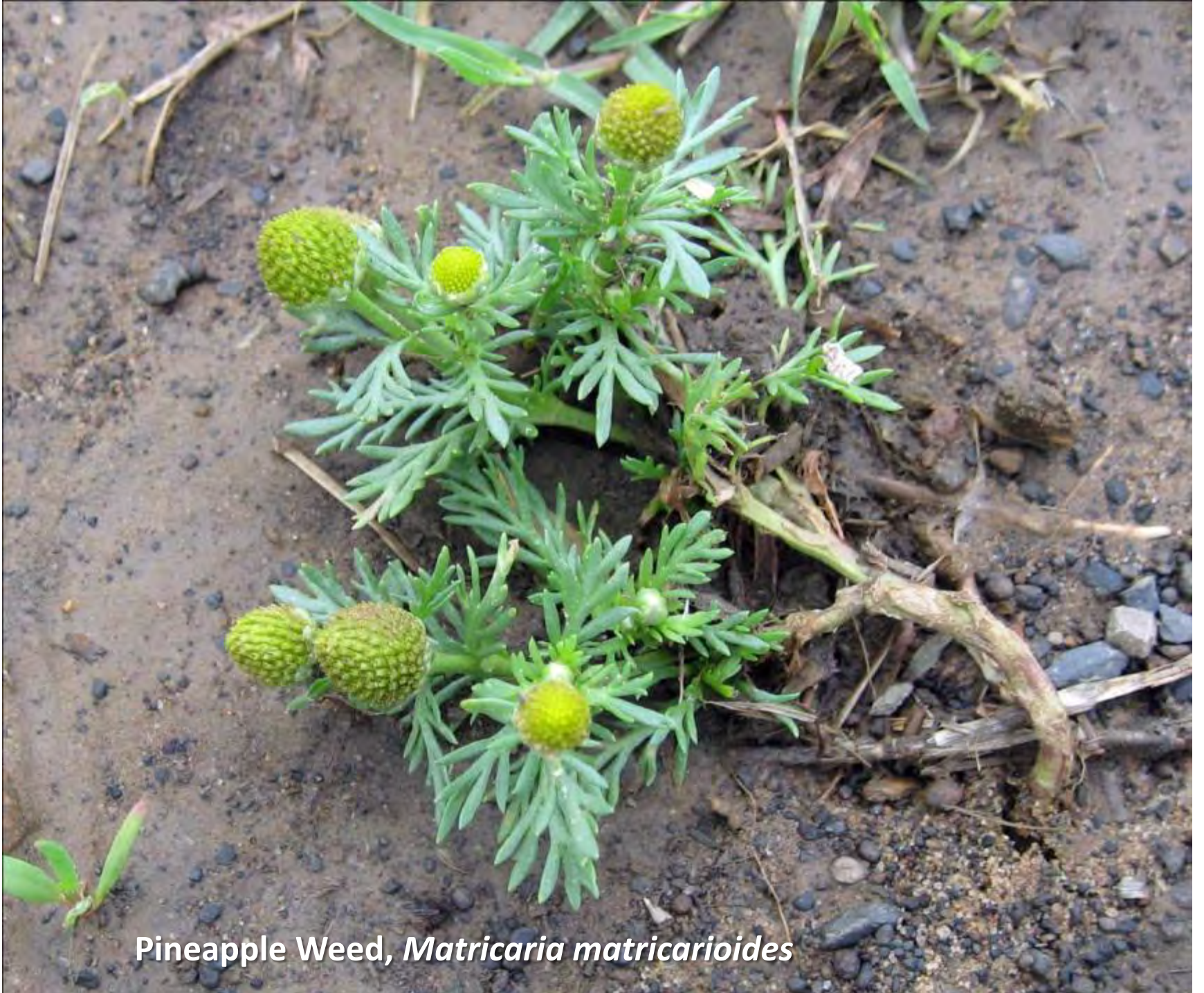
Pineapple Weed, Matricaria matricarioides