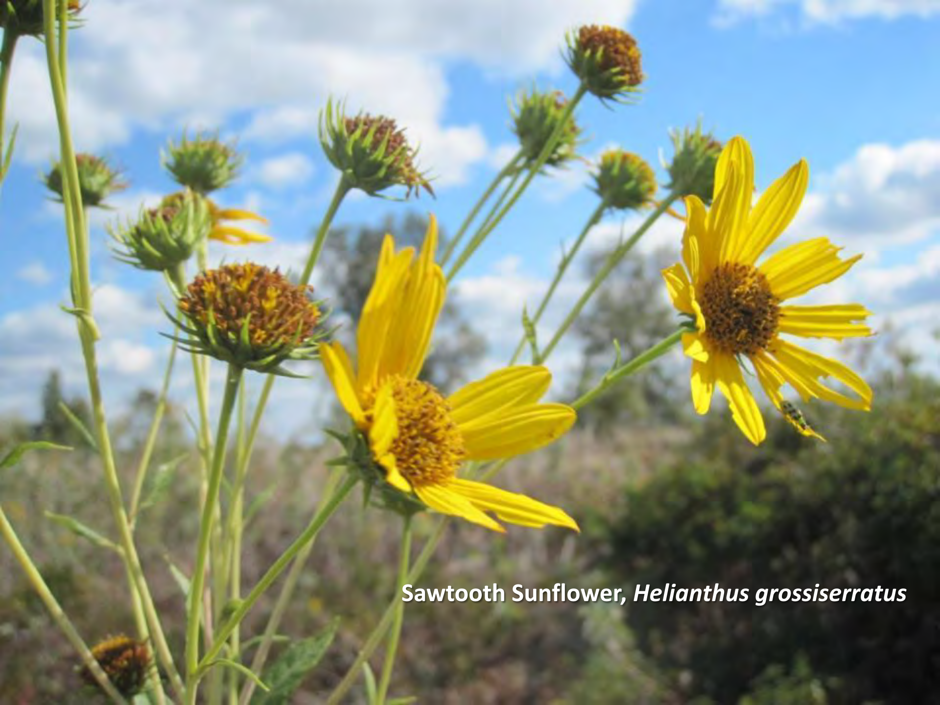
Sawtooth Sunflower, Helianthus grossiserratus