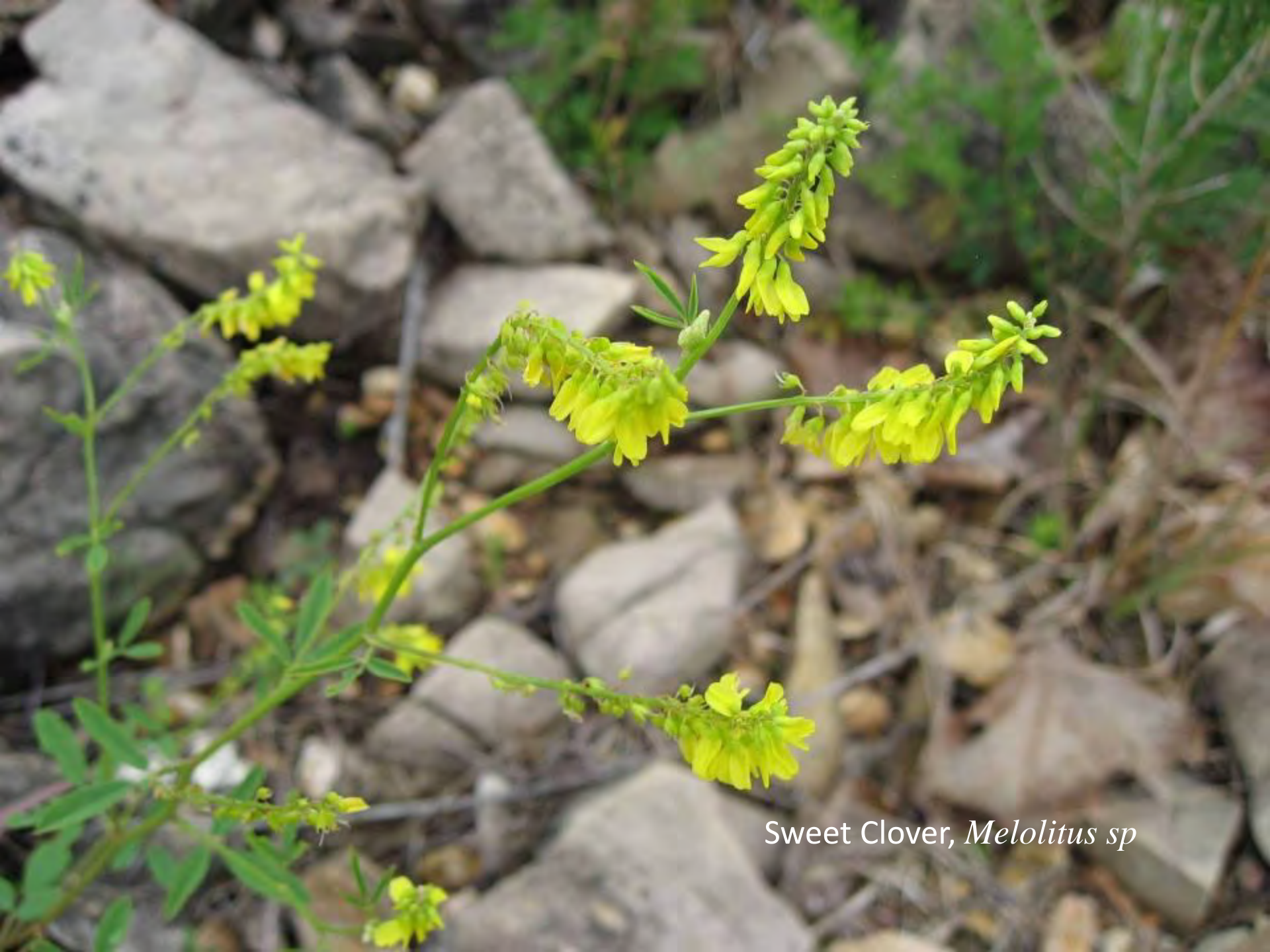
Sweet Clover, Melilotus sp