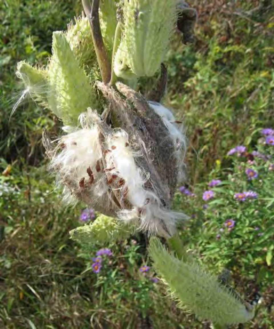
Common Milkweed, Asclepias syriaca