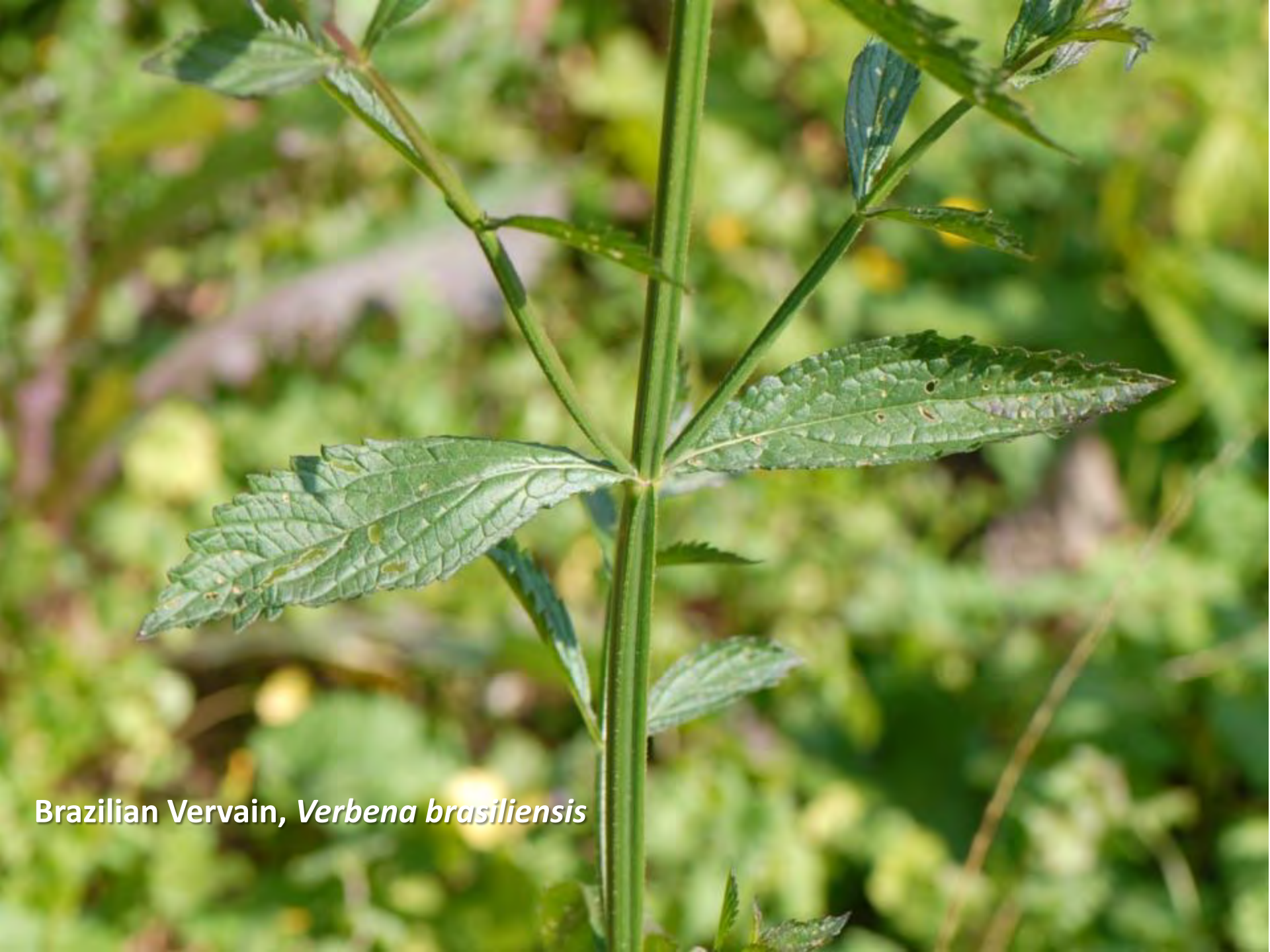
Brazilian Vervain, Verbena brasiliensis