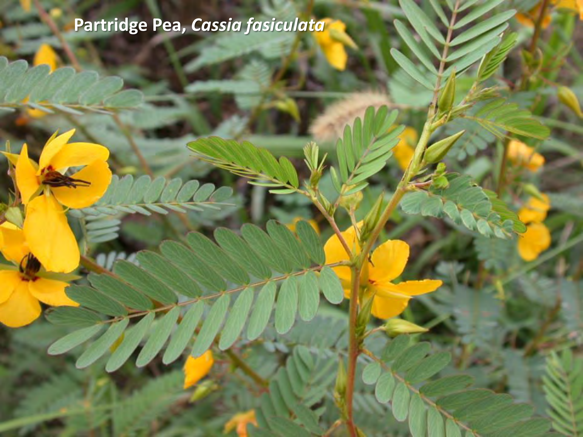
Partridge Pea, Cassia fasciculata