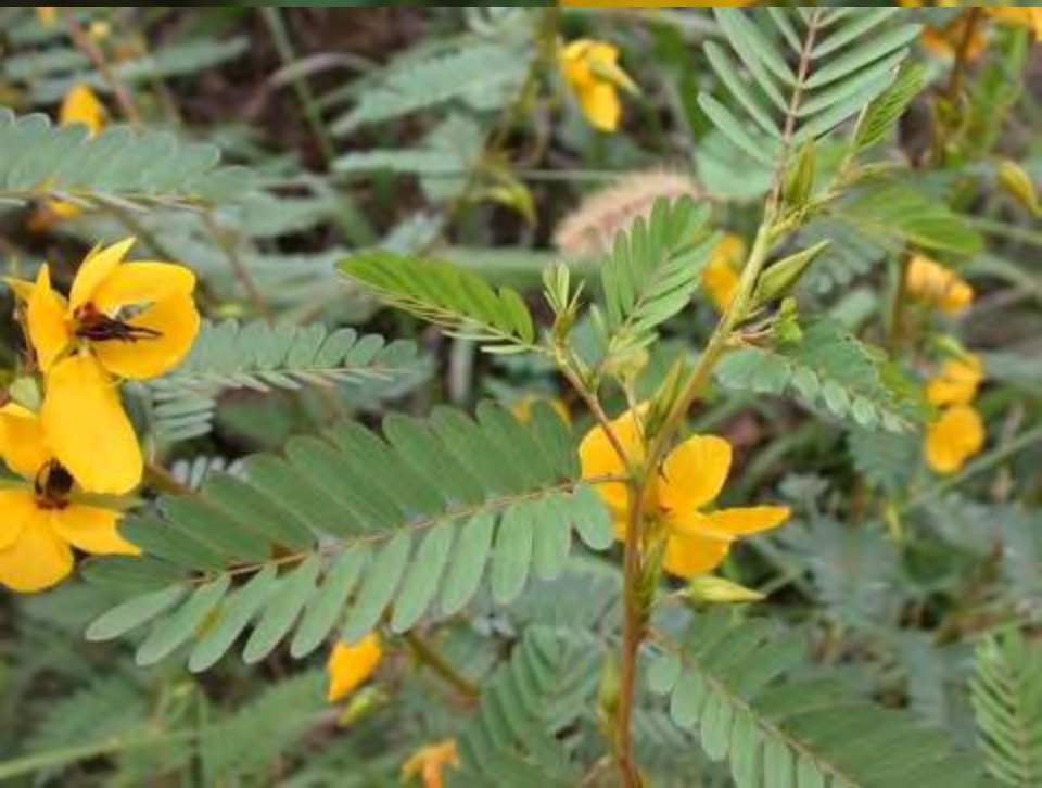
Partridge Pea, Cassia fasciculata