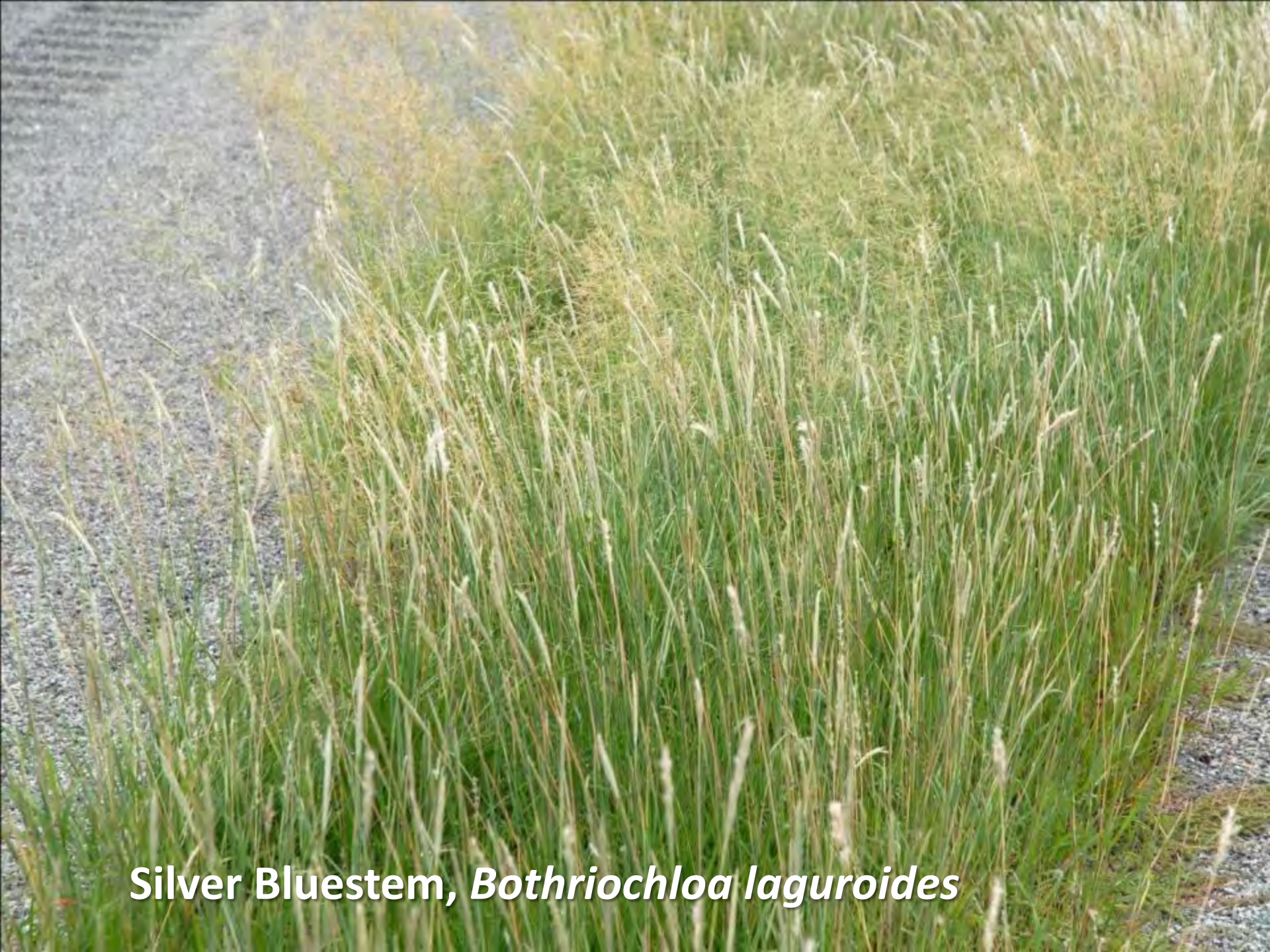
Silver Bluestem, Bothriochloa laguroides