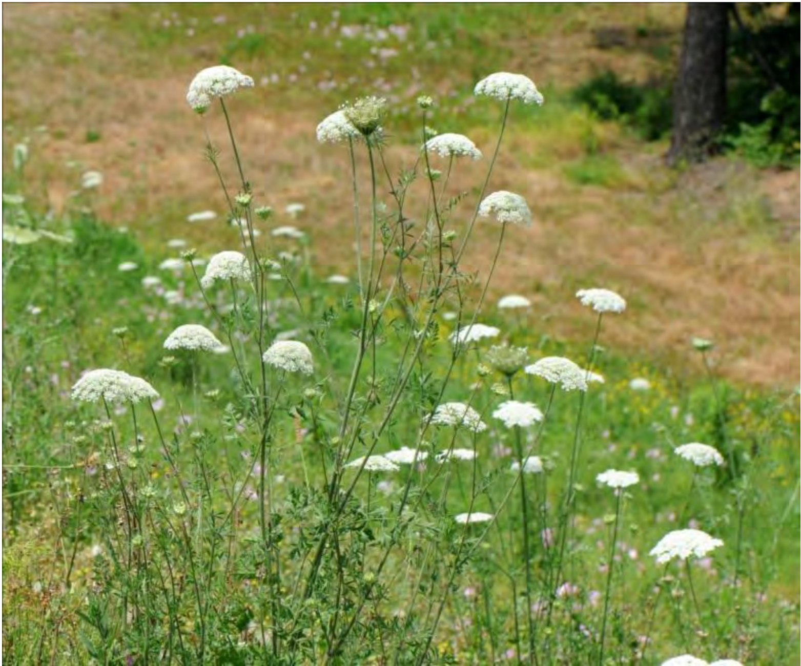
Wild Carrot, Daucus carota