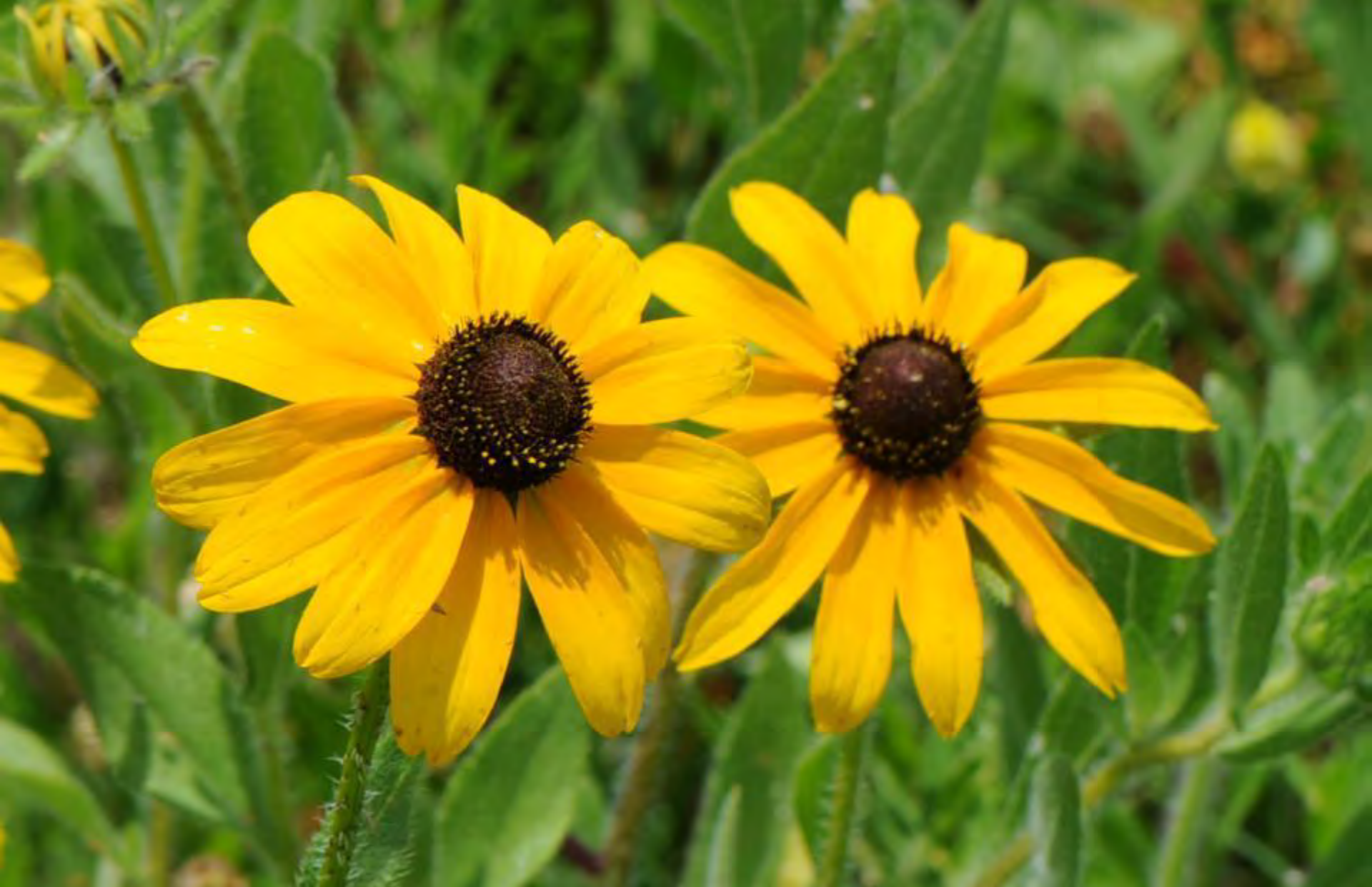
Brown-eyed Susan, Rudbeckia hirta