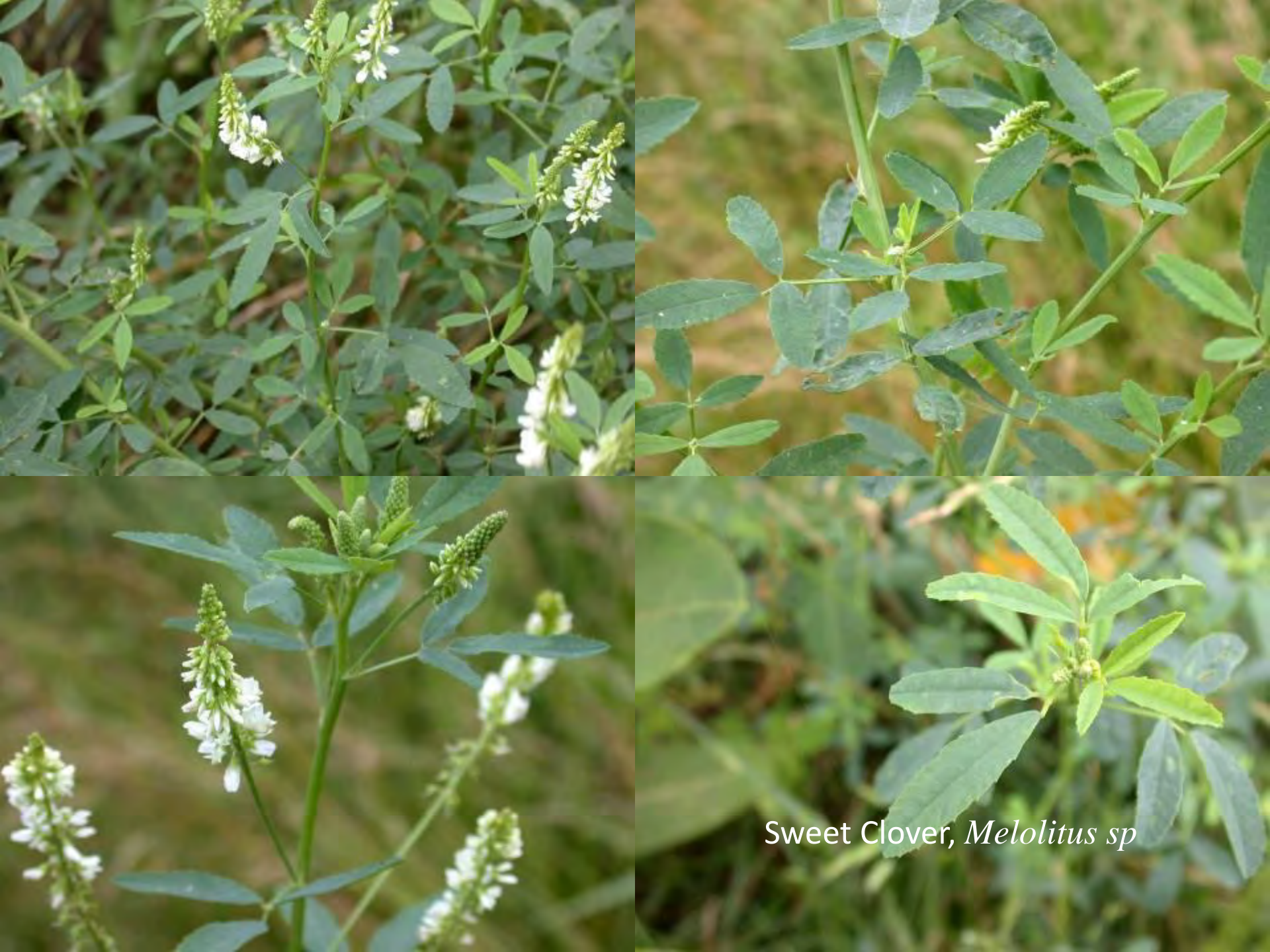
Sweet Clover, Melolitus sp