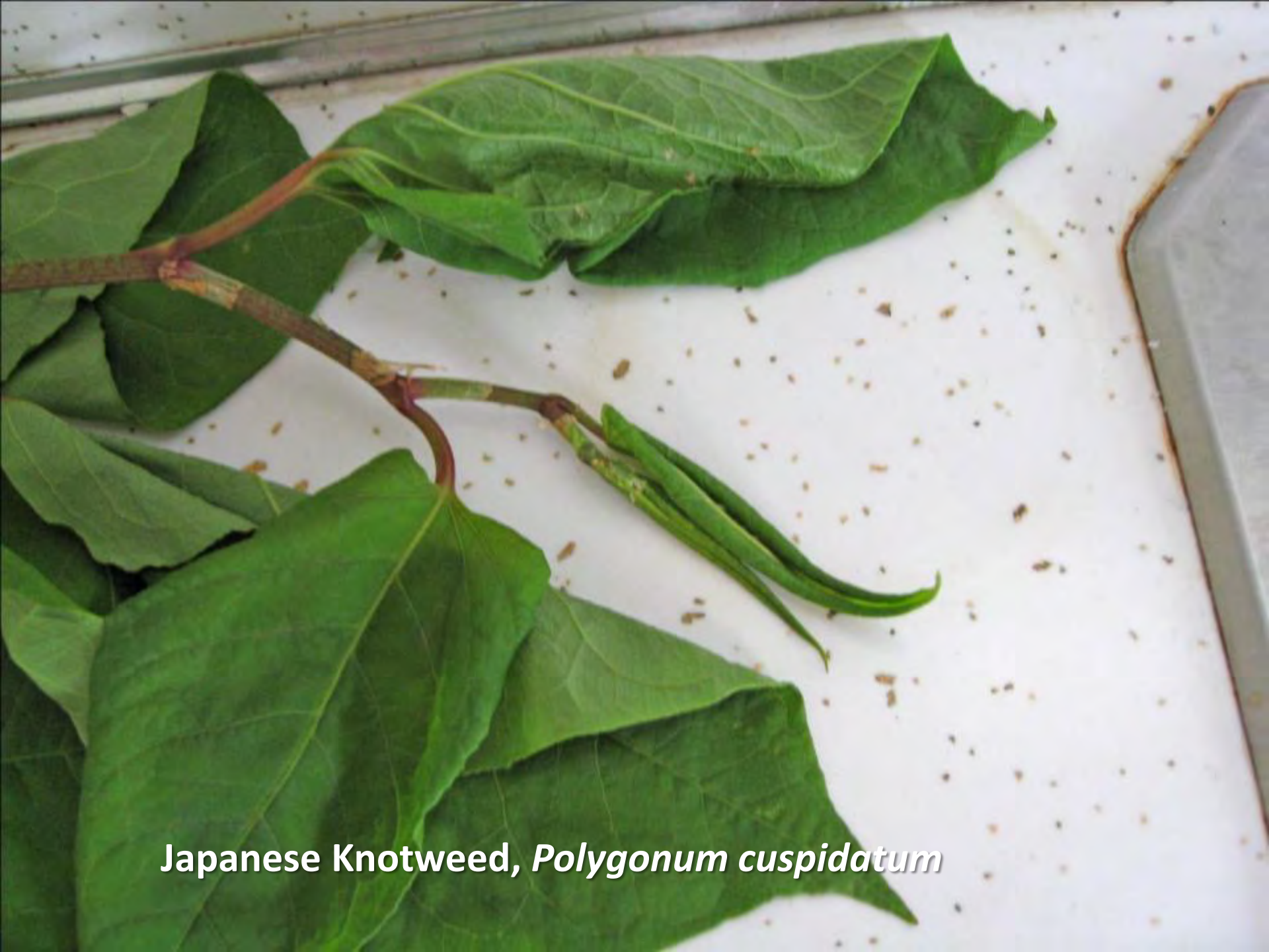
Japanese Knotweed, Polygonum cuspidatum