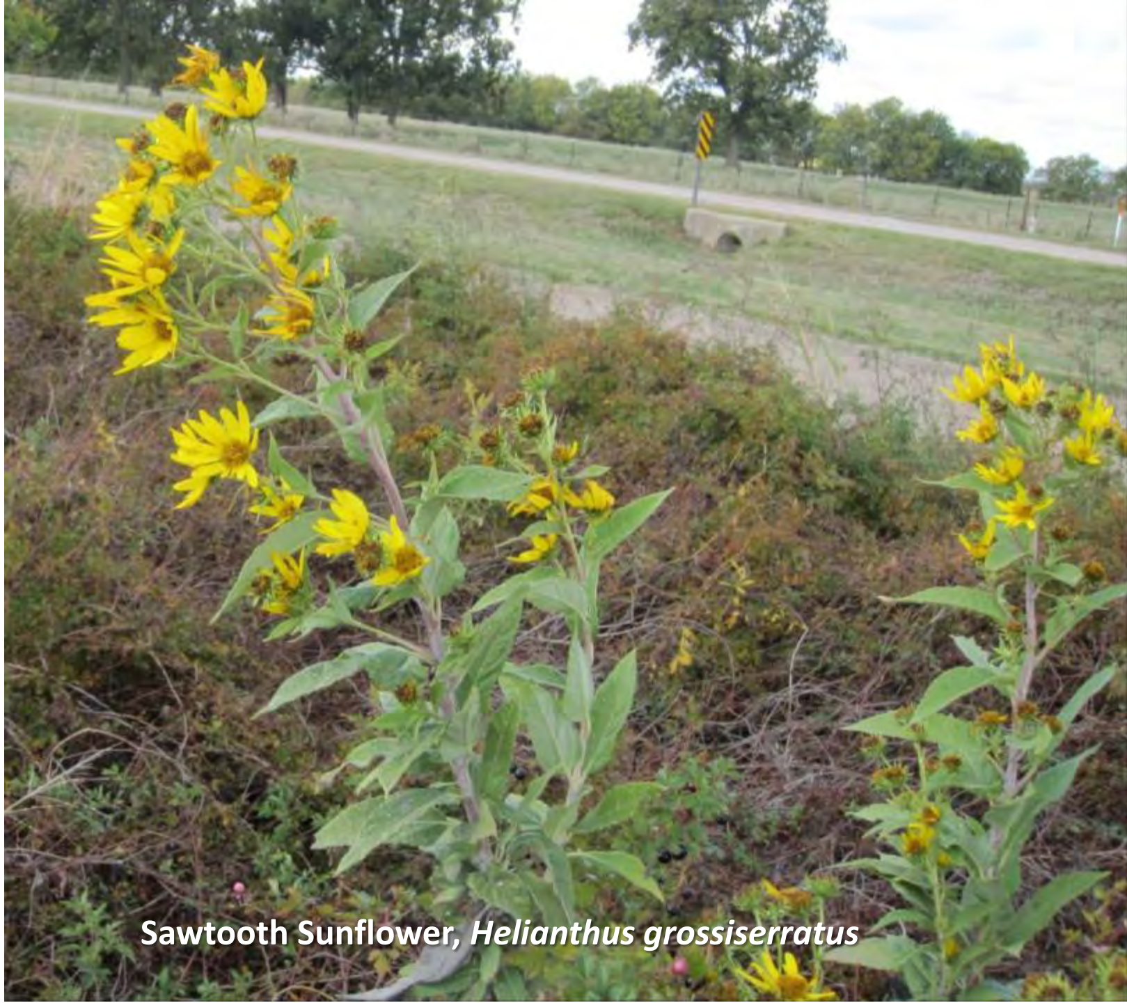
Sawtooth Sunflower, Helianthus grossiserratus