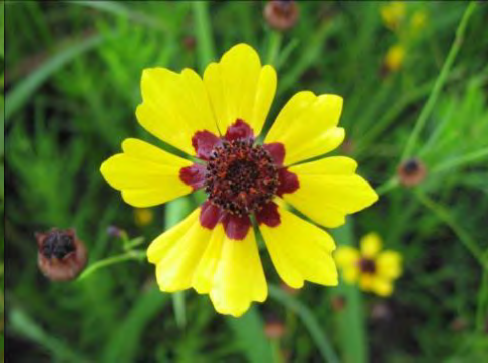
Plains Coreopsis, Coreopsis tinctoria