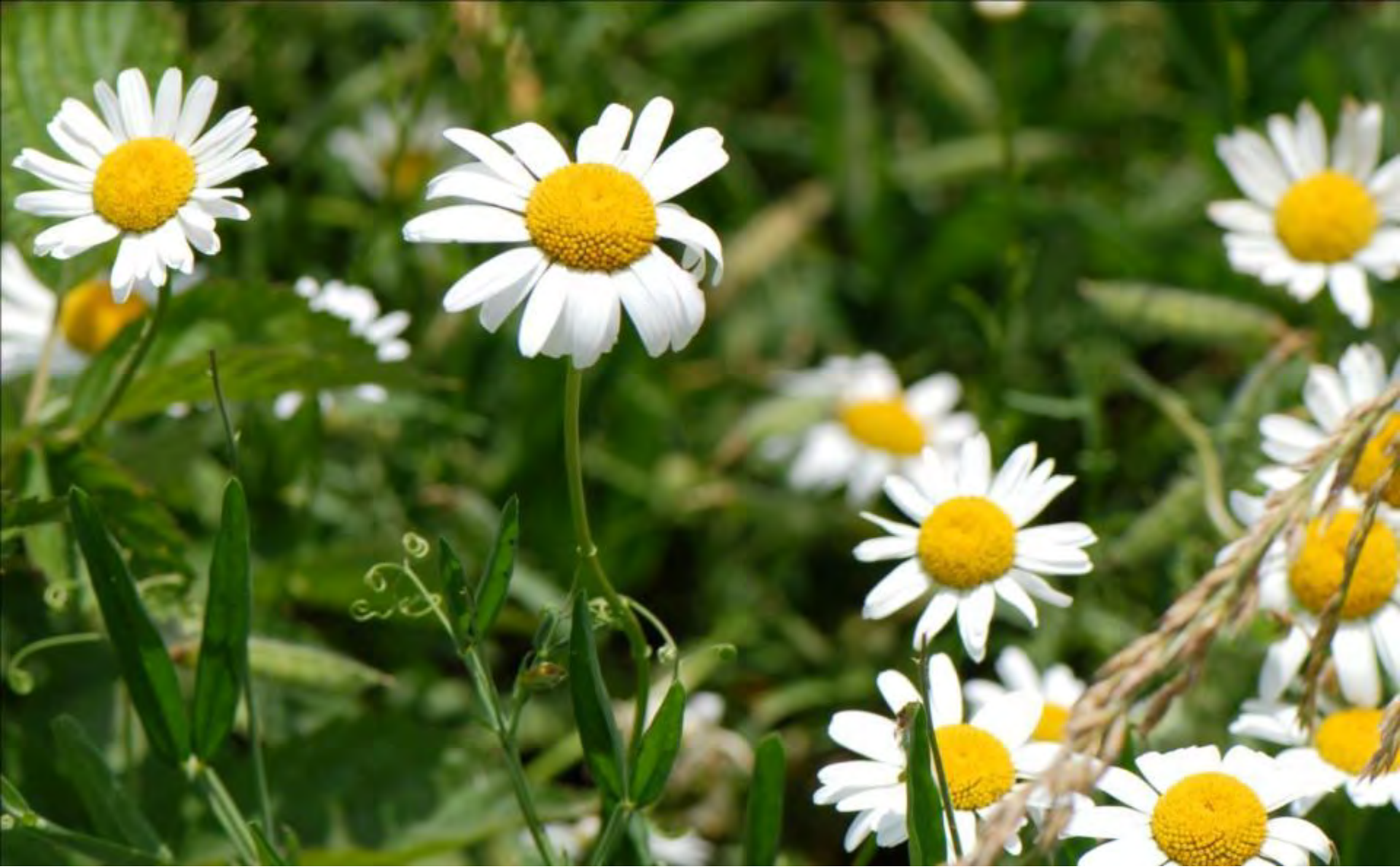
Ox-eye Daisy, Chrysanthemum leucanthemum