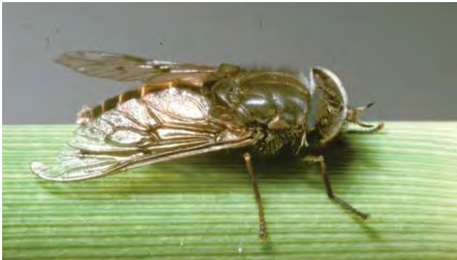
Figure 1b. Black-striped horse fly ( Hybomitra lasiophthalma ).