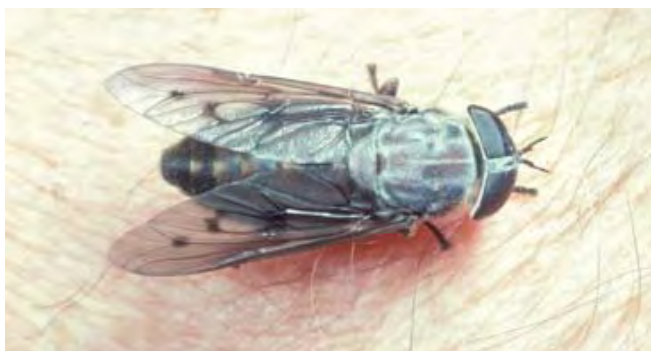
Figure 1d. Autumn horse fly ( Tabanus sulcifrons ).

Elimination of horse and deer fly breeding habitats is impractical. If a breeding site is located, it may be too large to eliminate or elimination would result in destruction of environmentally sensitive wetlands. Mowing (vegetation management) around swampy areas or ponds may provide limited population reduction because horse flies lay eggs on vegetation overhanging moist soil. However, keep in mind that horse flies will travel long distances, meaning other breeding areas beyond your control could be the source of your horse or deer fly problem.