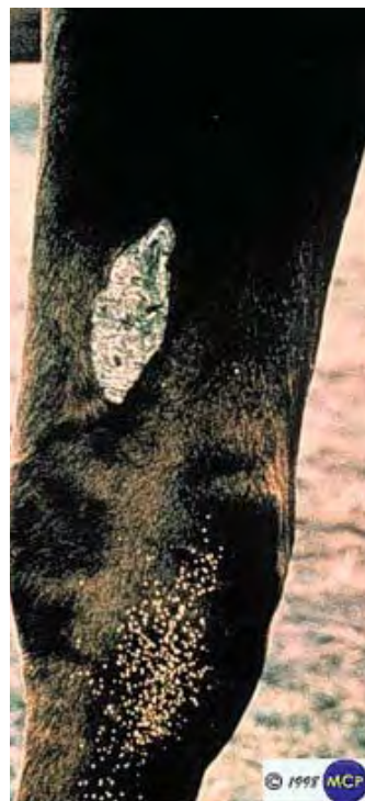
Figure 18. Eggs of the bot fly, Gasterophilus intestinalis (DeGeer), deposited on the hairs of a horse's foreleg. (Marcelo de Campos Pereira, http://www.icb.usp.br/~marcelcp/ )

Non-chemical bot fly control is aimed at the eggs. Equine owners can frequently sponge the horse with warm water to stimulate hatching of bot fly eggs. Newly hatched bot fly larvae quickly die especially if done on a cool day. For the horse bot fly, concentrate efforts on the animal's legs between the hock and knee. Also, applying insecticidal washes to egg-laying sites can reduce the number of larvae ingested by the animal. These remedies should reduce the number of bot fly larvae ingested by the animal but will not control any larvae that were unaffected and ingested. Because of the seriousness of bot fly infestations, treatment with a boticide to control the parasitic stages is recommended.