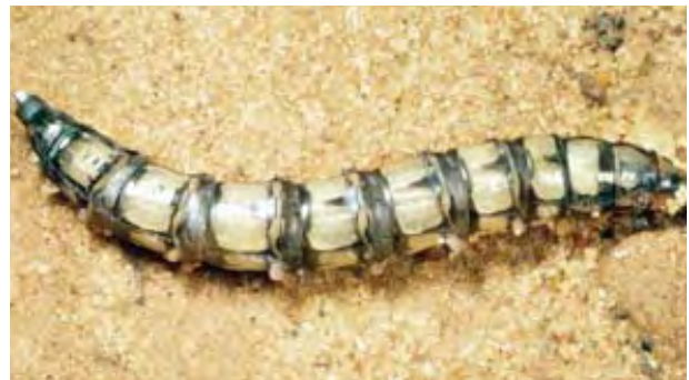
Figure 4. Black horse fly ( Tabanus atratus ) larva.