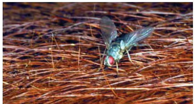
Figure 13. Adult horn fly, Haematobia irritans (L.).