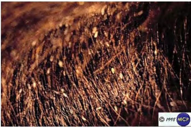
Figure 24. Lice eggs (nits) attached to horse hairs.

(called nits) to hairs ( Figure 24 ), eggs hatch into nymphs in about 10 to 15 days, and after three molts, nymphs become adults. It requires about 1 month for an egg to develop into an adult.