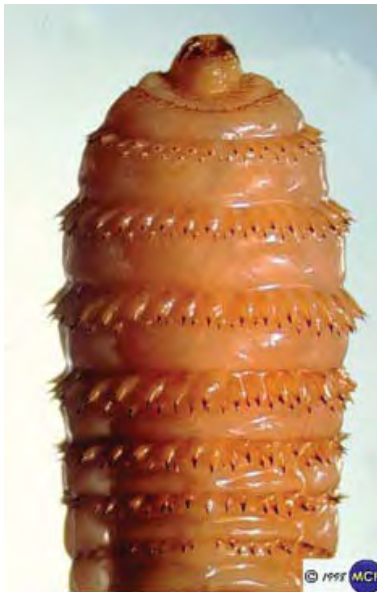
Figure 20. Bot fly larva, Gasterophilus intestinalis (DeGeer).