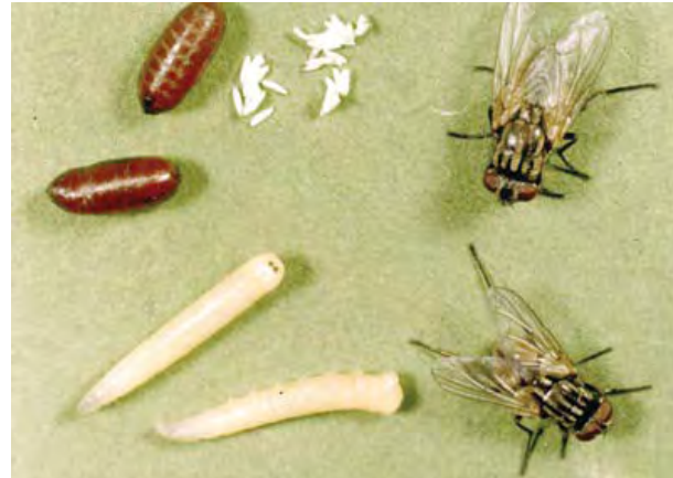
Figure 16. House fly life cycle.

and adult stages and is normally completed in 10 to 21 days, although flies can develop in as little as a week when temperatures are high. Females usually lay up to 600 eggs during their lifetime, and 1 pound of manure is sufficient for more than 1,500 maggots. House flies have multiple generations per year and overwinter in all life stages.