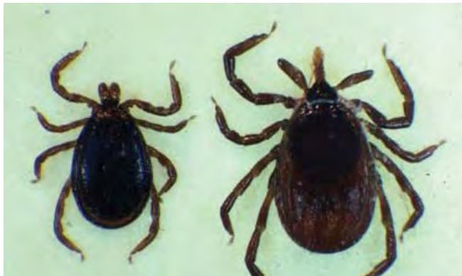
Figure 25e. Black-legged tick, Ixodes scapularis Say.

In certain circumstances, habitat modification through vegetation management is a viable method to reduce localized tick populations by reducing moisture and humidity of free-living tick microhabitat. Clearing brush, cutting weeds and tall grass and clearing trees will reduce the humidity, making the habitat less suitable for tick development. Some studies have also shown that controlled burns can result in 70 to 95 percent reductions in tick populations following the burn. These reductions are related to both tick mortality and habitat modification. Like vegetation management, controlled burning provides temporary control.