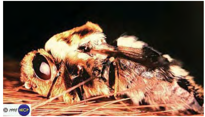
Figure 17. Adult bot fly, Gasterophilus nasalis (L.).

Chemical control of bot flies is aimed at the parasitic stage within its host. Several formulations of ivermectin and other macrocyclic lactones are available for bot fly control in equines. These products are relatively easy to use, effective and should be administered after fly activity ceases (after second killing frost). FSA3096, Livestock Health Series: Internal Parasites of the Horse ( https://www.uaex.uada.edu/Other_Areas/publications/PDF/FSA-3096.pdf ), is available for more information on internal parasites including bots.