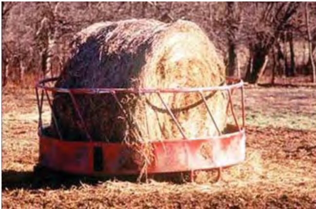
Figure 11. Potential stable fly breeding site.

weeks. Overwintering of stable flies is not completely known, but larvae likely develop slowly during winter months under the frost line and move toward the soil surface to pupate as temperatures rise.