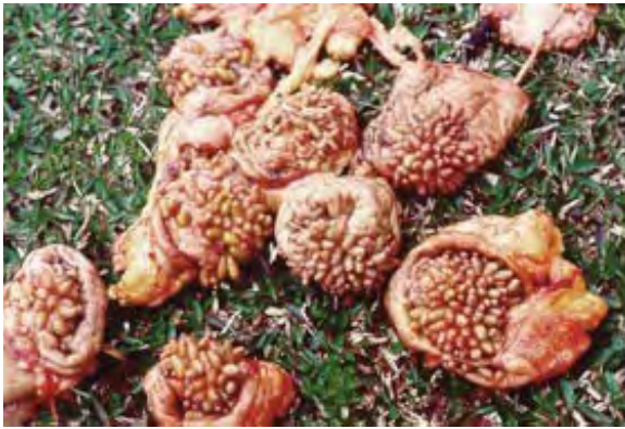
Figure 19. Bot fly larvae, Gasterophilus nasalis (L.), attached to the pyloric region of horse stomachs.