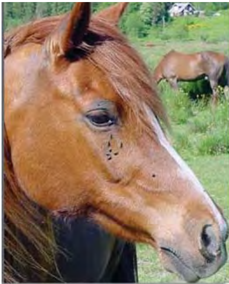
Figure 14. Face flies on a horse.

The face fly, Musca autumnalis DeGeer, is a non-biting fly that resembles the house fly (Figure 14). Adult females persistently feed on secretions around the animals' eyes, nose or wounds, causing severe annoyance. She can also serve as a vector of pinkeye. Adult males feed on nectar. Their life cycle is very similar to the horn fly in that eggs are laid in very fresh cattle feces. Development period from egg to adult takes from 11 to 17 days. They overwinter as adults in protected areas, such as farmhouses, barns and church steeples.