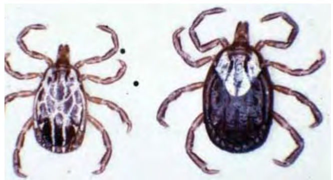
Figure 25b. Gulf Coast tick, Amblyomma maculatum Koch.