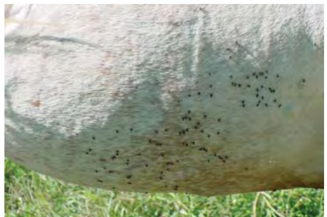
Figure 12. Horn flies on the belly of a horse.

A good horn fly control program on your cattle herd is the best approach to manage horn fly issues on your equines. See FSA7031, Controlling Horn Flies on Cattle ( http://www.uaex.uada.edu/Other_Areas/publications/PDF/FSA-7031.pdf ). The application of insecticide to equines might become necessary when your horses are pastured near neighboring cattle or you have horn fly control problems with your cattle herd. Insecticide sprays, wipe-ons and some pour-ons can be used on equines for horn fly issues. Consult the horse section of MP144, Insecticide Recommendations for Arkansas ( http://www.uaex.uada.edu/Other_Areas/publications/PDF/MP144/MP-144.asp ), for a listing of insecticides.