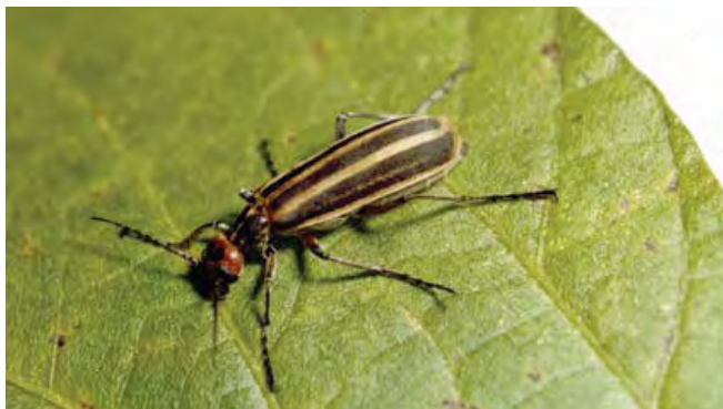
Figure 27. Threestriped blister beetle, Epicauta vittata (Fabricius).

Blister beetle (Figure 27) contamination of alfalfa hay is a serious concern for alfalfa producers and equine owners. Blister beetle poisoning (cantharidiasis) results from livestock consuming hay contaminated with cantharidin. Cantharidin occurs in blister beetles and is an irritant capable of blistering internal and external body tissues. Although cattle, sheep and poultry are susceptible, horses are the most susceptible with the most deaths occurring from cantharidiasis being reported. Symptoms include tongue and mouth blistering, colic, diarrhea, blood or intestinal lining discharge in stools and problems with urination or bloody urine. A veterinarian should be contacted immediately if a case of blister beetle poisoning is suspected. Additional information on blister beetles is available in FSA7054, Blister Beetle Management in Alfalfa ( http://www.uaex.uada.edu/Other_Areas/publications/PDF/FSA-7054.pdf ).