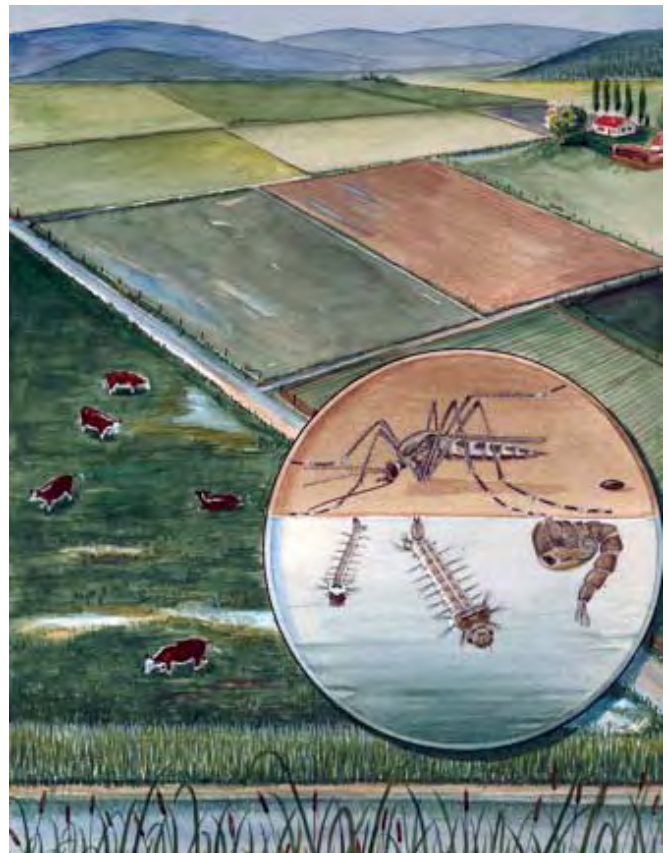
Figure 6. Life cycle of the mosquito. (Art Cushman, USDA; Property of the Smithsonian Institution, Department of Entomology, Bugwood.org )

active (Figure 6). The development period (egg, larval and pupal stages) is temperature dependent. For example, Culex tarsalis Coquillett could complete its life cycle in 14 days at 70°F and only 10 days at 80°F. During optimal conditions, some species can develop from egg to adult in as little as 4 days or as long as a month in less-optimal conditions. Adults emerge from the pupal stage. Flight distance from breeding site to a host varies greatly with species; some mosquitoes fly a few hundred yards while others travel many miles. Depending on the species and climate, mosquitoes can overwinter as adult females, eggs or larvae.