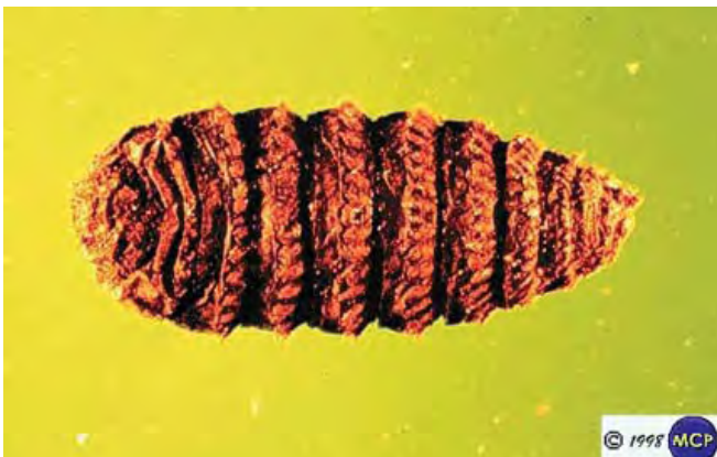
Figure 21. Pupa of bot fly, Gasterophilus nasalis (L.).