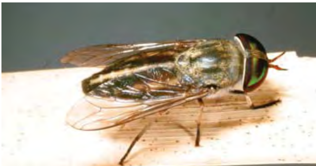
Figure 1c. Lined horse fly ( Tabanus lineola ).