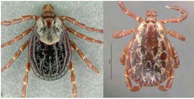
Figure 25c. American dog tick, Dermacentor variabilis (Say).