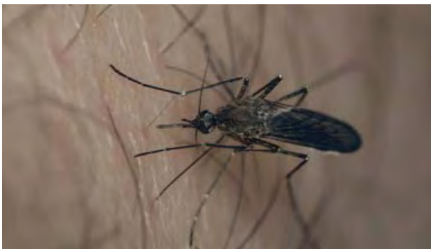
Figure 5. Female adult mosquito.

Only the female mosquito feeds on blood, which is essential for egg production (Figure 5). She uses her long proboscis to pierce the skin of the host and to suck blood. Depending upon the species, most female mosquitoes either lay eggs in rafts on water's surface (e.g., Culex spp.); singly on the water's surface (e.g., Anopheles spp.); or on wet soil/mud prone to flooding (some Psorophora and Aedes spp.). After eggs hatch, larvae develop in stagnant standing water including floodwater, shallow pools or ponds, ditches, artificial containers or tree holes. Some mosquito species breed in specific types of stagnant water. Larval (wrigglers) and pupal (tumbler) forms are aquatic, and in contrast to many insects, the mosquito pupae are