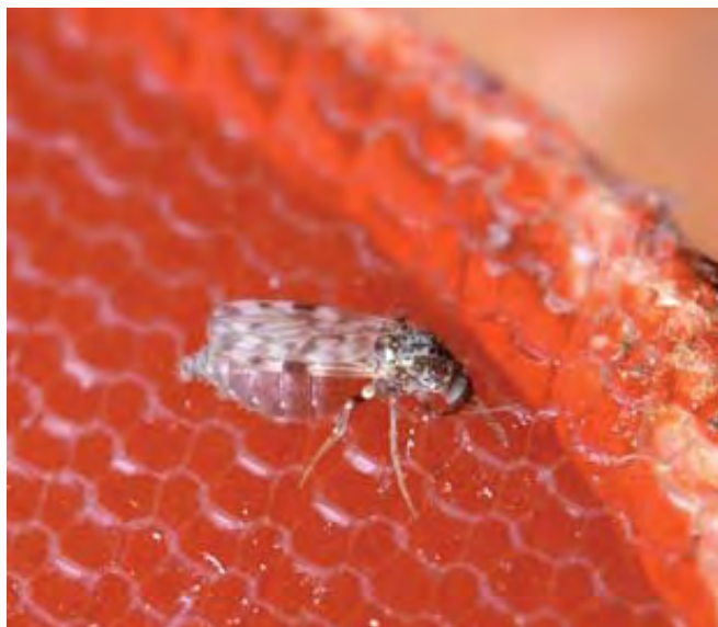
Figure 9. Adult biting midge, Culicoides sonorensis Wirth and Jones.

Adults are less than \frac{1}{8} inch and sometimes closer to \frac{1}{16} of an inch in length (Figure 9). Wings are covered with dense hairs that result in pigmented patterns on the wings. Mouthparts are well-developed with elongated mandibles adapted for blood sucking. Both males and females feed on nectar, but only the female feeds on blood, which is necessary for her eggs to mature. Biting midge eggs are only about \frac{1}{100} inch long and are laid on moist soil. Eggs hatch into worm-like larvae with short