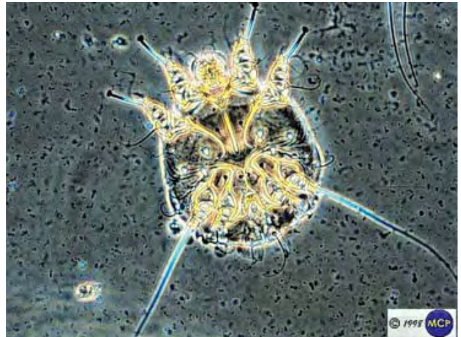
Figure 26. The itch mite, Sarcoptes scabiei (DeGeer).

Tiny microscopic mites (Figure 26) are occasional pests that invade the skin of equines. Mites can cause certain skin conditions such as dry, cracked and scabby skin, often referred to as mange.