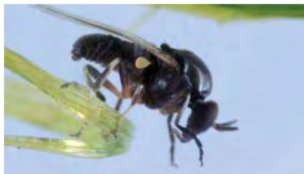
Figure 7. Adult black fly, Simulium slossonae . (J. F. Butler, University of Florida)

Immature black flies can be found in virtually any flowing water, from small intermittent streams to large rivers. Eggs are either laid on the surface or in the water. In several species, black flies overwinter as eggs that hatch into larvae in late winter or early spring. After hatching, the spindle-shaped larvae will attach to suitable substrates (submerged rocks, debris or trailing vegetation) with the aid of silk glands and the posterior sucker (Figure 8). Once attached, the larva is able to filter (from the flowing water) food material, such as diatoms and small particles, with its mouth brushes. The larval period of six or seven instars (stages) varies in length