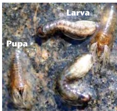
Figure 8. Immature life stages of black fly, Simulium decorum Walker.

depending on the species and water temperature. Pupation or transformation of the larva into pupa (a transitional phase between the adult and larva) occurs in a basket-like cocoon on the object that the larva was attached to last (Figure 8). The pupa, which does not feed, breathes through respiratory filaments.