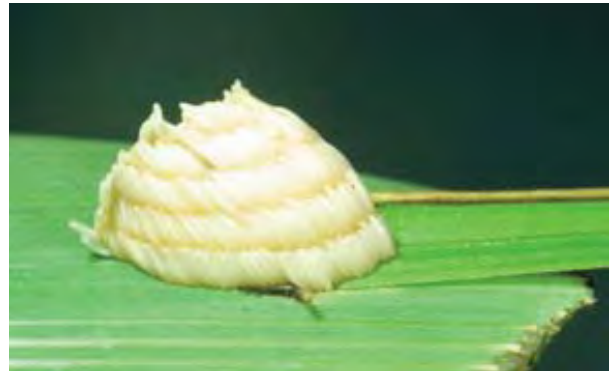
Figure 3. Horse fly eggs on vegetation.