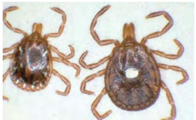
Figure 25a. Lone Star tick, Amblyomma americanum .

Five tick-borne pathogens that result in human disease occur in Arkansas. See FSA7047, Tick-Borne Diseases in Arkansas ( https://www.uaex.uada.edu/Other_Areas/publications/PDF/FSA-7047.pdf ), for more information on tick-borne diseases in Arkansas. In addition, ticks have been shown to transmit pathogens such as equine granulocytic ehrlichiosis, tularemia and Lyme disease in equines. More recently, equine piroplasmosis (also called horse tick fever or babesiosis) was identified from horses in south Texas.