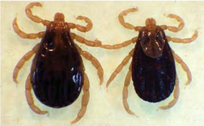
Figure 25d. Winter tick, Dermacentor albipictus (Packard).