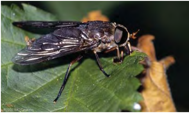
Figure 1a. Black horse fly ( Tabanus atratus ).