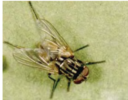
Figure 15. Adult house fly, Musca domestica L.

The house fly, Musca domestica L., is not parasitic on animals but rather is a non-biting premise fly (Figure 15) that is ¼ inch long and often seen around barns, stables, corrals and garbage. House flies are dull gray with four black stripes on the thorax. They breed in manure, decaying feed, organic matter and garbage. Their life cycle (Figure 16) consists of egg, larval (maggot), pupal