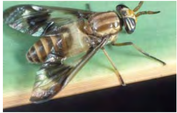
Figure 2. Deer fly ( Chrysops reicherti).