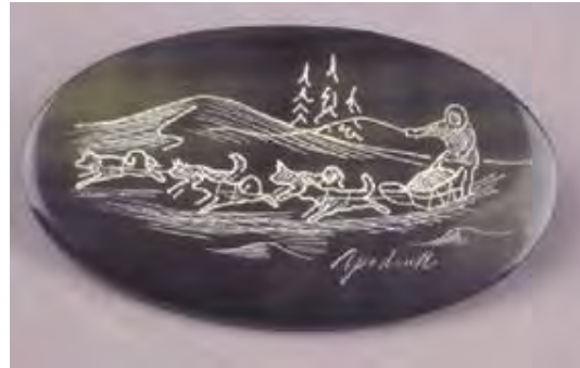
Scrimshaw on Baleen by Harry Apodruk Burke Museum Collections, 1999-97/205