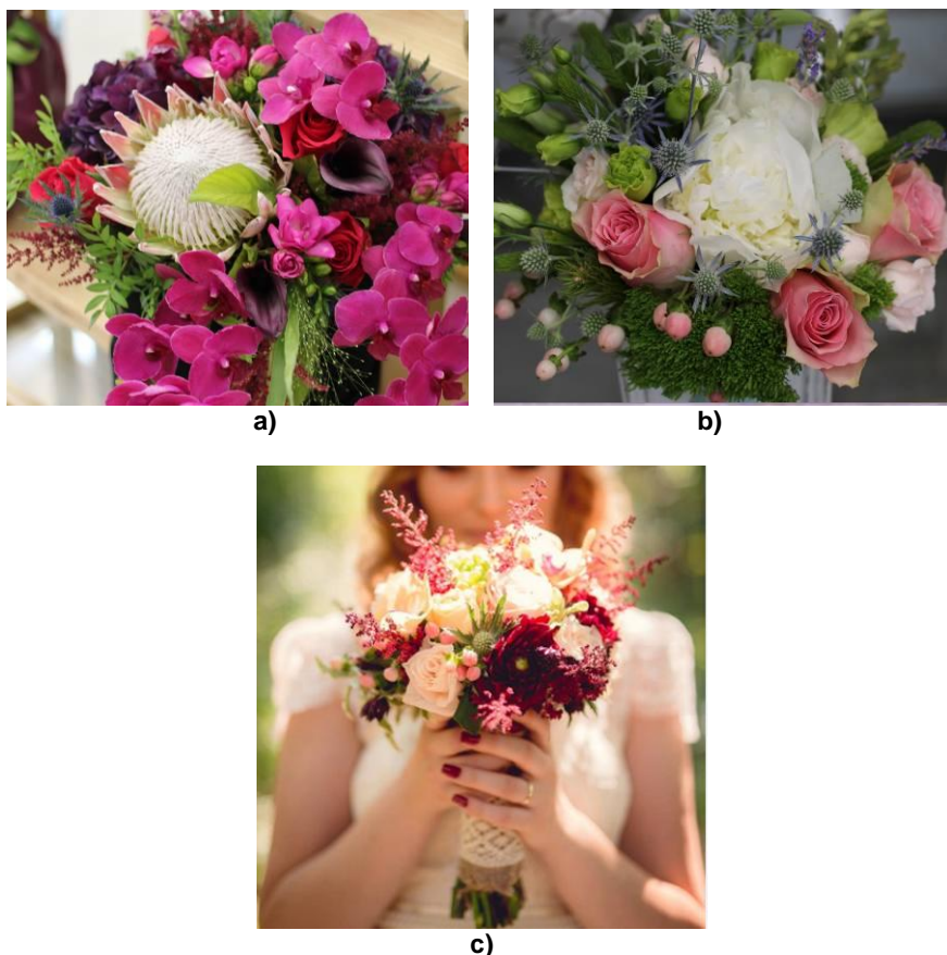
Fig. 2 Floral design with inflorescences of E. alpinum 'Superbum' (a) and E. planum cv. 'Blue Sea Holly' (b, c) (original)