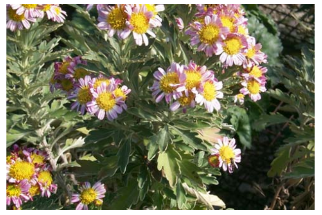
'Pink Ice' flowers in early November

Varieties - 'Pink Ice' has performed very well from 2001 to 2006 in trials at the UK Horticulture Research Farm.