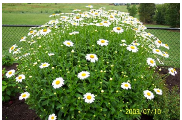
Becky' at UK Arboretum 2003/87/16 Becky' Thomas Killen'

Varieties - 'Alaska', 'Aglaia', 'Becky', 'Esther Read', 'Marconi', 'Polaris', 'Snow Lady', 'Thomas Killen', 'Wirral Pride'. 'Becky' (2003 Perennial Plant of the Year) and 'Thomas Killen' have performed well in trials at the UK Horticulture Research Farm.