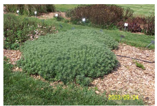
Three year old plants of 'Pink Ice' in early September in UK trials.