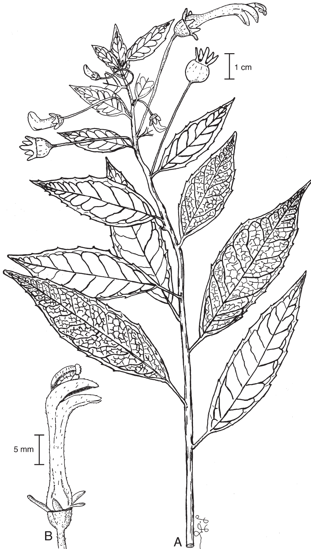
FIG. 1. Burmeistera monroi . A. Habit with flower buds, flower, and fruit. B. Flower in female phase. All drawings by L. Lagomarsino based on A. K. Monro 7142.