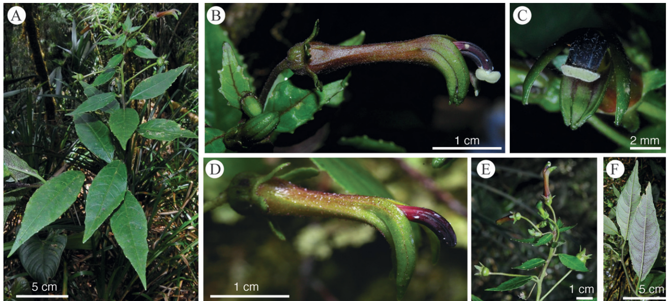
FIG. 2. Burmeistera monroi , photographs from field collections. A. Habit. B. Flower in female phase, lateral view. C. Flower in female phase, frontal view with detail of stigma and anthers. D. Flower in male phase, lateral view. E. Flowering branch with developing fruits. F. Abaxial leaf surface. All photos are of A. K. Monro 7142 except D, which is of A. K. Monro 6986.

from B. monroi by its hemi-epiphytic to epiphytic habit (versus terrestrial), glabrous corolla (versus sparsely to moderately pubescent), and oblong-ovoid berry (versus globose).