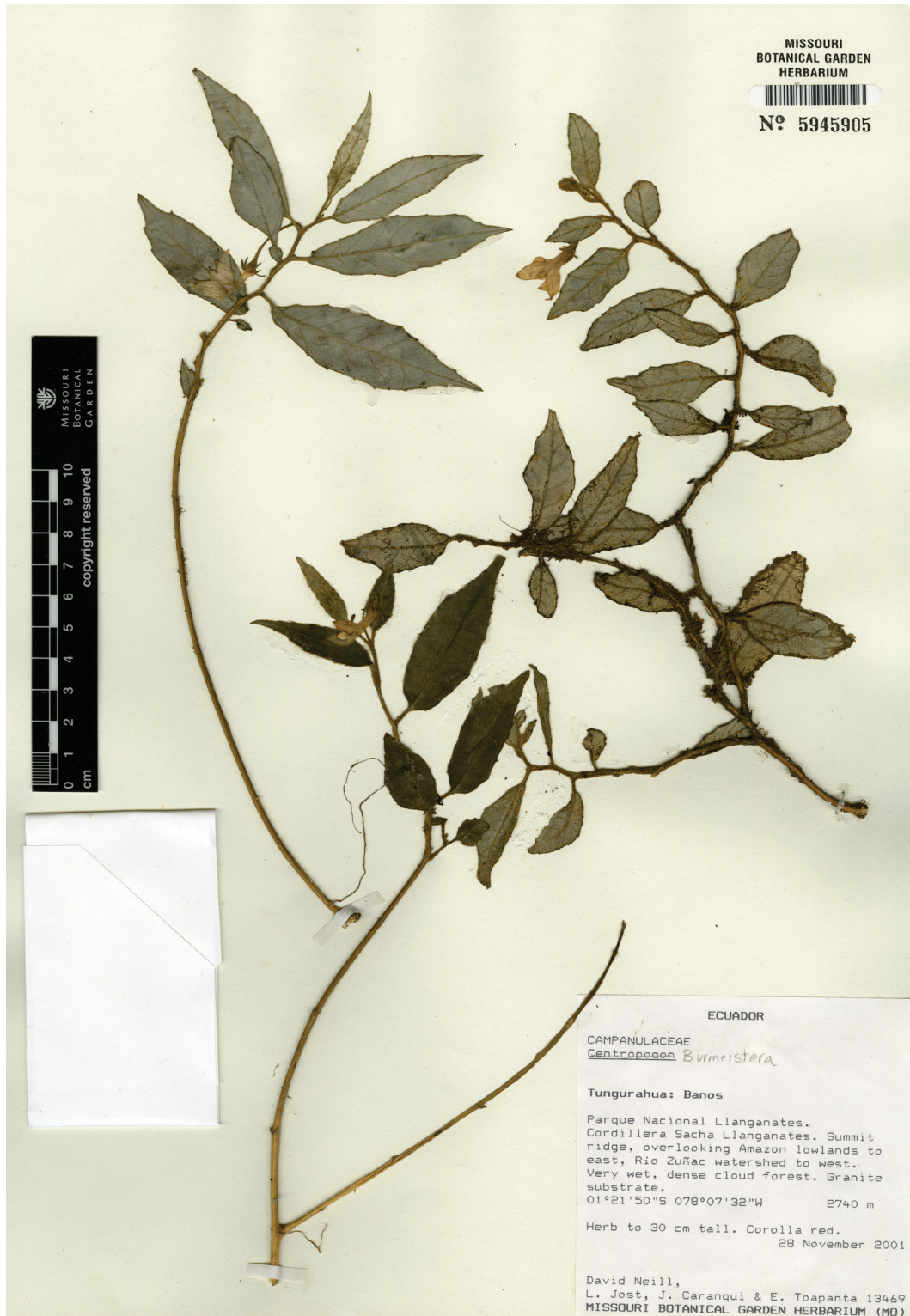
FIGURE 4. Burmeistera jostii Muchhala & Mashburn. Holotype, D. Neill, L. Jost, J. Caranqui, & E. Toapanta 13469 (MO). Image produced with permission.

two dorsal lobes 9–12 × 5–6 mm, ascending further than the androecium, the dorsal sinus 10–11 mm from the corolla base, the two lateral lobes 8–11 × 4–5 mm, slightly falcate, recurved, the ventral lobe ca. 9–10 × 4–5 mm, the ventral sinus 5–6 mm from the corolla base; androecium 13–14 mm, exerted 6–8 mm from the ventral opening, the filament tube pale green, pilose with white hairs, the anther tube pale-green, glabrous, the three dorsal anther tips glabrous, the two ventral anther tips sparsely pubescent with white hairs; style and stigma unknown. Fruits turbinate, pink; seeds unknown.