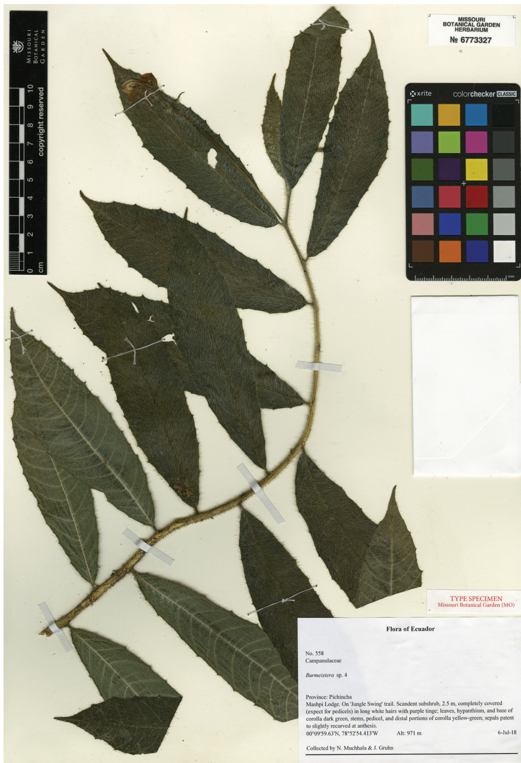
FIGURE 2. Burmeistera catulum Muchhala & Mashburn. Holotype, N. Muchhala & J. Gruhn 558 (MO). Image produced with permission.

1. Burmeistera catulum Muchhala & Mashburn, sp. nov. TYPE: Ecuador. Pichincha: Mashpi Lodge, on ‘Jungle Swing’ trail, 971 m, 00°09’59.63”N 78°52’54.413”W, 06 Jul. 2018 (fl, fr), N. Muchhala & J. Gruhn 558 (holotype, MO-6773327!; isotypes, HUTI!, QCA!, QCNE!). Figures 1A-C, 2.