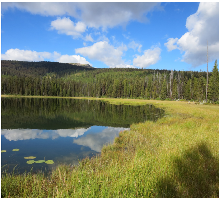
Peat mat at Meadow Lake

The Montana Sphagnum flora is relatively rich (19 species) compared to the Idaho (17 species) and Wyoming (14 species), but fewer species than the province of Alberta (24 species). The most species-rich of Montana fens are Shoofly Meadows in the Rattlesnake Mountains, Mud Lake Fen near Skalkaho Pass, and Meadow Lake in the Mission Mountains, each with six species of Sphagnum .