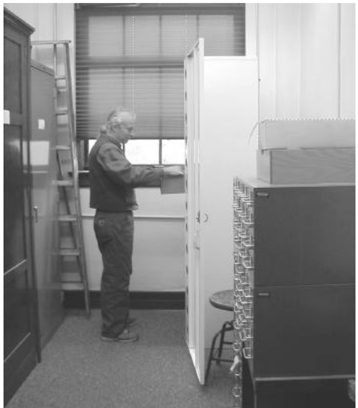
Non-vascular room at the UM Herbarium (botanist for scale)