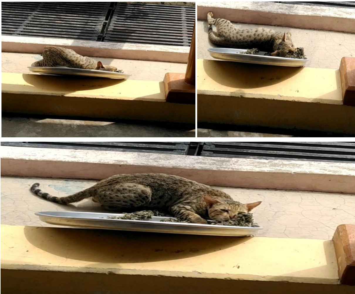
A cat attracting towards broken leaves of N. Hindostana .

Whole aerial parts [18] or dried leaves of N Hindostana are used [15].