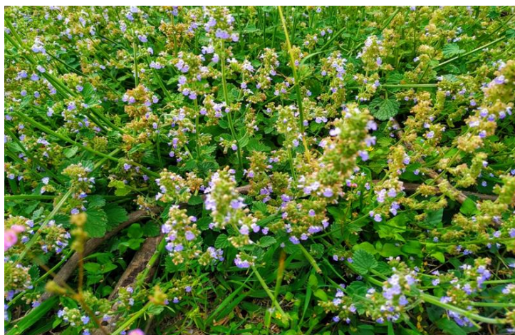
Fully matured plant of Nepeta hindostana with bluish purpule flowers collected from Forest Research Institute Dehradun (FRI)

The genus Nepeta belongs to the family Lamiaceae and about 250 species of this genus are known. Nepeta Hindustani (Roth) Haines mainly consist of leaves also some time whole aerial part of the plant and is an important medicinal plant of the Indo- Pakistan subcontinent. In Indigenous System of Medicine particularly of Unani Medicine it is known as Badranjboya and is used to cure fever, sore throat and as cardiotoxic as well [1]. Its extract is reported to lower the blood cholesterol level in animals [2]. Leaves are also chewed to relieve toothache. Badranjboya is composed by two words “Badranj” and “Boya”. Badranj is known as Turanj in Unani whereas Boya means fragrance. The name “Badranjboya” has been coined due to its fragrance which is like that of citron (Badranj, Utruj or Turanj); it smells like Utruj so called Badranjboya [3].