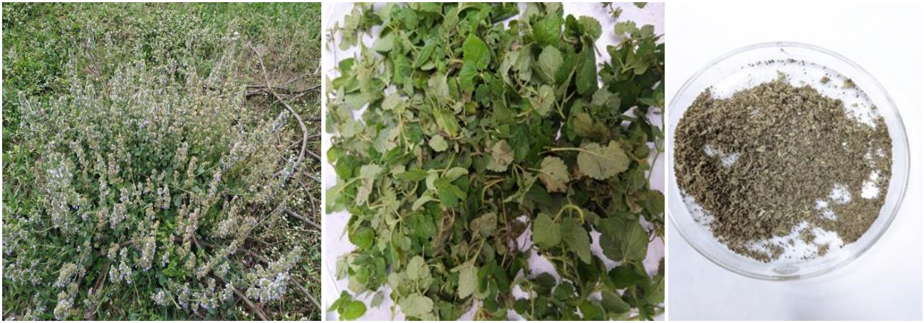
N. Hindostana whole plant, leaves, flower and seeds