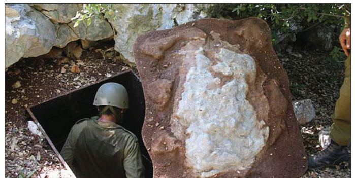
IDF CLEARS UNDERGROUND HEZBOLLAH BUNKER IN SOUTHERN LEBANON.

In response to this attack, IDF initiated Operation Grapes of Wrath to find and destroy rocket supply depots, rocket launchers, and individual Hezbollah terrorists. IDF attacked several hundred Hezbollah safe houses and rocket storage facilities in southern Lebanon with artillery, air strikes, and infantry units. 4 While Operation Grapes of Wrath led to a temporary decrease in the mortar and rocket attacks, it did not eliminate them. Throughout the late 1990's, Hezbollah continued to strike at Israel with mortar fire and rockets from southern Lebanon. 5 The IDF responded to these attacks also with counterbattery artillery fire, air strikes, and ground operations.