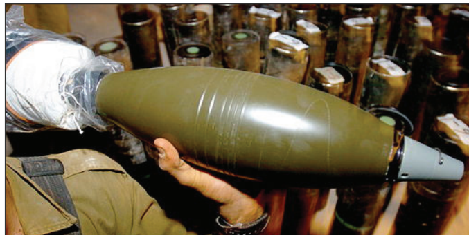
CAPTURED HEZBOLLAH MORTAR AND ROUNDS IN MAHVIV, LEBANON.

Due to the availability of Soviet-era military equipment throughout Egypt, Libya, and Syria, these low-tech weapons have been readily available in southern Lebanon and Gaza throughout the conflict with Israel. The Iranian Ammunition & Metallurgy Industries Group (AMIG), part of Iran’s Defense Industries Organization (DIO), has successfully reverse-engineered and is currently producing a number of Russian and Israeli mortar designs in 60mm,