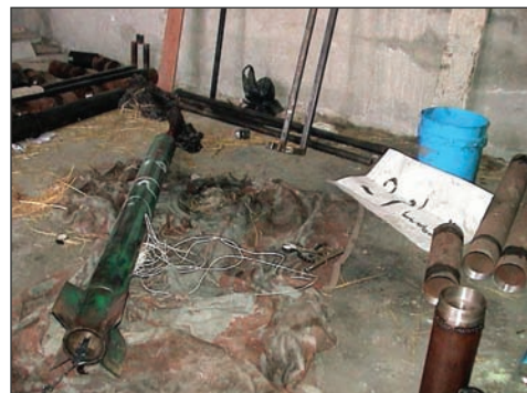
QASSAM ROCKETS IN A GARAGE IN TUL KAREM.

The Qassam series of rockets started as low-cost, homemade weapons produced with locally available materials in Gaza, yielding a short-range, inaccurate, small-payload