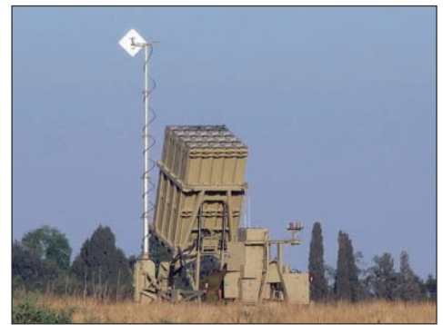
IRON DOME LAUNCHER NEAR SDEROT, ISRAEL.

serious damage at the intended point of impact. After detonation, debris may hit the ground, but because the warhead detonates or disintegrates in flight, there is little danger of consequential damage from the destroyed rocket or mortar round.