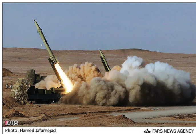
IRANIAN SHAHAB MISSILES.

As a tactical military weapon, the Scud missiles shot into Israel from Iraq in 1991 were ineffective and inaccurate. Scud missiles did not hit any significant military, government, or infrastructure targets, and only two Israelis died from the direct impact of Scuds. 43 As an instrument of terror, however, the Scuds were very effective. Targeting