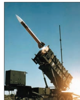
PATRIOT MISSILE.

The United States developed the Patriot missile system, and it entered service in 1984. It was originally intended to defend against aircraft. Shortly after introduction to service, a program was initiated to upgrade the Patriot to protect against ballistic missiles. By the First Gulf War of 1991, it had achieved operational capability in the anti-missile role. 54 The most advanced IDF version of the Patriot, the Patriot Advanced Capability-3 (PAC-3), is intended to defend against short- to medium-range ballistic missiles. The most likely missiles that IDF Patriots would target include older Scud missiles and Scud variants, such as Shahab-1 and Shahab-2. 55