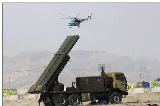
IRANIAN FAJR-5

the border to Hezbollah safe havens in southern Lebanon. 32 Fajr-3 has a range of 45 kilometers with a 45-kilogram warhead, and the Fajr-5 has