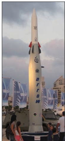
ARROW MISSILE.

The Arrow missile system defends against medium to long-range ballistic missiles. Arrow can defeat the largest, longest-range, and fastest missile threats. The most likely missiles that Arrow would target would be Shahab-3, Shahab-4, and Sejil missiles. Israel has developed three versions of the Arrow missile: the baseline Arrow-1 technology demonstrator, the Arrow-2 initial operational variant, and the Arrow-2, the most capable version in use today. 52