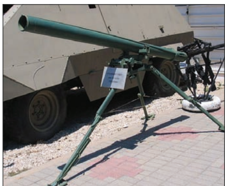
GRAD ROCKET LAUNCHER AT BATEY HA-OSEF MUSEUM, TEL AVIV.

against Israel in over a year. 27 Hamas appears to prioritize Qassam rockets to conduct ongoing, low intensity harassing fire against Israel, thereby saving the limited quantity Grad rockets for specific targets or events, such as responding to IDF airstrikes in Gaza.