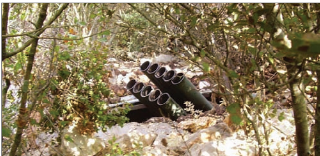
HEZBOLLAH KATYUSHA ROCKETS IN SOUTH LEBANON WITH CONCEALED LAUNCHER.

For over thirty years, Israel has endured mortar and rocket attacks from southern Lebanon and responded with overwhelming force. The first large scale attacks were initiated by the Palestinian Liberation Organization (PLO) in July of 1981, with a barrage of rockets targeting Galilee. 1 In response to this attack, the IDF retaliated with air strikes and ground operations that forced the PLO to suspend the strikes. Immediately following the Israeli invasion of Lebanon on June 6, 1982, the PLO again targeted Israeli villages in Galilee with mortar and rocket fire. 2 Along with counterbattery fire by artillery and airstrikes against the PLO firing locations, the IDF responded by occupying territory in southern Lebanon to suppress the attacks. As the PLO declined in political relevance and military capability in Lebanon, the terrorist organization Hezbollah emerged and initiated a new wave of attacks. By April 1996, Hezbollah attacks from southern Lebanon evolved from intermittent, disjointed, and poorly targeted strikes to a sustained and coordinated offensive. At that time, Lebanese Hezbollah fired more than 600 Katyusha rockets into Israel over a two-week period. 3