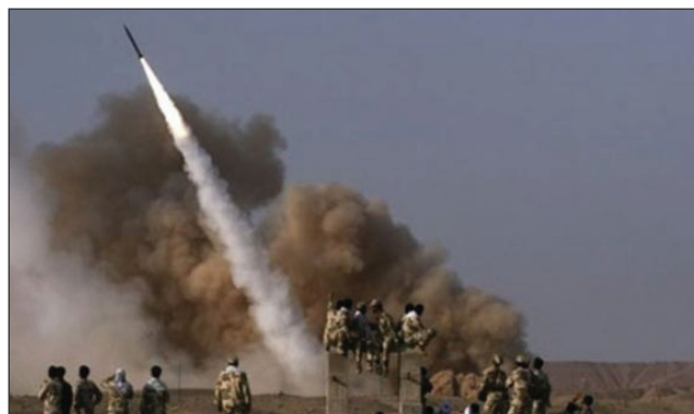
IRANIAN ZELZAL ROCKET.

Zelzal rockets are Iranian-produced rockets of a Russian design. With a 210-kilometer range and a 600-kilogram warhead, these rockets represent a substantial increase in range and payload over the Katyusha and Fajr rockets. A Zelzal rocket with a 210-kilometer range fired out of southern Lebanon could target all of the population centers of Israel except for Eilat on the Gulf of Aqaba. Zelzal rockets were reportedly shipped from Iran to the Bekaa Valley in 2002, but IDF officials have never confirmed any attacks in Israel by Zelzal rockets. 34 Given the size of the warhead, it is unlikely that any Zelzal rocket attacks would have gone unreported in the press. Hezbollah has hinted that it has Zelzal rockets in southern Lebanon. In October 2002 Sheikh Mohammed Yazbek, head of the Juristic Council of Hezbollah, said "All sensitive areas of the Zionist entity were within the range of our fire ... wherever they exist." 35