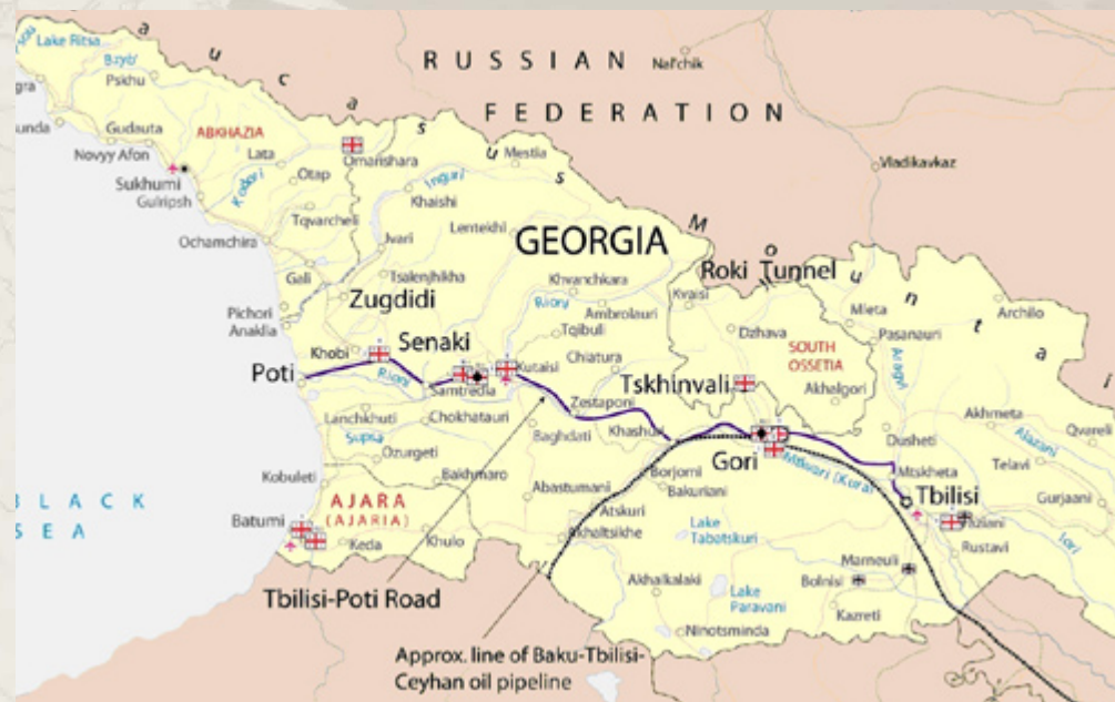
Map 2: Russian Airstrikes through August 18, 2008