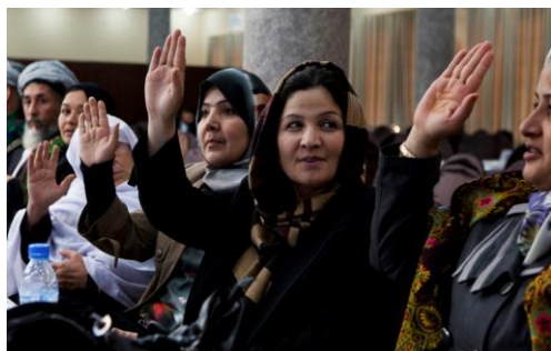
Female Provincial Council members vote on proposed amendments to PC law, at an ASGP-supported female PC regional forum.

Highlights of progress in key subnational legislation and regulations during 2014 included the passage of the Provincial Council Law, and the development of new regulations for provincial and district governance. Progress against this indicator at the close of 2014 is at 80% and off target of what is needed to fully achieve the target of approval of three laws and the drafting of at least three regulations, according to IDLG's Policy Directorate.