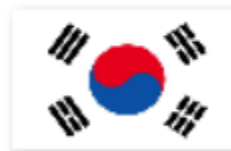
Republic of Korea