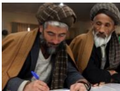
PC members take notes during a monitoring mission in Balkh.

Thirty four of the former PCs and twenty four newly elected Provincial Councils include members that undertook monitoring missions to districts during 2014, according to GDCLCA, as progress against the indicator is on target of 50% of PCs whose members undertook monitoring missions. The PCs that participated are from the provinces of Nangarhar, Nuristan, Laghman, Kunar, Kunduz, Kabul, Logar, Parwan, Wardak, Kapisa, Zabul, Uruzgan, Takhar, Baghlan, Badakhshan, Herat, Badghis, Ghor, Farah, Balkh, Faryab, Saripul, Samangan, and Jawzjan.