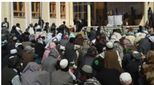
A public district governance forum in Miramor district.

21 PGOs have provincial communication strategies, and progress against this indicator is off target of 27 PGOs (or 80% of PGOs) that have Communication Strategies.