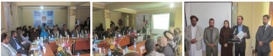
Views of Charikar MAB second year election and accomplishment reporting to GDMA, municipality and citizens.

The provincial municipalities include Mazar, Maimana, Sheberghan, Aybak, Sari Pul, Faizabad, Taloqan, Bamyan, Nili, Mehtarlam, Jalalabad, Qala naw, Cheghcheran, Herat, Farah, Bazarak, Charikar, Mahmood Raqi and Kandahar. Those municipalities that registered an increase in revenue are highlighted in the table below.