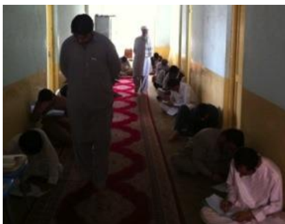
A PAR written test in Mehtarlam municipality.

Restructuring has been progressing in 33 municipalities throughout 2014, and progress against this indicator and the year-long reform process is on-target at 100%, with Q4 progress at 45%, above the 35% quarterly target.