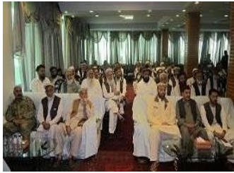
President Ghani's initiative, Jalalabad Reform and Change Workshop