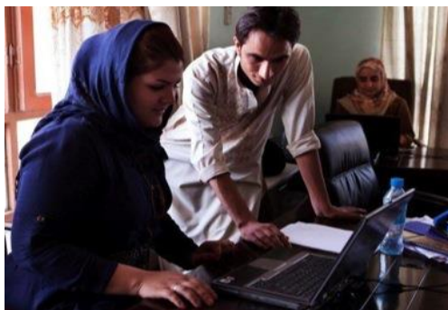
ASGP-supported NTA personnel train the tashkeel in Herat.

Training on the Office Manual reached approximately 31% of all tashkeel staff in the PGOs and 25% of DGOs in Q4, which exceeded quarterly targets and ensured that annual progress against this indicator is on-target of 90% of PGO tashkeel, and on target of 80% of DGO tashkeel. Training of tashkeel staff is provided by ASGP supported National Technical Assistance personnel embedded in