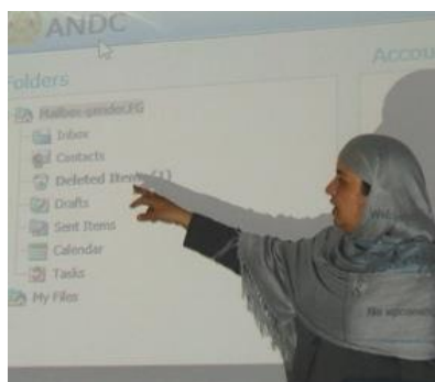
ASGP's Municipal Information Management Specialist leads a GDMA Gender Focal Group presentation.

Highlights of ASGP support to gender and organisational and personnel capacity development at IDLG included ASGP support to the development of a Gender Mainstreaming Plan, which built upon IDLG's updated Capacity Development Plan, also developed with ASGP's technical and financial support in 2014. ASGP personnel embedded at IDLG worked with IDLG's Gender Unit to develop and implement the Gender Mainstreaming Plan, which prioritises personnel capacity development of IDLG's female tashkeel, including female service tashkeel as well as technical and tashkeel personnel. The plan, which followed a capacity assessment, includes weekly coaching and mentoring classes for all female tashkeel, as well as workshops on gender mainstreaming, and capacity assessments in Q4 demonstrated improved capacity scores. The plan also identifies stronger linkages on gender, between IDLG central and provincial Gender Committees, as important to promote knowledge sharing and networking among female personnel, and foregrounds training in other gender policies, such as the ASGP-supported Anti Harassment Policy, developed in 2013 and the first such anti-harassment policy in Afghanistan.