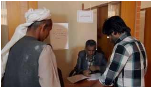
A film still showing a customer at the Citizen Service Centre in Balkh. The film is available in Dari, English and Pashto, on TV and on websites including UNDP and the UNDP Afghanistan channel on You Tube.

Northern provinces during Q3, for example, some 1000 citizens used each centre to seek services from the PGO and line departments, register petitions, and receive official letters (maktoob) and Tazkira. The CSC is an ASGP-IDLG-PGO initiative that streamlines citizens' access to the PGO and relevant Line Departments to receive citizens' petitions, grievances and needs requests, and allows citizens to contribute to PGO decision-making. This supports effective and accountable governance that is responsive to citizen needs and priorities and supports service delivery.