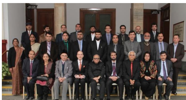
A Mayoral exposure visit to India, 1-13 January 2014. Thirteen Mayors and three GDMA officials explored municipal governance, and lessons learned in areas such as revenue management and service delivery.

Ten municipalities now have gender priorities integrated into their CDP, with Faizabad, Taloqan and Jalalabad CDPs registering these priorities during Q4, in addition to Maimana Sangcharak and Nili in Q3, and Mahmood Raqi, Mazar, Heart, Charikar in earlier quarters. The integration of gender priorities into municipal CDPs is a first for Afghanistan, and is aligned with the ASGP-supported gender mainstreaming policy for municipalities. These