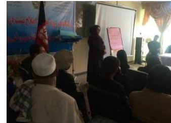
View of Reform and Change Workshop in Charikar

ASGP also supported GDMA to implement President Ghani's initiative to identify qualified Mayoral candidates for ten Mayoral positions. Mr. Ghani instructed GDMA to organise workshops in ten cities, inviting members of the public, civil society, and think tanks to discuss municipal challenges and present their vision as Mayor. ASGP's embedded municipal specialists at GDMA supported the directorate and their tashkeel colleagues to develop the concept and implementation framework, and ASGP's regional teams and the NTA personnel supported its implementation. The initiative was also promoted through the GDMA website ( www.gdma.gov.af )