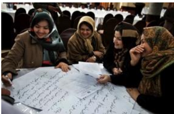
Female PC members at a capacity development workshop supported by ASGP.

Two hundred and seventy one PC members from twenty two PCs received capacity development training during 2014, as delays over the elections and inauguration of the PCs meant that progress is off target against this indicator, which aimed for 30 PCs (90% of PCs) with members that had received CD training.