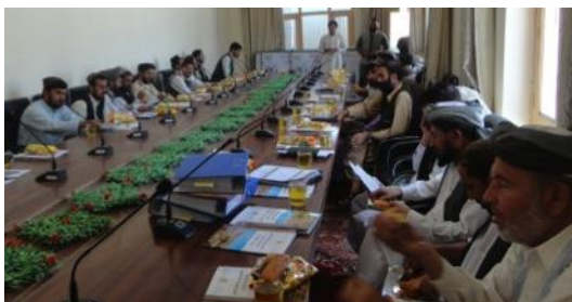
Zabul PGO leads a review of the Provincial Strategic Plan, with line department personnel, civil society, and development partners.

ASGP continued to support PGOs to update the PDPs, and at the close of Q4 all current PGO heads assess their PDPs as complete. Five provinces have finalised and completed PSPs: Helmand, Bamyan, Nangarhar, Laghman, and Takhar. Throughout 2014, work continued on the development of PSPs for Parwan, Panjshir, Kunduz, Ghor, Jawzjan, Saripul, Logar, Baghlan, Balkh and Herat. Of the PSPs, the profiling phase for Parwan, Panjshir, Kunduz, and Logar is 100% complete. In Q4 the profiling phase is now 90% complete for Baghlan, Ghor and Jawzjan, up from 80% in Q3, and IDLG has set a deadline of January 2015 for 100% completion of the profiling phase. The Saripul, Balkh and Herat PSPs have completed some 50% of the profiling phase of the PSP.