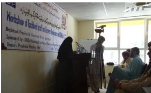
In Uruzgan, an official from the Human Rights Commission addresses a workshop on gender awareness for tashkeel personnel.

During 2014, 29 PGO HR plans include a Gender Mainstreaming Session, and progress against the indicator is off target of 30.