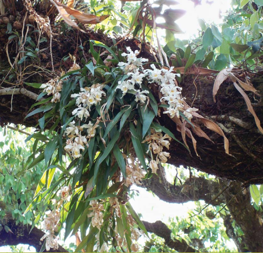
An orchid in Mandal Valley