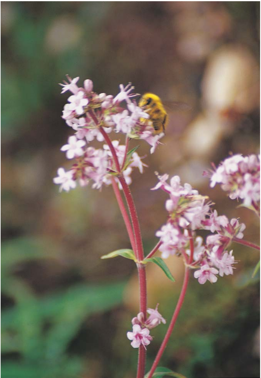
Nardostachys grandiflora DC.