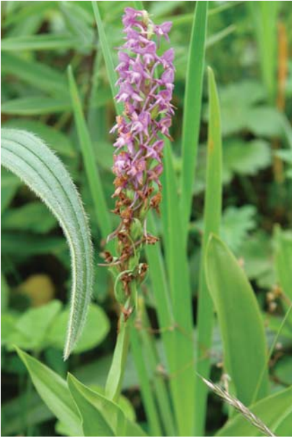
Dactylorhiza hatagirea ( D.don )

The Global Environment Facility was established in October 1991 as a $1 billion pilot program in the World Bank to assist in the protection of the global environment and to promote environmental sustainable development. As an independent financial organization, the GEF provides grants to developing countries and countries with economies in transition for projects related to biodiversity, climate change, international waters, land degradation, the ozone layer, and persistent organic pollutants. These projects