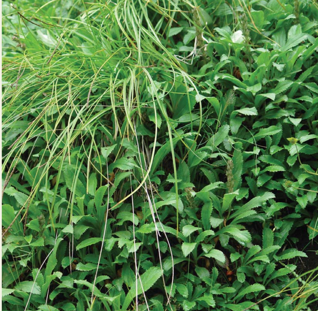
Picrorhiza kurrooa (Kutki)