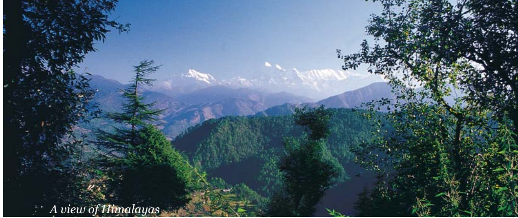
A view of Himalayas