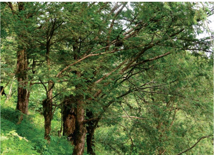
Taxus bacatta L.

benefit the global environment linking local, national and global environmental challenges and promoting sustainable livelihoods. The Global Environment Facility (GEF) unites 182 member governments in partnership with international institutions, nongovernmental organizations and the private sector to address global environmental issues. UNDP-GEF functions as an advisory team to UNDP staff, providing technical advice on the global environment as well as guidance on the Global Environment Facility (GEF) and its project cycle.