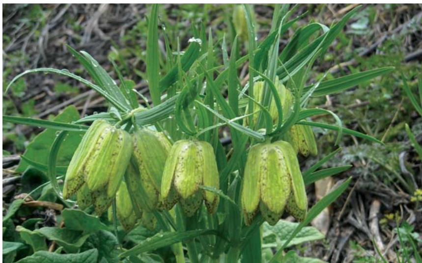
Fritillaria roylei HK