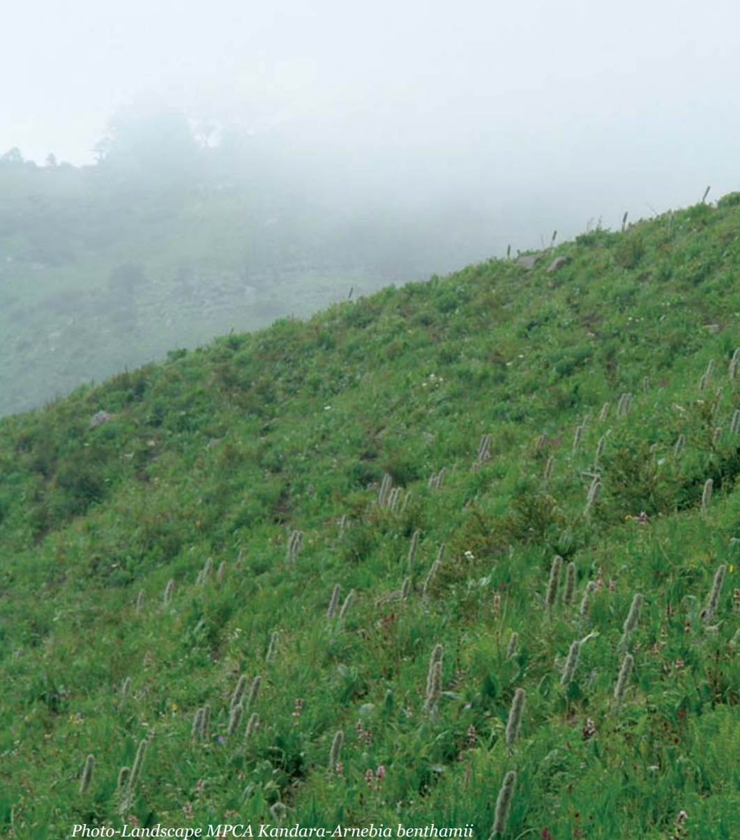
Photo-Landscape MPCA Kandara-Arnebia benthamii