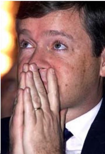
What a fine Messier

Jean-Marie Messier has finally decided to leave Vivendi Universal, a firm which he built from a French water utility into a glittering international media giant. Not only has that dream been shattered, but a financial crisis looms. A break-up seems inevitable