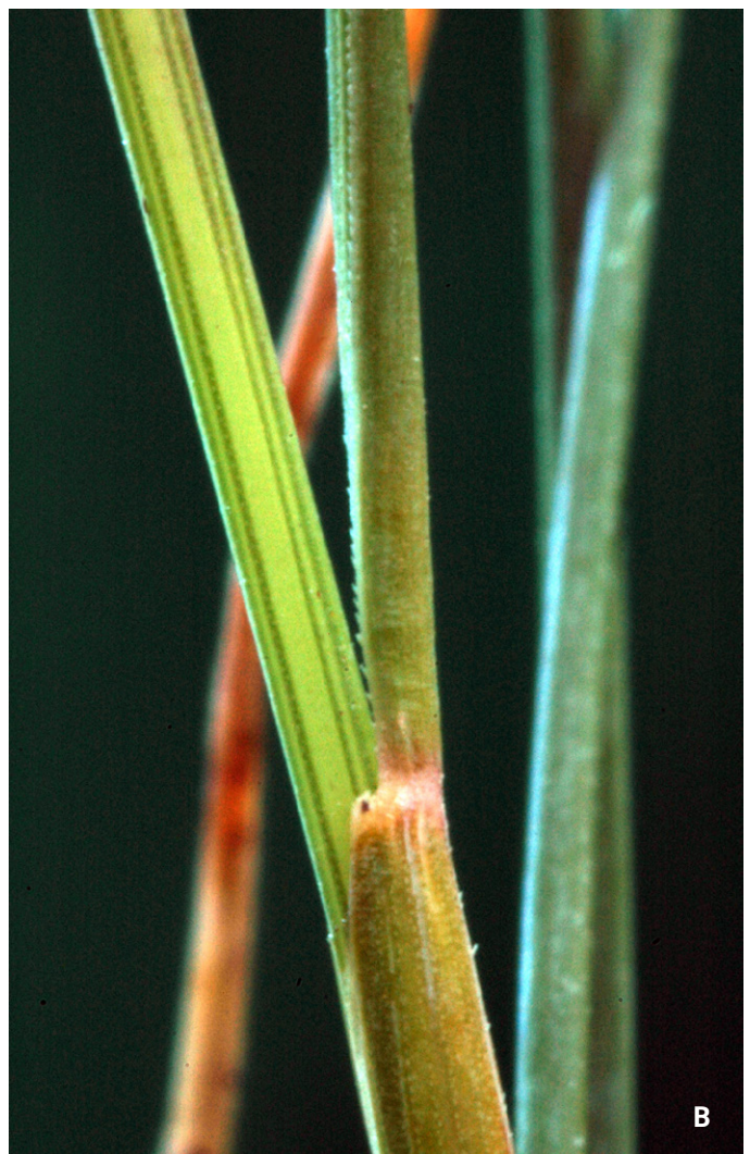
Figure 8. Festuca trachyphylla . A. Seedlings self-established beside a row of planted specimens, between concrete wall and plastic ground cover, Whareroa, western side of Lake Taupō, on 12 Dec 2015; CHR 641310. B. Close-up view of the blade, ligule and sheath.