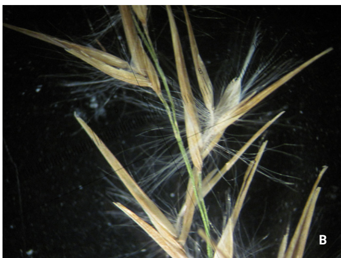
Figure 6. A. Dense stand of Phragmites karka ; Tahapa East Reserve, Meadowbank, Auckland, 21 June 2011. B. Florets of Phragmites karka ; Tahapa East Reserve, Meadowbank, Auckland, 21 June 2011.