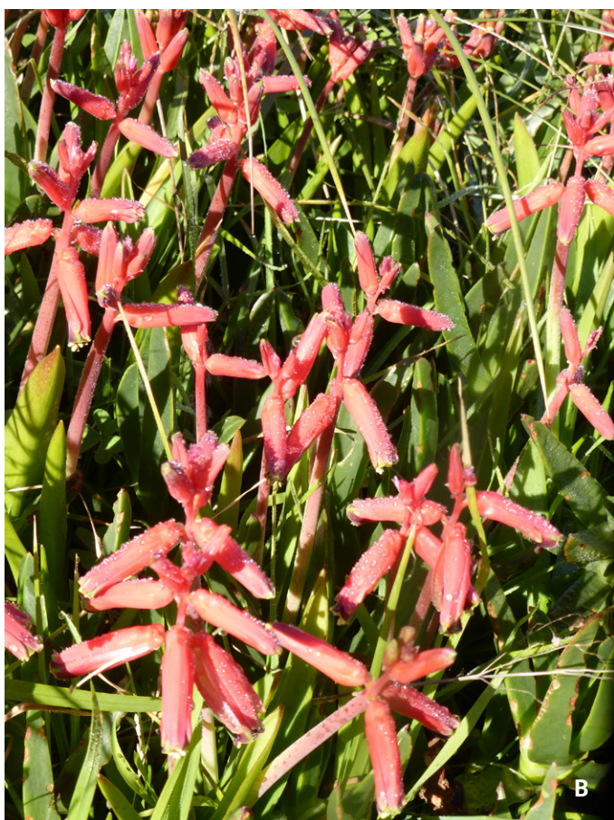
Figure 7. A. Flowering patch of naturalised Lachenalia bulbifera , in dunes with Ammophila arenaria and Yucca gloriosa , Bamber St, Castlecliff, Whanganui, 4 July 2016. Photo © Lynne Douglas. B. Naturalised Lachenalia bulbifera , in dunes with Ammophila arenaria , Bamber St, Castlecliff, Whanganui, 20 June 2017. Photo © Colin Ogle

NOTES: Cultivation Escape. Planted patch ca 2 m diameter, plants with many fruiting heads and seedlings common, up to 2 m from fruiting plants. Obtained in 2013 under the cv name of 'Tiny Piny Sweetie'. Most of the 'Tiny Piny' cultivars have coloured flowers and stems, the result of hybridisation, but the plants at Paloma Gardens were uniformly green and cream, including the seedlings.