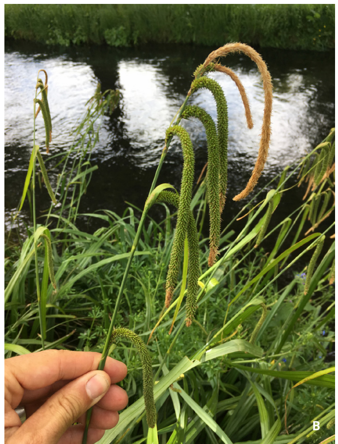
Figure 3. A. Fruiting naturalised plant of Carex pendula , Ashgrove Terrace beside Heathcote River, Cashmere, Christchurch, 28 April 2019. B. Fruiting heads of a naturalised plant of Carex pendula , Ernle Clark Reserve, Heathcote River, Cashmere, Christchurch, 28 Dec 2017.

Gore, Pukerau, 48 Pukerau Street, Pukerau Nursery.