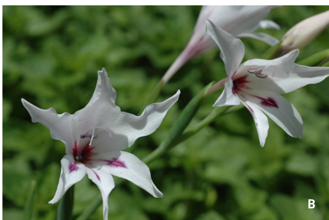
Figure 5. Gladiolus carneus . A. & B. Flowers of a cultivated plant, 21 Oct 2007, grown from corms of wild plants in dunes at Castlecliff Beach, Whanganui.

NOTES: Cultivation Escape and possible Garden Discard, in open forest, grassland and waste areas. The species was accepted as a \zeta entry by Healy and Edgar (1980). Also known as Anomatheca laxa (Thunb.) Goldblatt. There have been numerous collections of F. laxa since Edgar and Healy (1980), from sites where it is stated to be self-established or spreading, some not near planted specimens. It can multiply and reach new sites by seed and corms and we therefore regard F. laxa as Naturalised.