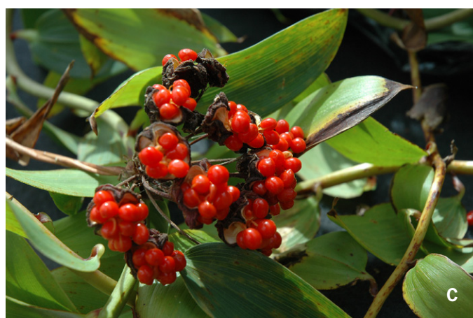
Figure 2. Naturalised Bomarea multiflora . A. scrambling in hedgerow and planted trees beside Rangatira Road, near Hunterville, Rangitikei, on 3 April 2007. Flowers ( B ) and fruit ( C ).