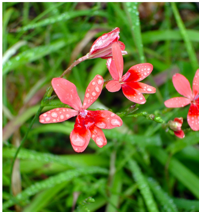
Figure 4. Flowers of naturalised Freesia laxa ; Upper Oakley Creek, Tāmaki, Owairaka, Auckland, 21 Oct 2006.

VOUCHER: AK 138550, E. G. Turbott s.n. , 17 Nov 1975, Auckland, Parnell, Cathedral Place (as Lapeirousia laxa ). SELECTED ADDITIONAL RECORDS AK 138550, E. G. Turbott s.n. , 17 Nov 1975, Auckland, Parnell, Cathedral Place (cited in Healey & Edgar, [1980] as a \zeta record); AK 138551, J. H. Goulding s.n. , 18 Nov 1975, Auckland, Remuera; AK 152036, J. H. Goulding s.n. , 7 Oct 1980, North Auckland, Whangaparaoa Peninsula, Tindalls Bay, foreshore reserve; AK 305651, E. Cameron s.n. , 17 Nov 1982, Auckland, Auckland University grounds; AK 168444, R. O. Gardner s.n. , 13 Sep 1984, Auckland, Herne Bay, 74 Sarsfield Street; AK 188917, M. M. Saies s.n. , 17 Dec 1989, North Auckland, Kaipara, Arapaoa;