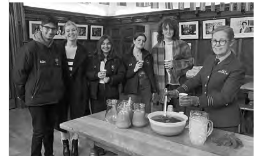
With current students at Univ's International "At Home" Day

However, community must be wider than that to be sustainable; it is wider and deeper and more embracing of everyone who touches it and who exists within it, and that is what we strive for, for our College. Some years ago, I asked Sir Ivor how he might describe Univ; he replied that it was a college for everyone, a view to which I have subscribed ever since. The purpose of education is to change life chances at all levels and for all people, regardless of where they start in life or where they are on their pathway.