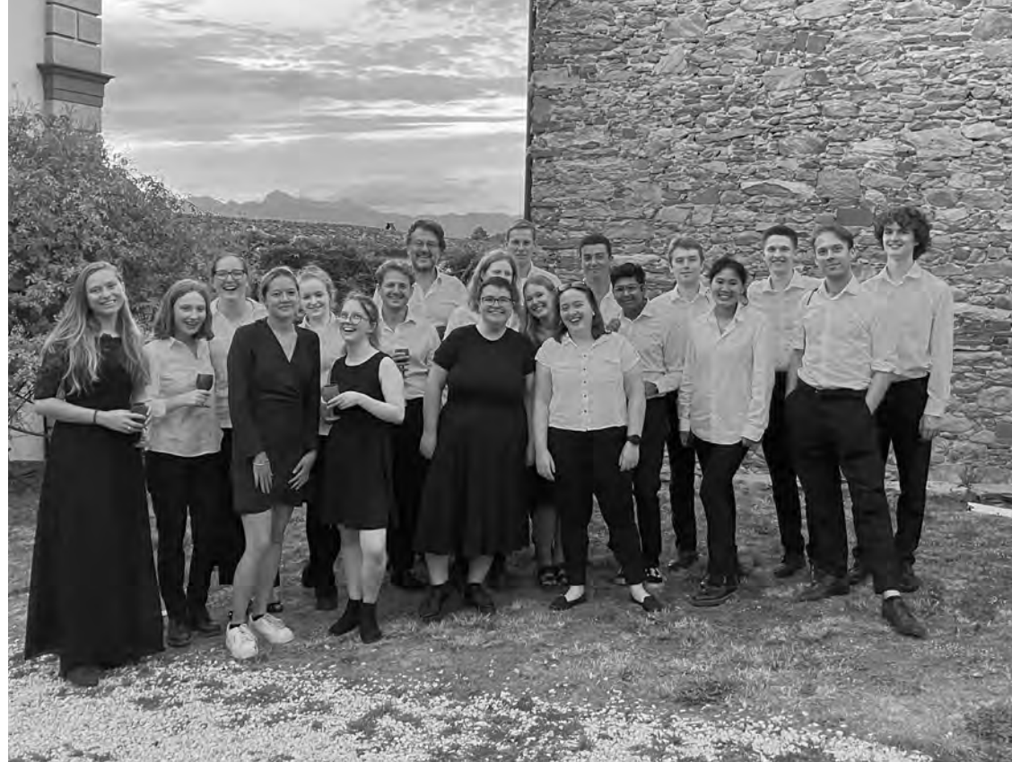
Univ Choir in Lucca 2022