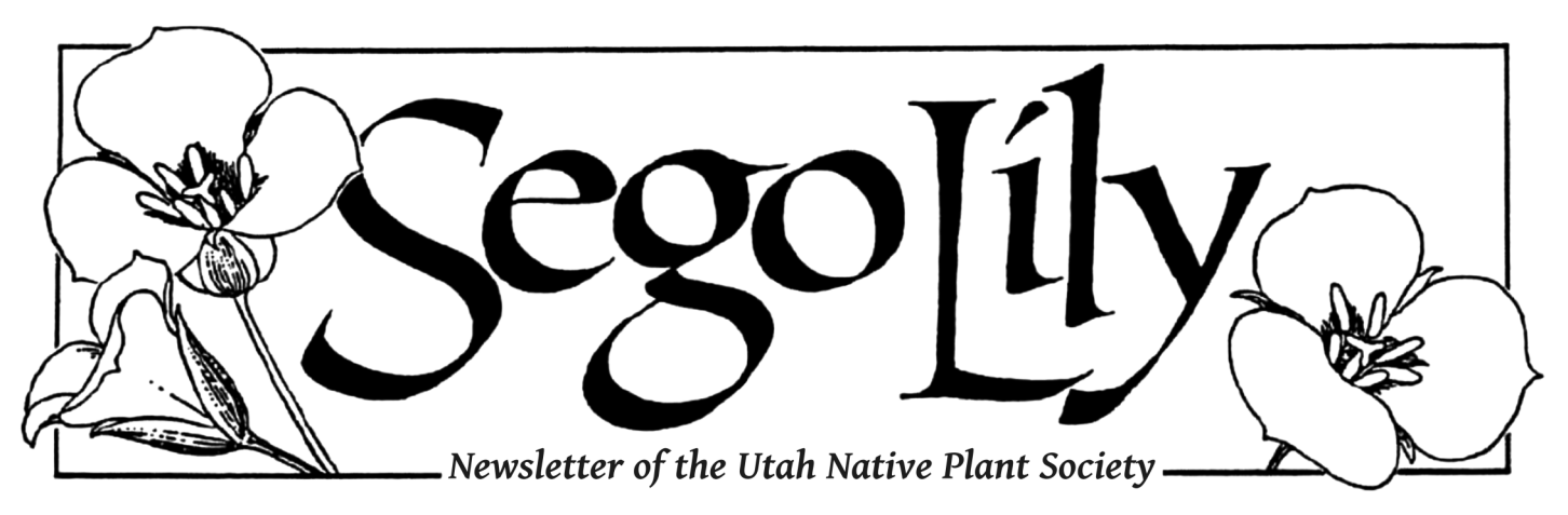
Winter 2020 Volume 43 Number 1