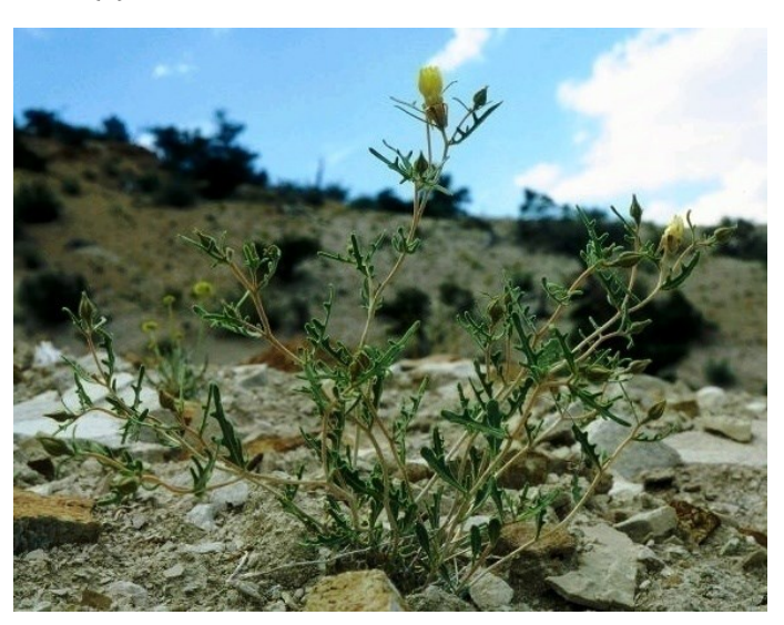
Mentzelia goodrichii habitat.

Threats include not only the Uinta Basin Railway proposal but also erosion as a result of fires above its habitat and likely herbivory and previously identified private home construction. May be one of the rarest plants in Utah. More surveys and pollination studies are needed.