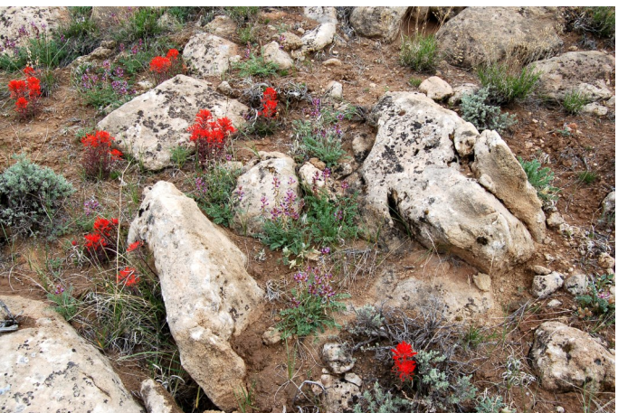
Astragalus equisolensis habitat.

Mentzelia goodrichii (occurs in Argyle Canyon – see discussion below)