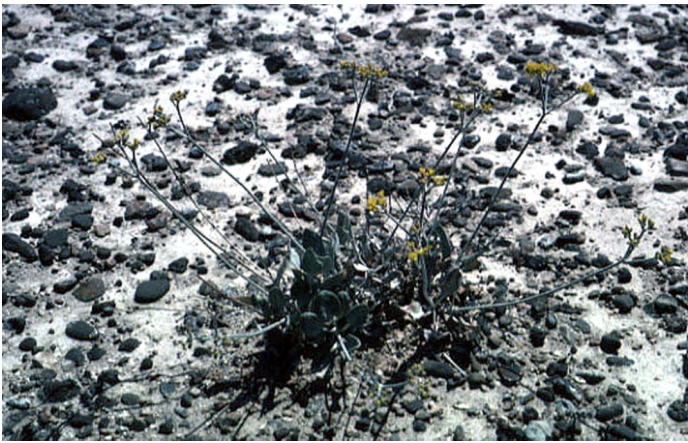
Eriogonum natum in habitat.

Cypripedium fasciculatum – threats may be escalating due to logging/aspen restoration proposals and/or as a result of timber removal as a result of fires, and should stay as a 1. Trend elsewhere may be downward but remains unknown for Utah. Plants may also occur in Cache Co. but not documented.