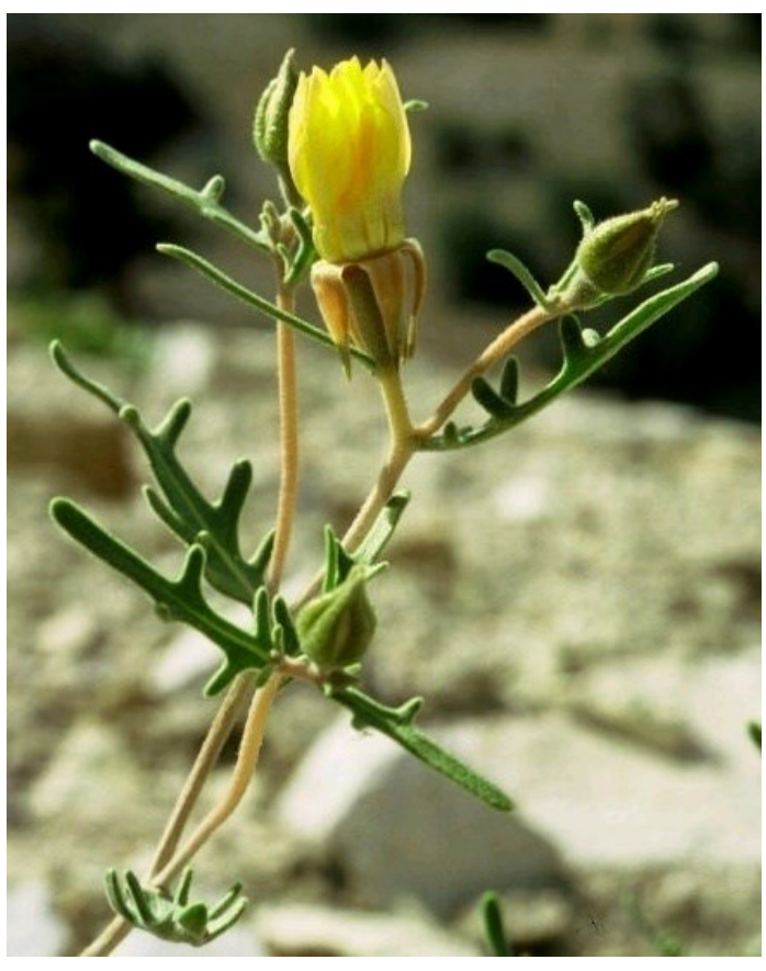
Mentzelia goodrichii.

Mentzelia goodrichii - threats changed from 0 to 1 and intrinsic rarity from 0 to unk.