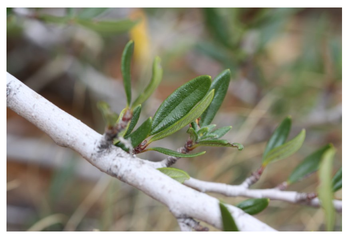
Tiny leaves of Cercocarpus ledifolius.

and curl inwards a little, particularly in the heat and dryness of the summer months but not in an unattractive way. The dark green contrasts nicely with the silvery color of the bark of the tree. If you might happen to accidentally scrape the bark, the mahogany color of the wood below is revealed.