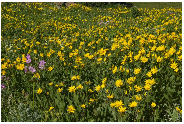
Helianthella uniflora is one of our more common plants and is often found in large colonies.