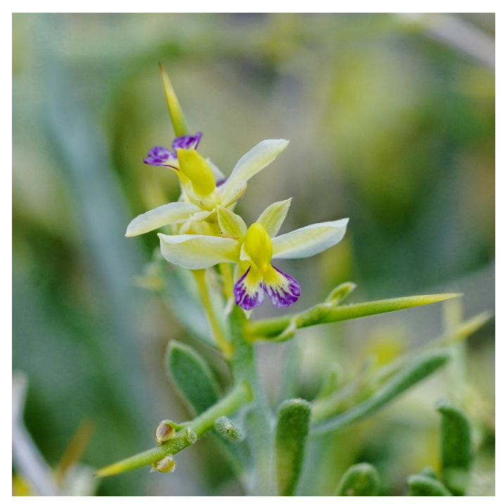
Rhinotropis intermontana; Myriopteris gracilis.

This is a petite cactus with pink flowers that is sometimes called "deciduous" because it sheds its pads in winter and dies back to an underground tuber.