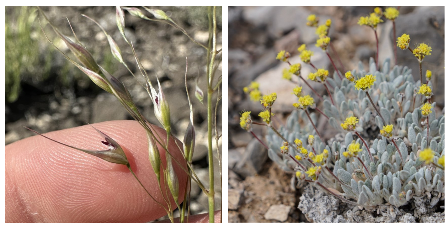
Probably Eriocoma hymenoides x E. arida ; Eriogonum shockleyi x E. eremicum , displaying similar features to when E. shockleyi hybridizes with E. natum .