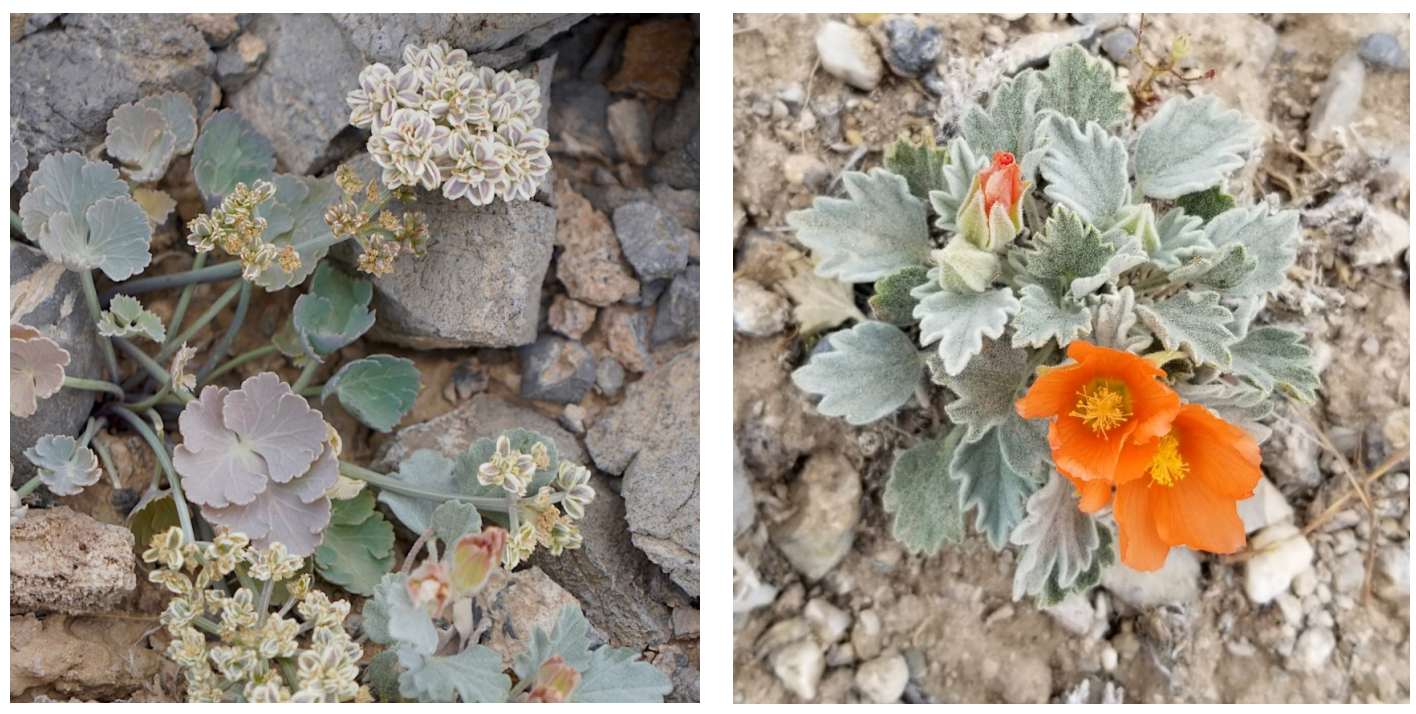
The inaptly named Cymopterus basalticus (it usually occurs on dolomite); and Sphaeralcea caespitosa.