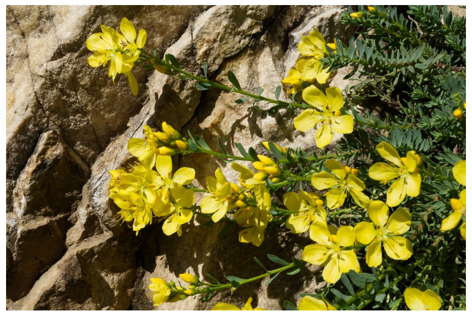
Linum kingii is one of the special treats of the hike to Catherine Pass.