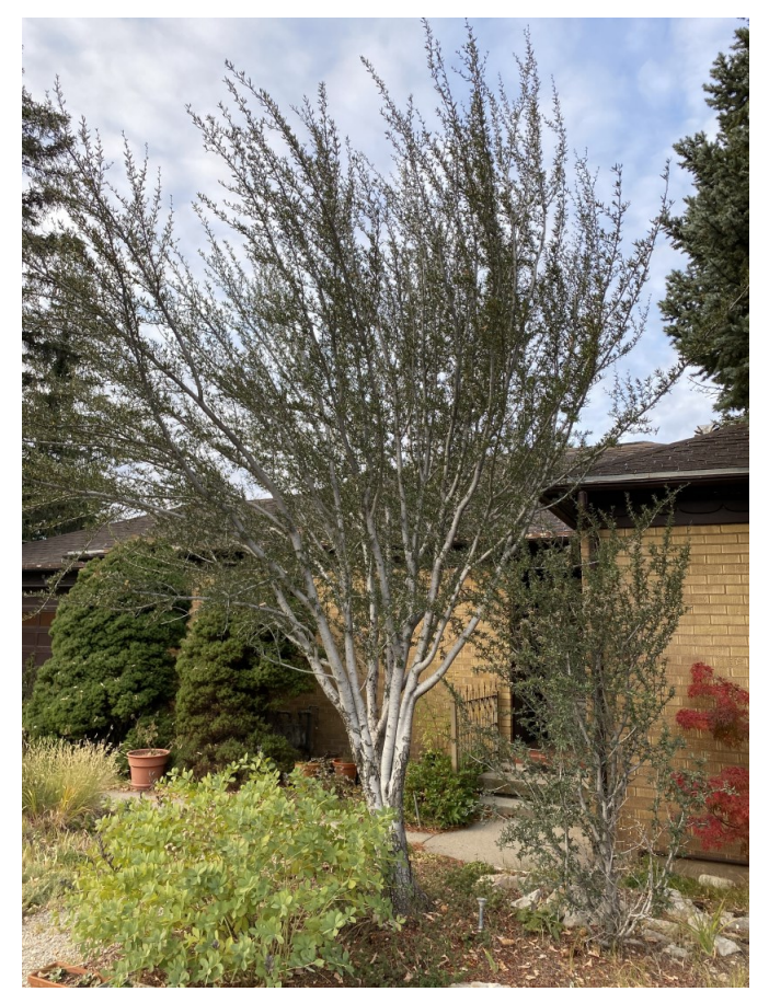
Cercocarpus ledifolius in the garden of Bill and Cathy King.

Every garden, including a native garden, needs trees and shrubs to give structure and definition. Cercocarpus ledifolius , commonly known as curl-leaf mountain mahogany, fits the description of either tree or shrub growing from typically 3 to 15 feet tall, like a shrub, but can get as tall as 35 feet, like a tree. And it is a handsome addition to your native garden that really represents the flora of the West.