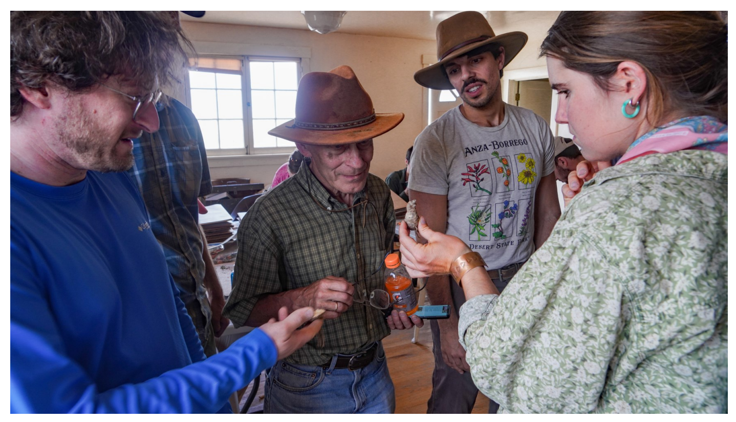
Foray participants marveling at a Micropuntia tuber.

discussion. An Eriocoma hybrid was first identified as E. x bloomeri , but that would require a parent of E. occidental- is , which is not present near the DER. We settled on a