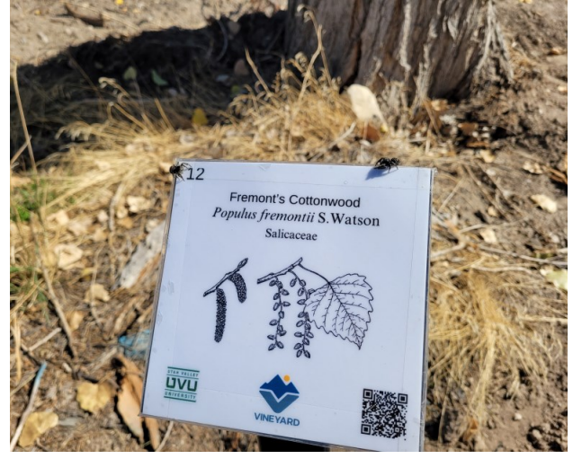
Walking trail signage.