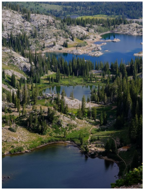
North View from Sunset Peak - view from Sunset peak down into Brighton.