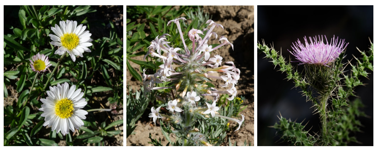
Erigeron leiomerus - how much more perfect a daisy do you want? Ipomopsis tenuituba is now its own species instead of a variety of I. aggregata. Cirsium eatonii is a beautiful, well-armed, high elevation thistle.