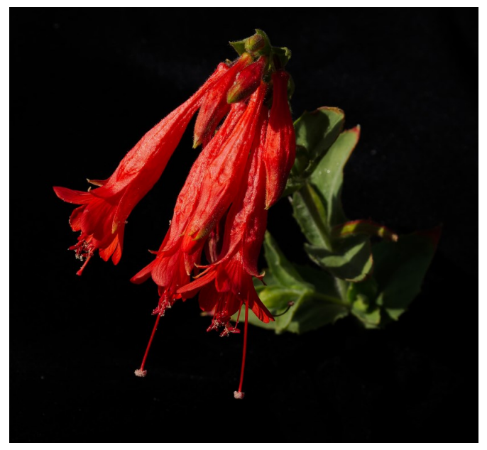
Epilobium canum ssp garrettii - A group of these plants just off the trail creates a hummingbird battleground!