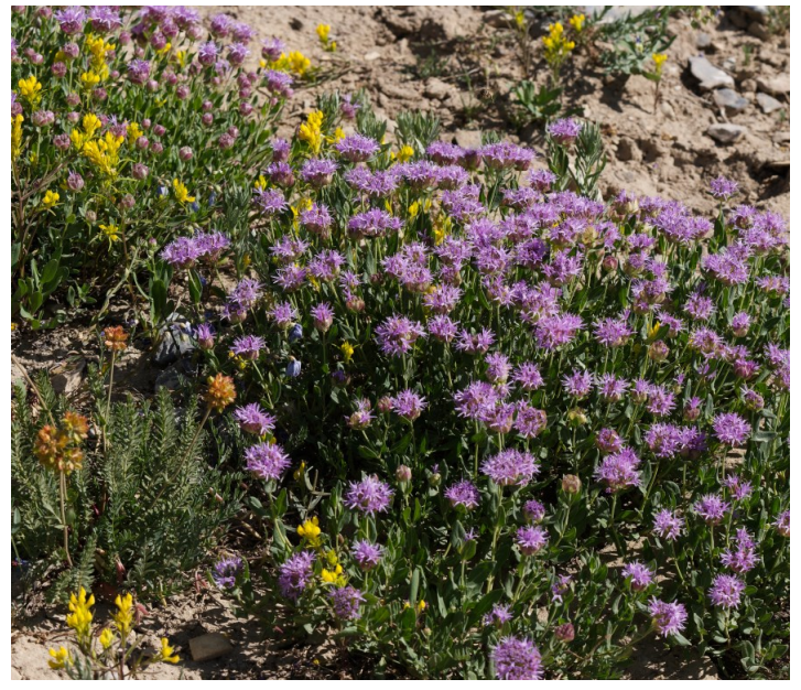
This combination is a friendly grouping of Monardella , Orthocarpus , and Ivesia .