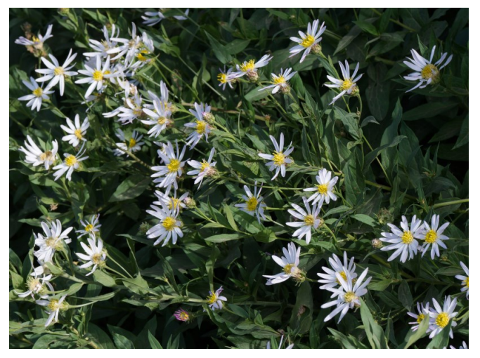
Euchephalus engelmannii is a tall plant commonly leaning over the trail.