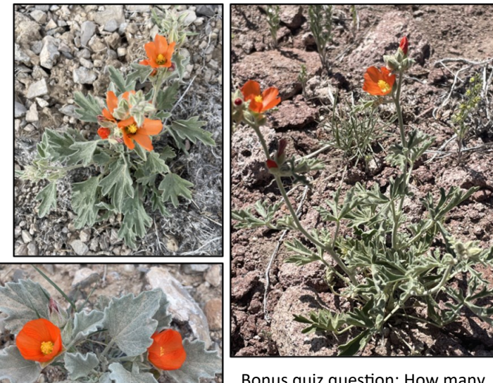
Bonus quiz question: How many Sphaeralcea taxa are represented in the three observations above from the DER? (We don't know the answer...)