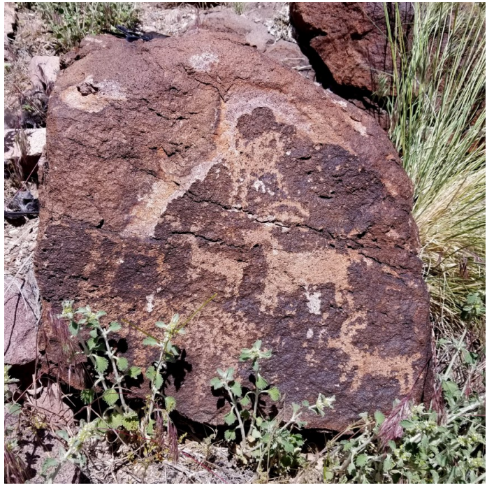
Terraria haydenii, discovered in 2021; petroglyphs at the DER