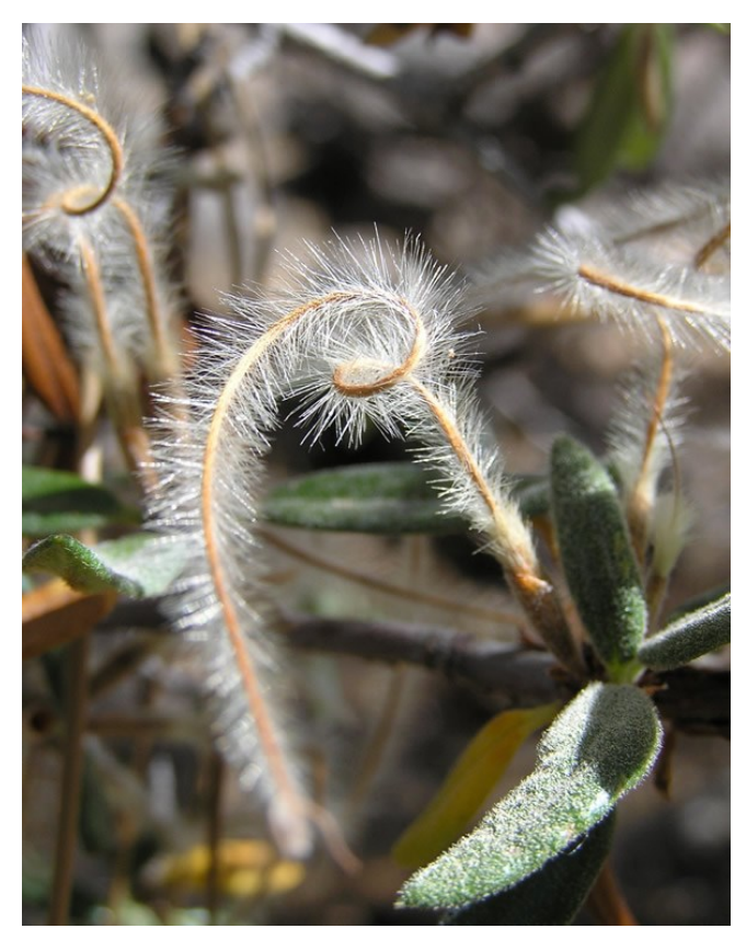
The curious twisting, feathered tail of a Cercocarpus ledifolius seed.

covering the tree in curly seedheads that have a clever corkscrew shape that are designed to drill themselves into the ground wherever they might land after being carried off by the wind. Mountain mahogany doesn't cause a problem with self-sowing, though, as any unwanted seedlings are easily removed.