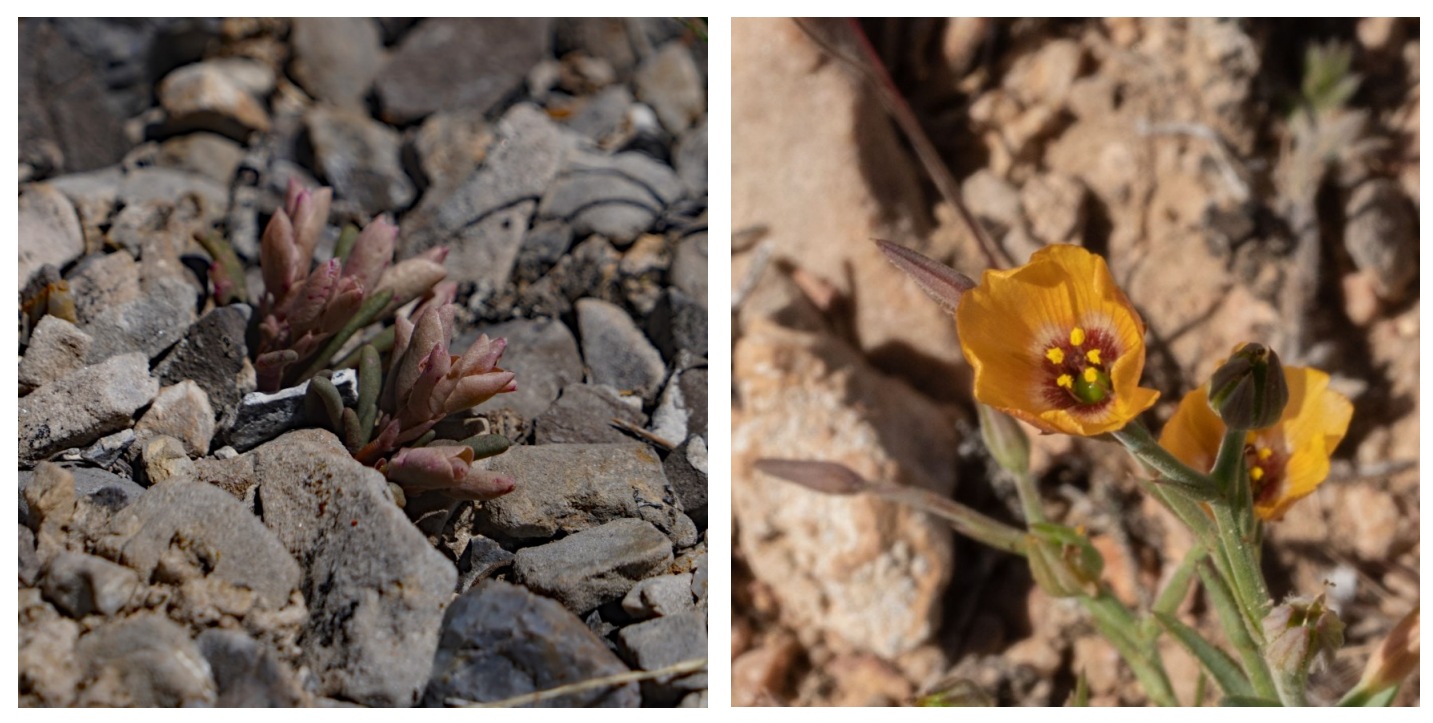
Lewisia maguirei, a new record for Utah; and Linum puberulum, a new record for Millard Co.

participant spotted Lewisia maguirei , previously unrecorded from Utah! This species grows on rocky slopes at high elevation and was previously only known from Nevada. We also recorded two probable new county