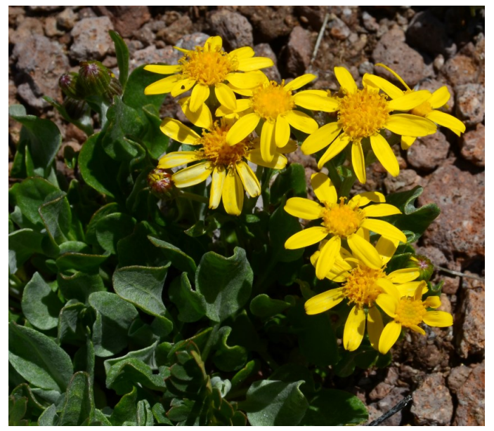
Packera werneriifolia is a charming, low growing, high elevation plant. There is a species of Packera just about everywhere in the US and Canada.