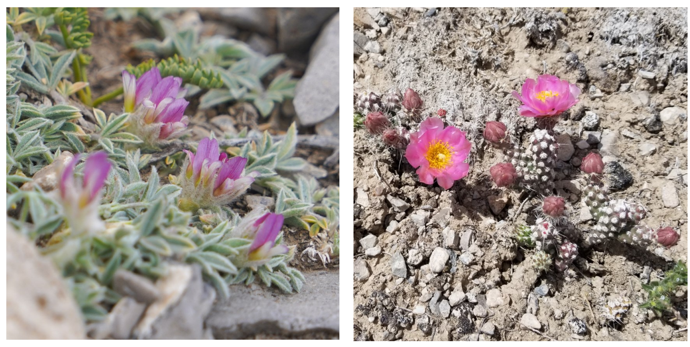
Trifolium friscanum , endemic to four mountain ranges in Beaver and Millard Counties; and Micropuntia pulchella , a geophytic, "deciduous" cactus.

iNaturalist, comprising 200 plant species. Check out our iNaturalist project here: <u>https://www.inaturalist.org/</u><u>projects/intermountain-botanical-foray-2023-desert-</u><u>experimental-range</u>.