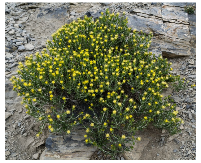
Ericameria discoidea is a shrub with a wonderful combination of copious yellow flowers with hairy white stems and dark green leaves.