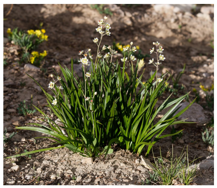
Anticlea elegans is aptly named as "elegant." But beware - all parts of this plant are poisonous!

Albion Basin at the top of Little Cottonwood Canyon has become a very popular destination for wildflower seekers in July through August. Since the majority of visitors hike up to Cecret Lake, a real treat with a bit more solitude is the hike to Catherine Pass and up the ridgeline to Sunset Peak. You'll pass through at least half a dozen habitats, with the reward of a stunning view from the top of Sunset Peak. Along the way it's not at all difficult to see 50+ species of wildflowers. This baker's dozen of photos will provide you a sampling of what you might see.