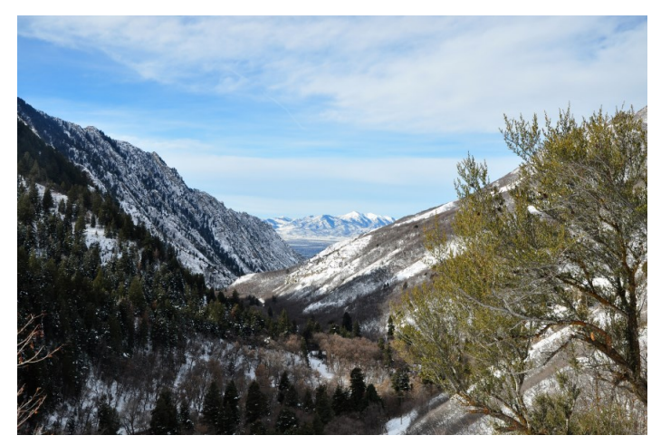
Cercocarpus ledifolius at right grows naturally in the Wasatch Canyons. It is widespread in the American West from Washington to California, west to Wyoming, Arizona, and New Mexico.

The narrow dark green, leathery leaves are evergreen