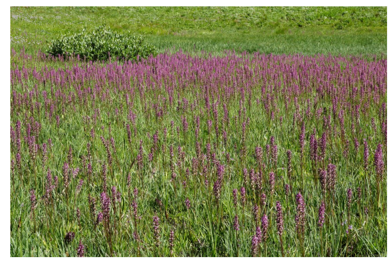
A sea of Pedicularis groenlandica in the wet meadow halfway up the trail