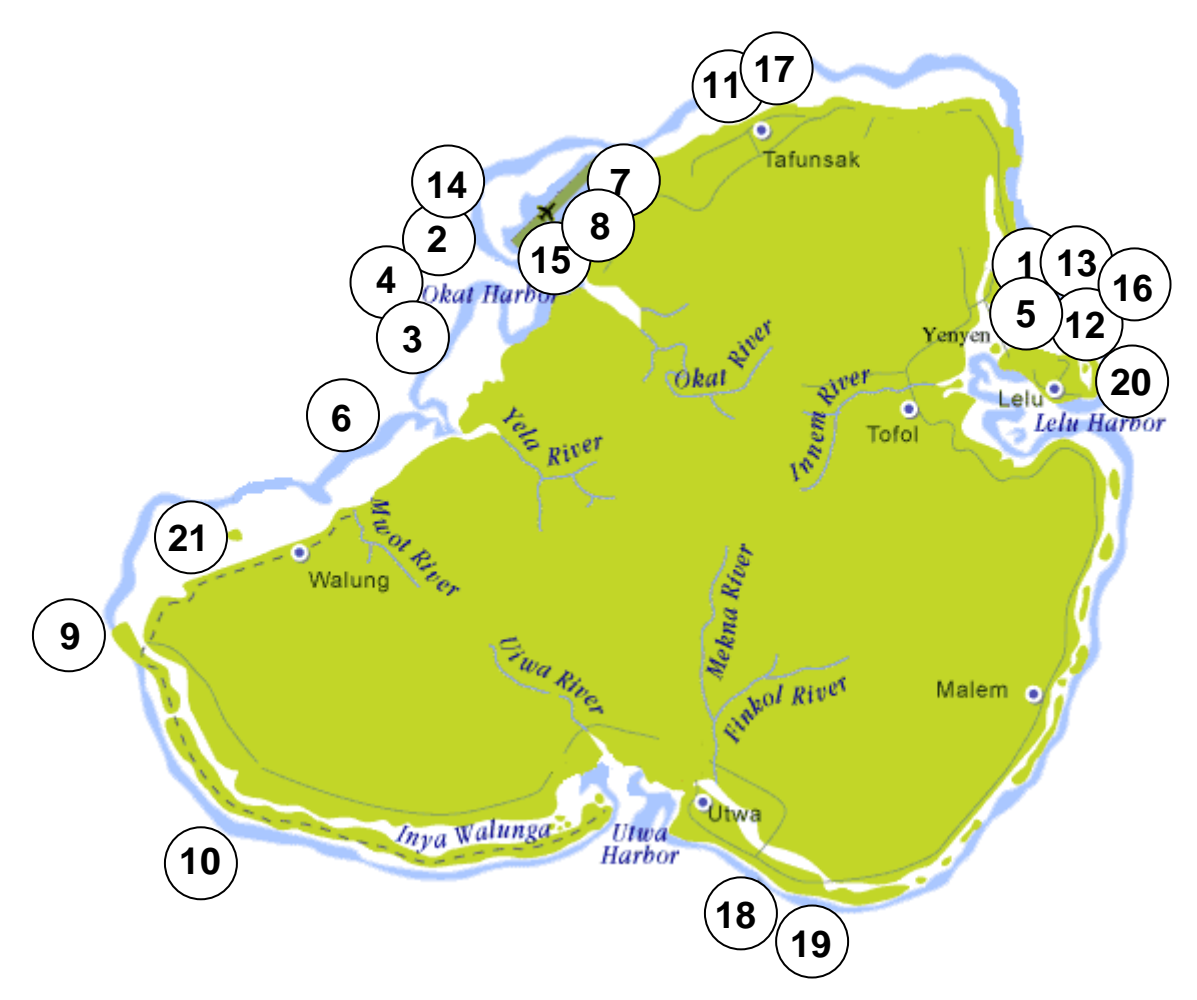
Figure 1. Survey sites around Kosrae. Sites are numbered according the table in Appendix 2.