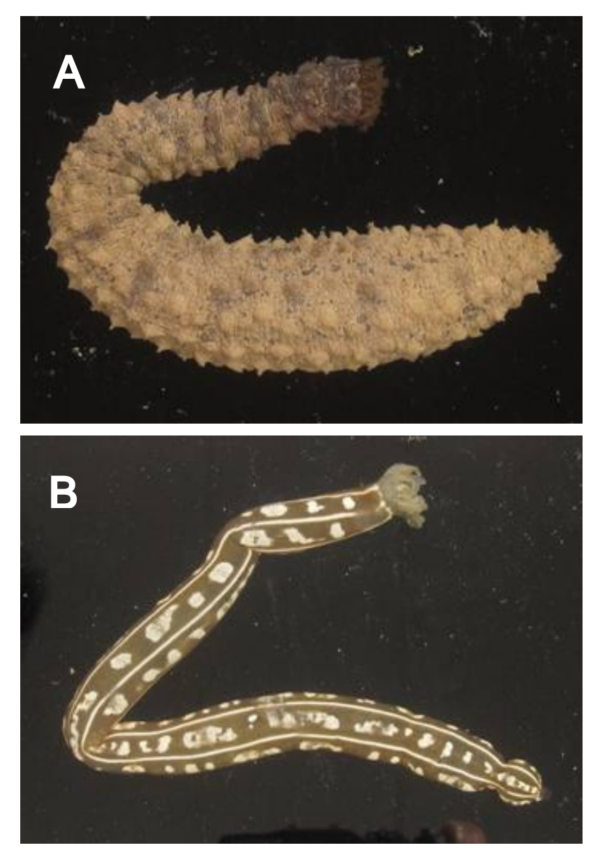
Figure 3. Some undescribed species of holothuroids found on Chuuk. A) Holothuria ( Thymiosycia ) sp. cf. impatiens and B) an unidentified synaptid, cf. Synaptula sp.

Chuuk has very few commercially valuable species of holothuroids. We observed populations of some desirable commercial species, occurring at most of the sites we visited around the island. While most of these species are not the most valuable varieties or remain in great abundance, they, nevertheless, constitute an important and valuable resource for the island.