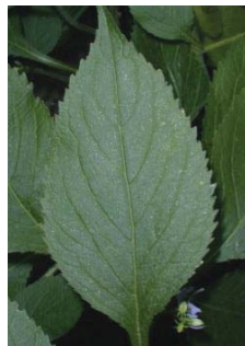
Campanulastrum americanum CAMPANULACEAE American Bellflower N, [p. 10]

Habitat: Woodland, Blooming Period: Mid-Summer to early Fall lasting 1½ months.