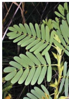
Chamaecrista fasciculata FABACEAE Partridge Pea N , [p. 12]

Habitat: Prairie, Blooming Period: Quite long, from mid-Summer to Fall.