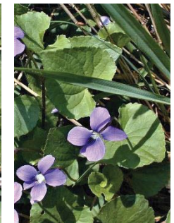
Viola pratincola VIOLACEAE Common Blue Violet N, [p. 30]

Habitat: Prairie, Blooming Period: Mid- to late Spring lasting 1-1½ months.