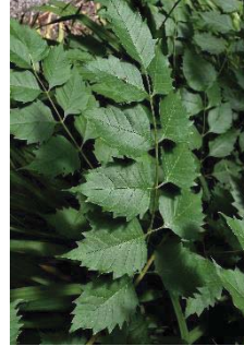
Campsis radicans BIGNONIACEAE Trumpet Creeper N, [p. 11]

Habitat: Woodland, Blooming Period: Summer lasting about 2 months.