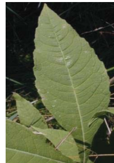
Verbesina alternifolia ( Actinomeris a. ) ASTERACEAE Wingstem N , [p. 29]

Habitat: Savanna, Blooming Period: Late Summer to early Fall lasting about 1-1½ months.