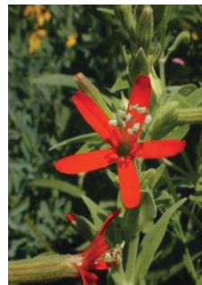
Silene regia CARYOPHYLLACEAE Royal Catchfly NI, [p. 27]

Habitat: Prairie, Blooming Period: Mid- to late Summer lasting about one month.