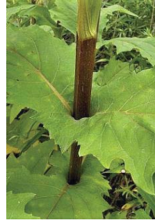
Silphium perfoliatum ASTERACEAE Cup Plant N , [p. 27]

Habitat: Prairie, Blooming Period: Early to mid-Summer lasting about 1-1½ months.