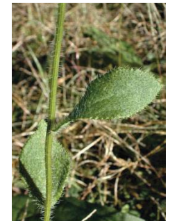
Rudbeckia hirta ASTERACEAE Black-Eyed Susan N, [p. 25]

Habitat: Prairie, Blooming Period: Early to late Summer lasting about one month.