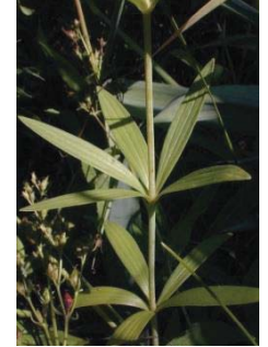
Lilium michiganense LILIACEAE Michigan Lily N, [p. 31]

Habitat: Prairie, Blooming Period: Early to mid-Summer lasting about one month.