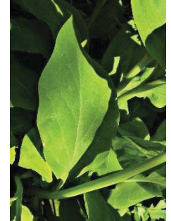
Mertensia virginica CAMPANULACEAE Virginia Bluebells N, [p. 21]

Habitat: Woodland, Blooming Period: Mid- to late Spring lasting about 3 weeks.