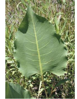
Silphium terebinthinaceum ASTERACEAE Prairie Dock N , [p. 27]

Habitat: Prairie, Blooming Period: Late Summer to early Fall lasting about one month.