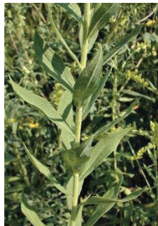
Solidago altissima ASTERACEAE Tall Goldenrod N , [p. 27]

Habitat: Prairie, Blooming Period: Late Summer to Fall individual plants bloom about 3 weeks.