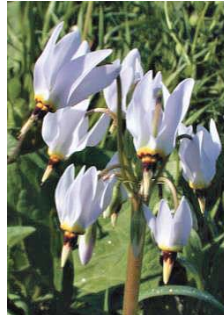
Dodecatheon meadia PRIMULACEAE Shooting Star N, [p. 14]

Habitat: Prairie, Blooming Period: Late Spring lasting about one month.