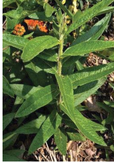
Asclepias tuberosa APOCYNACEAE Butterfly Milkweed N, [p. 8]

Habitat: Prairie, Savanna and open rocky Woodland. Blooming Period: Early to mid-Summer.