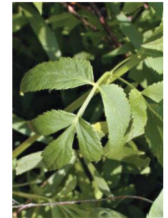
Zizia aurea APIACEAE Golden Alexanders N , [p. 30]

Habitat: Prairie, Blooming Period: Late Spring to early Summer lasting about one month.