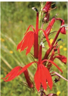
Lobelia cardinalis CAMPANULACEAE Cardinal Flower N, [p. 20]

Habitat: Wetland, Blooming Period: Late Summer to early Fall lasting about 1-1½ months.