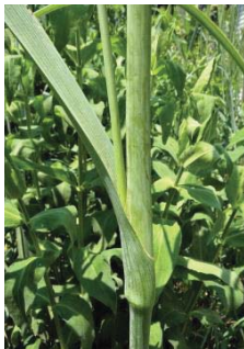
Tradescantia ohiensis COMMELINACEAE Ohio Spiderwort N, [p. 29]

Habitat: Prairie, Blooming Period: Late Spring to mid-Summer lasting about 1½ months.