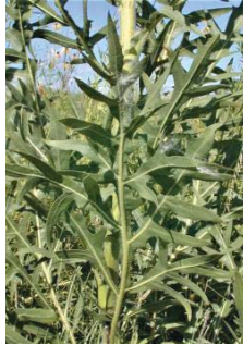
Silphium laciniatum ASTERACEAE Compass Plant N , [p. 27]

Habitat: Prairie, Blooming Period: Mid-Summer lasting about 1½ months.