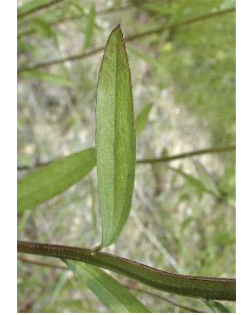
Eryngium yuccifolium APIACEAE Rattlesnake Master N, [1] p. 15