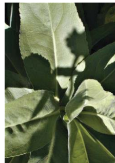
Oligoneuron rigidum (Solidago rigida) ASTERACEAE Stiff Goldenrod N, [p. 21]

Habitat: Prairie, Blooming Period: Late Summer to Fall lasting about one month.