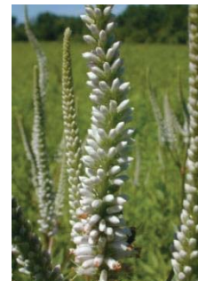
Veronicastrum virginicum SCROPHULARIACEAE Culver's Root N, [p. 30]

Habitat: Prairie, Blooming Period: Early to mid-Summer lasting about one month.