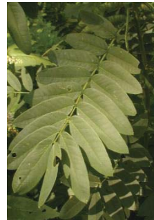
Senna marilandica ( Cassia marilandica ) FABACEAE Maryland Senna N , [p. 27]

Habitat: Savanna, Blooming Period: Mid- to late Summer lasting about 3-4 weeks.