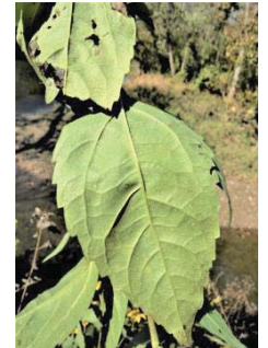
Heliopsis helianthoides ASTERACEAE False Sunflower N, [p. 17]

Habitat: Prairie, Blooming Period: Early Summer to early Fall lasting about one month.