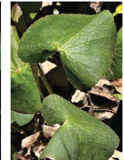
Caltha palustris RANUNCULACEAE Marsh Marigold N , [1] p. 10

Habitat: Wetlands, Blooming Period: Mid-Spring lasting about one month.