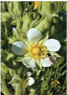
Drymocallis arguta (Potentilla arguta) ROSACEAE Prairie Cinquefoil N, [p. 24]

Habitat: Prairie, Blooming Period: Mid-Summer lasting about one month.