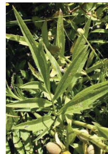
Ratibida pinnata ASTERACEAE Yellow Headed Coneflower N, [p. 25]

Habitat: Prairie, Blooming Period: Early to late Summer lasting about 1-2 months.