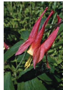
Aquilegia canadensis RANUNCULACEAE Wild Columbine N, [p. 8]

Habitat: Wetland, Blooming Period: Late Spring to early Summer lasting about one month.