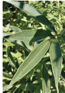
Coreopsis tripteris ASTERACEAE Tall Coreopsis N, [p. 13]

Habitat: Prairie, Blooming Period: Mid-Summer to early Fall lasting about one month.