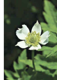
Anemone virginiana RANUNCULACEAE Tall Anemone N, [p. 8]

Habitat: Prairie, Savanna and Woodland Blooming Period: Early Summer.