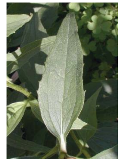
Echinacea purpurea ASTERACEAE Purple Coneflower N, [p. 15]

Habitat: Prairie, Blooming Period: Mid- Summer lasting about one month.