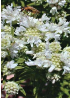
Pycnanthemum virginianum LAMIACEAE Common Mountain Mint N, [p. 24]

Habitat: Prairie, Blooming Period: Mid-Summer lasting about one month.