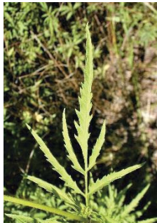
Bidens polylepis ASTERACEAE Tickseed Sunflower N, [p. 9]

Habitat: Prairie and Seeps, Blooming Period: Late Summer to early Fall lasting about 1-2 months.