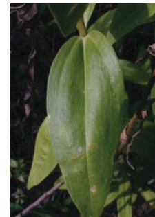
Gentiana andrewsii GENTIANACEAE Bottle Gentian N, [p. 17]

Habitat: Prairie, Blooming Period: Late Summer to early Fall lasting one month.