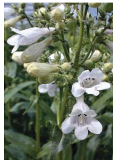
Penstemon digitalis SCROPHULARIACEAE Foxglove Penstemon N, [p. 22]

Habitat: Prairie, Blooming Period: Late Spring lasting about one month