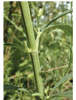
Salvia azurea var. grandiflora LAMIACEAE Wild Blue Sage N, [p. 26]

Habitat: Prairie, Blooming Period: Late Summer and Fall lasting about 1-2 months.