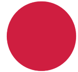
USAID Red Pantone® 200 CMYK: 3-100-70-12 HEX: #BA0C2F RGB: 186-12-47