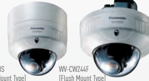
WV-CW240S (Surface Mount Type)

WV-CW500S (220-240 V AC) WV-CW504S (24 V AC or 12 V DC) WV-CW504F (24 V AC or 12 V DC)