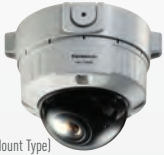
(Surface Mount Type)

WV-CW500S (220-240 V AC) WV-CW504S (24 V AC or 12 V DC) WV-CW504F (24 V AC or 12 V DC)