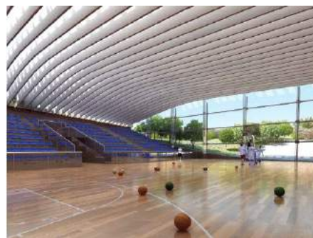
Indoor view of the upcoming Sport Complex

For more information and contacts, check usek.edu.lb .