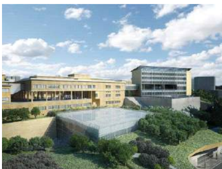
Outdoor view of the upcoming Sport Complex

To complete the picture, the new Sport complex will be built according to the highest sustainable environmental standards, including being powered completely by renewable energy. This will house the University's student sports programs - mini-football, basketball and tennis - under one roof, with facilities including training grounds, sports medicine, and offices for coaches and staff. The complex will also function as a cultural space for USEK community, housing activities such as concerts and giving students a vibrant meeting point.