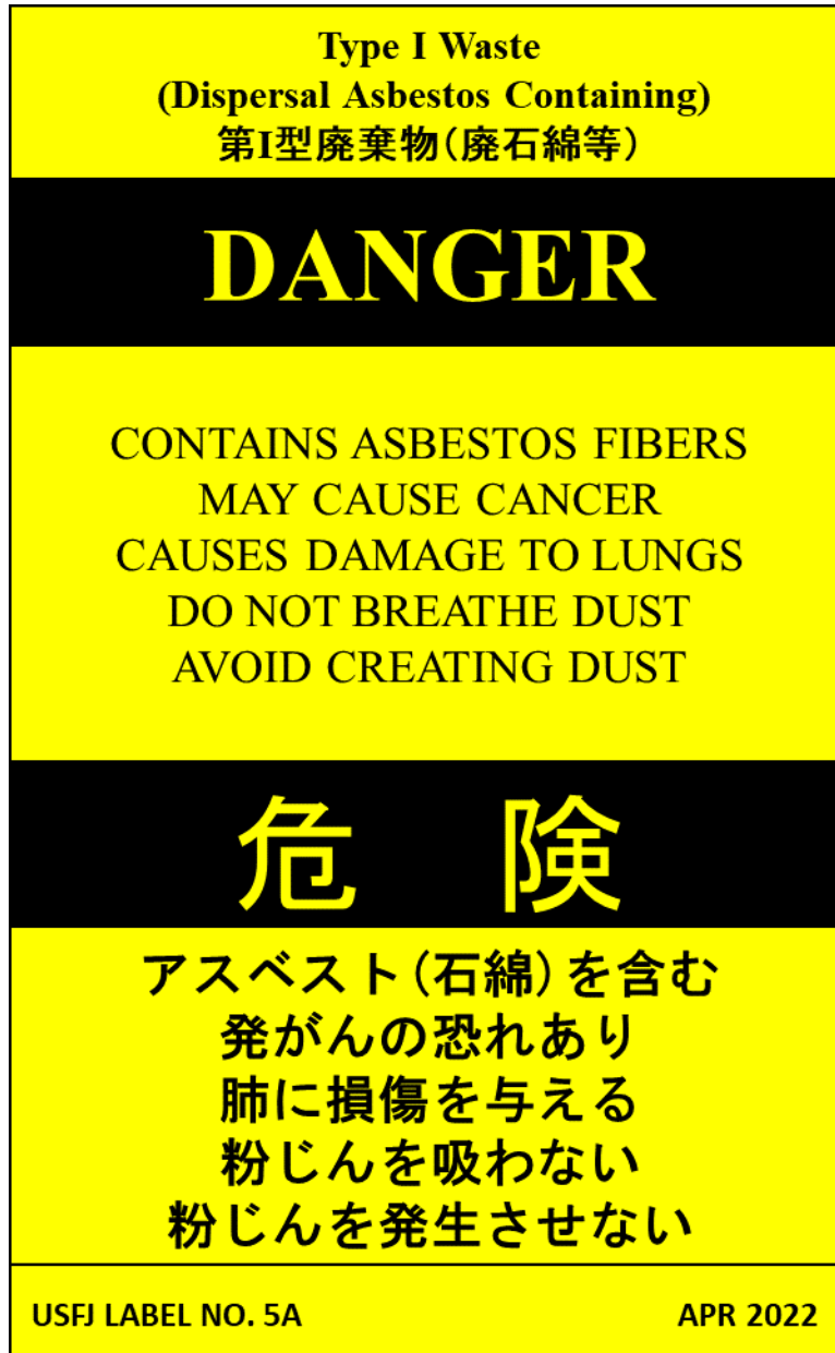
Figure 5.2: Type I ACM Waste Label