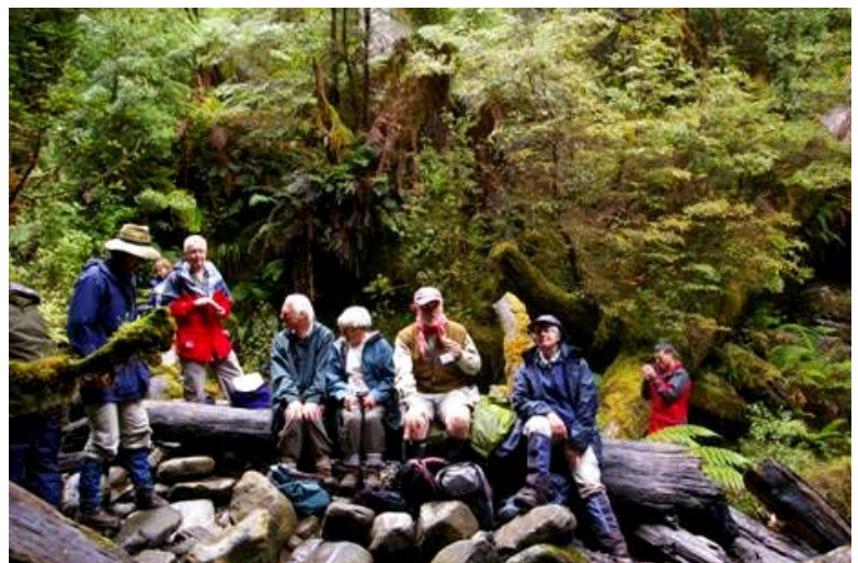
Lunchtime at the Swallet. The entrance to one of the deepest limestone cave systems in Australia – 375m deep.