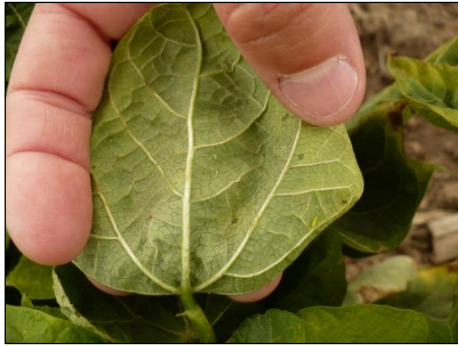
Image 1. Potato leafhoppers on heirloom dry beans, Alburgh, VT.

Hopperburn is not present until 5-7 days after leafhopper feeding has occurred. The first sign is yellowing of the leaf at the tip followed by necrosis and leaf curling. These symptoms are the result of the plant shutting down photosynthesis in the leaf in response to leafhopper feeding. As this pest weakens a plant, it becomes more vulnerable to disease. All varieties had varying degrees of potato leafhopper damage (Figure 1). The dry bean variety Lowe’s Champion had the lowest amount of potato leafhopper damage (10.8%).