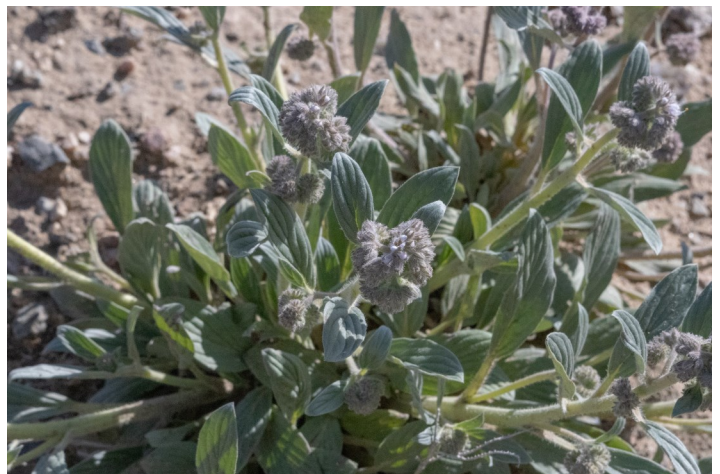
Silverleaf phacelia / Phacelia hastata