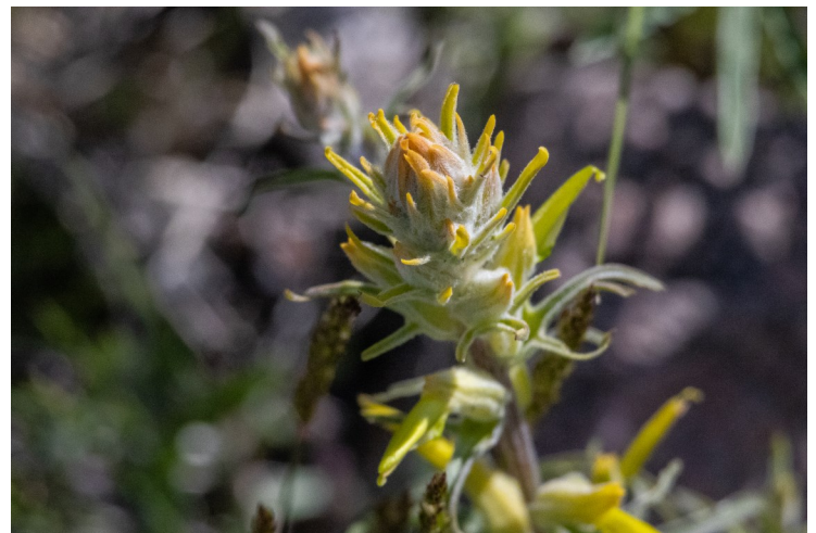
Yellow Indian paintbrush / Castilleja flava