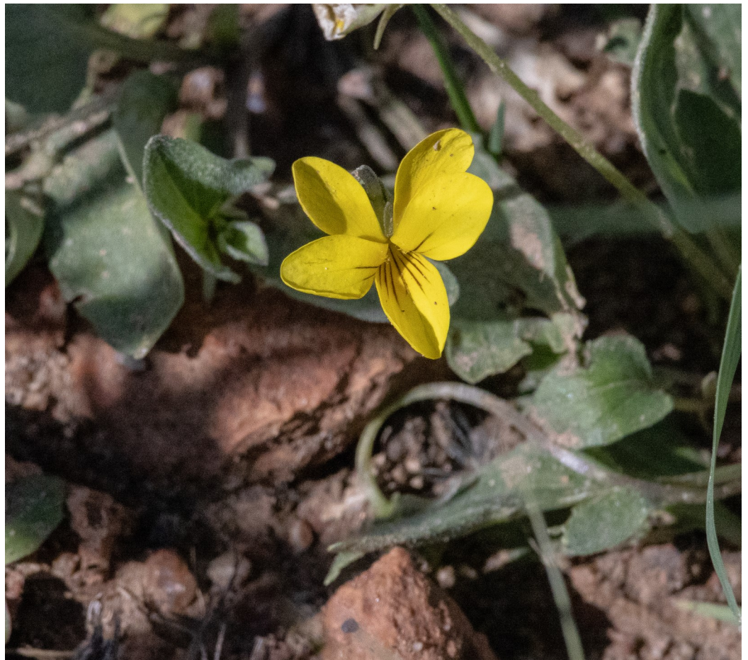
Nuttall's violet / Viola nuttallii