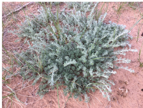
Fringed Sage / Artemisia frigida