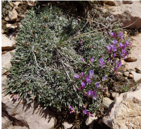
Tufted milkvetch / Astragalus spatulatus