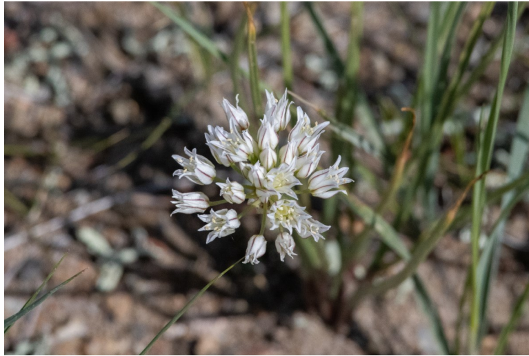
Textile onion / Allium Textile