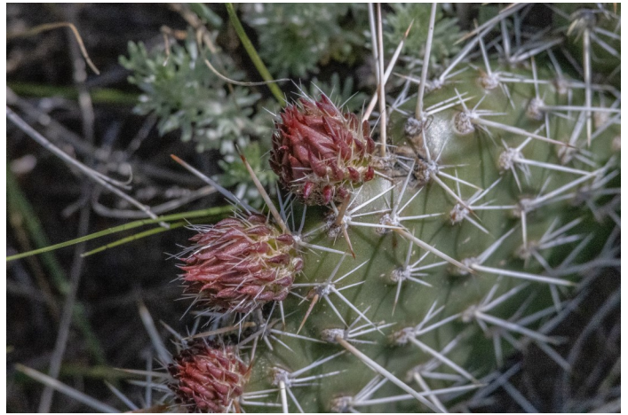
Prickly pear / Opuntia