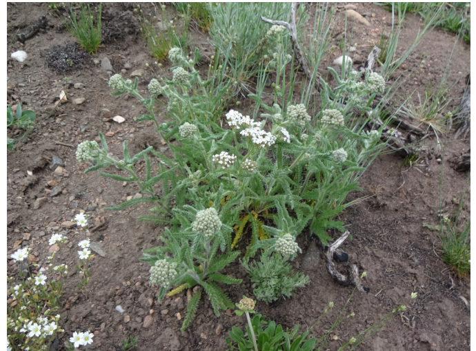
Yarrow / Achillea millefolium