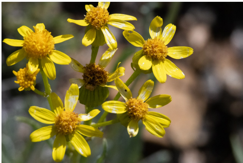
Lambstounge ragwort / Senecio integerrimus