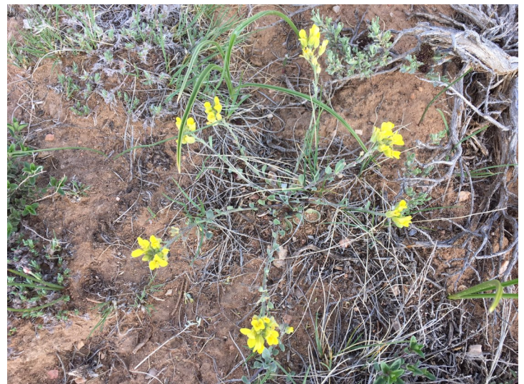
Foothill bladderpod / Physaria ludoviciana