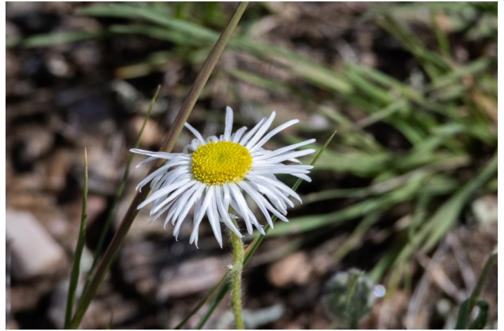
Fleabane / Erigeron