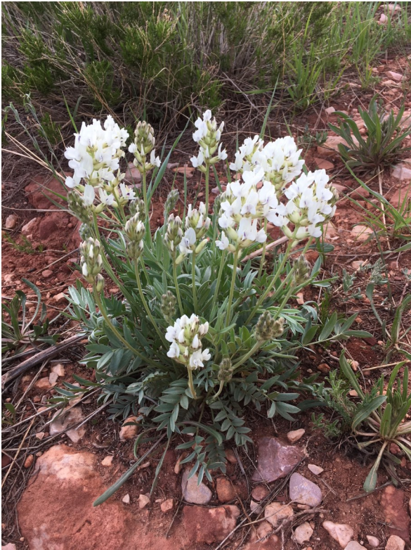
White locoweed / Oxytropis sericea