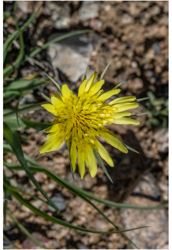
Yellow salsify / Tragopogon dubius