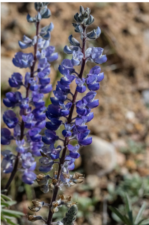
Silvery lupine / Lupinus argenteus