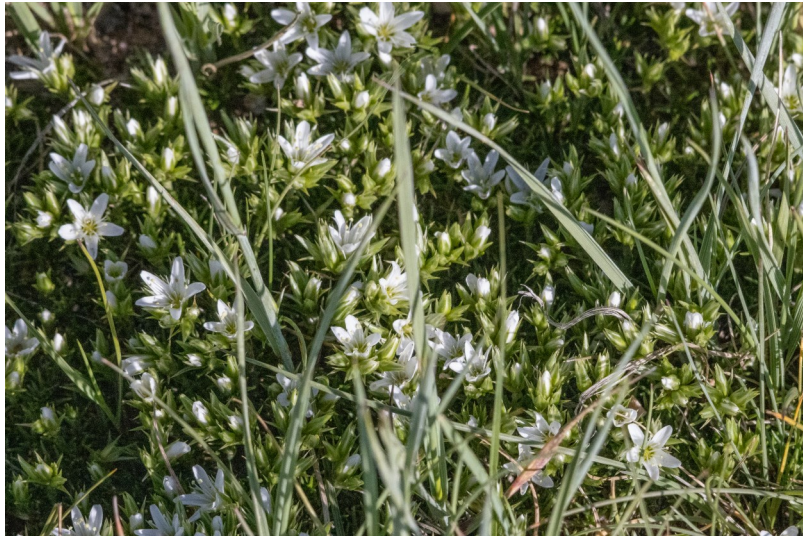
Hooker's desert sandwort / Eremogone hookeri