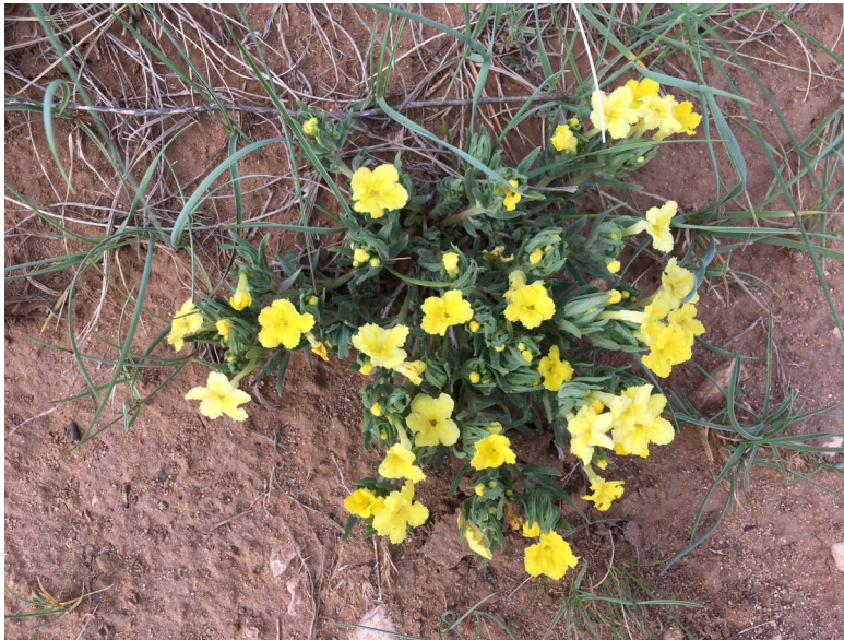
Narrowleaf stonecrop / Lithospermum incisum