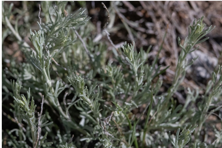
Three – tip sagebrush / Artemisia tripartida