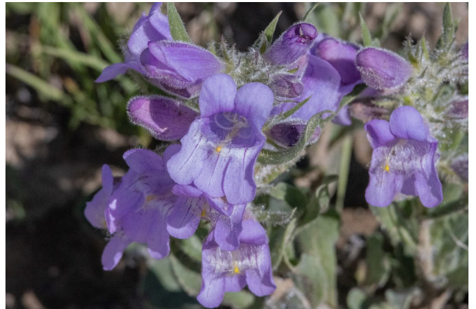
Fuzzytongue penstemon / Penstemon eriantherus