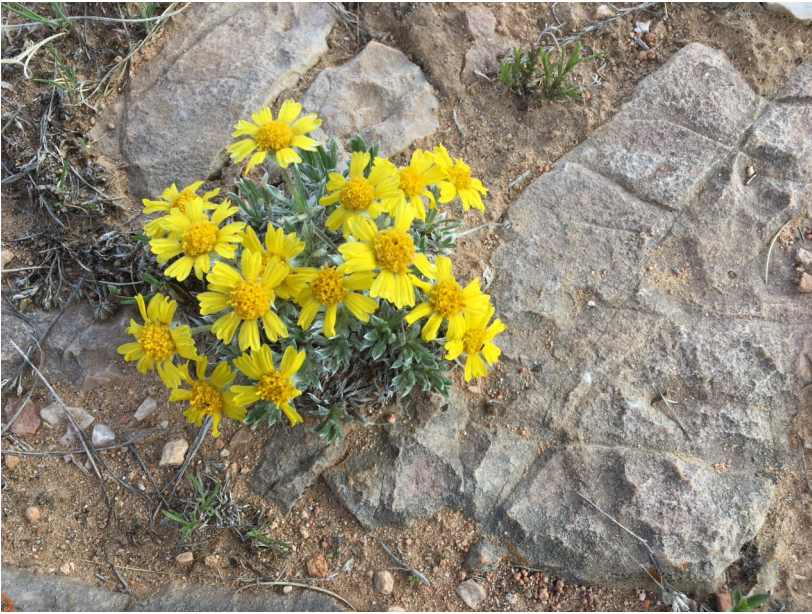
Four—nerve daisy / Tetranneuris acaulis