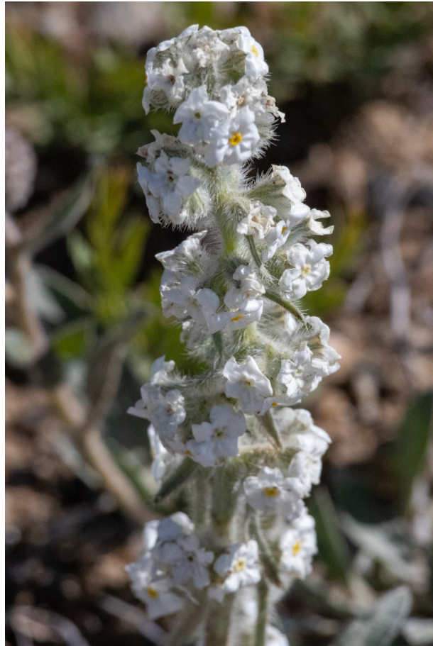
Miner's candle / Cryptantha virgata