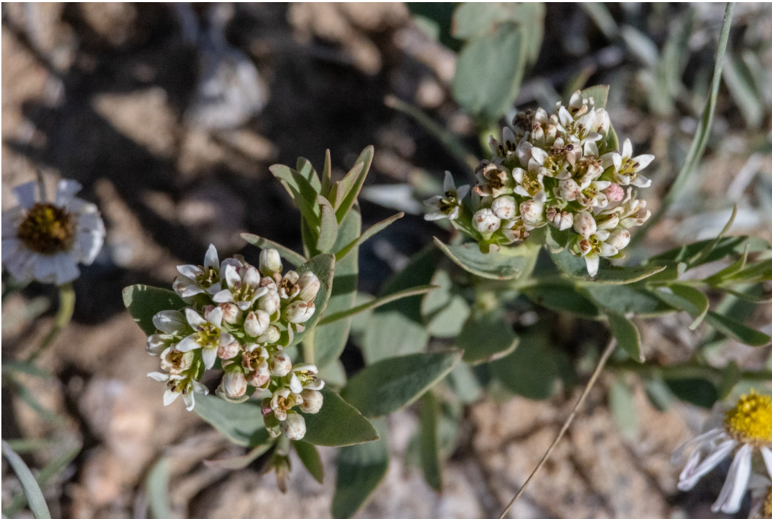
Pale bastard toadflax / Comandra umbellata