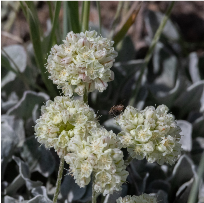
Cushion buckwheat / Eriogonum ovalifolium