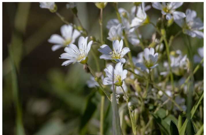
Chickweed / Cerastium