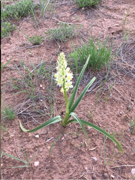
Meadow deathcamas / Zigadenus venenosus