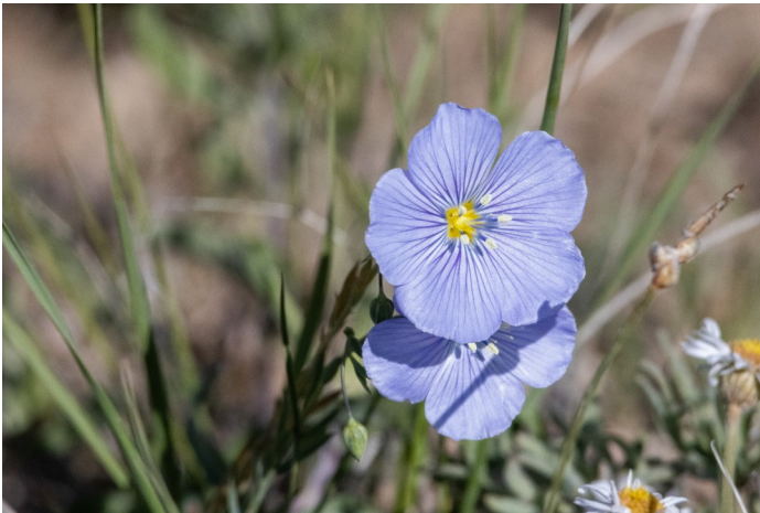
Lewis flax / Linum lewisii