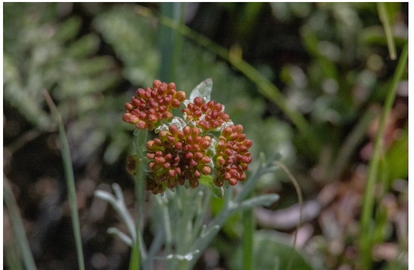
Sulphur—flower buckwheat / Eriogonum umbellatum