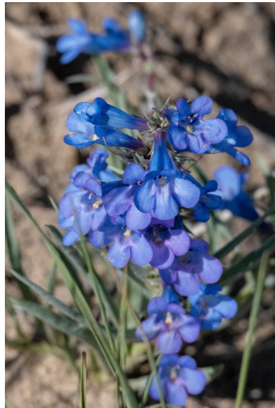
Narrow—leaf beardtongue / Penstemon angustifolius