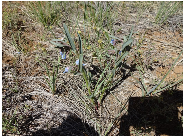
Prairie bluebells / Mertensia lanceolata