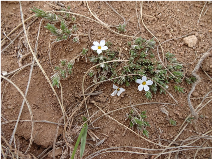
Spiny phlox (Hood's phlox) / Phlox hoodii