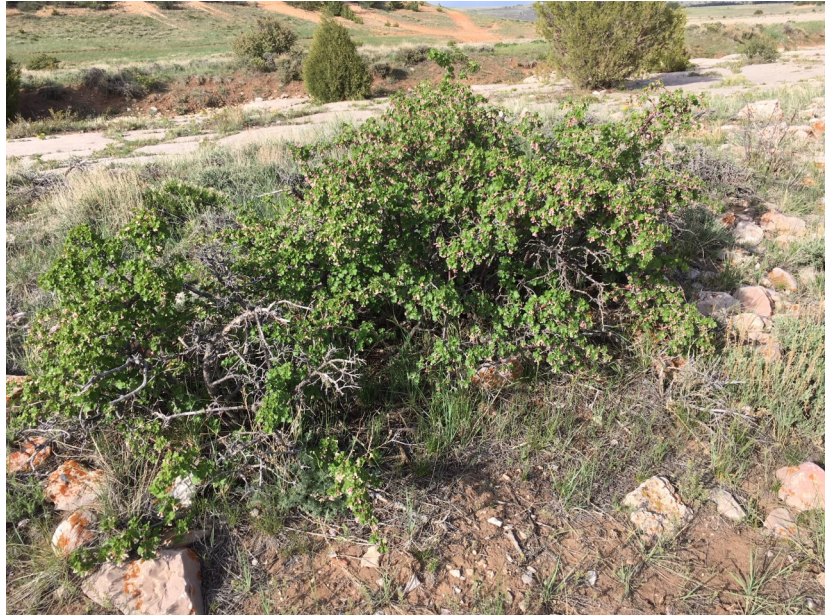
Wax currant / Ribes cereum