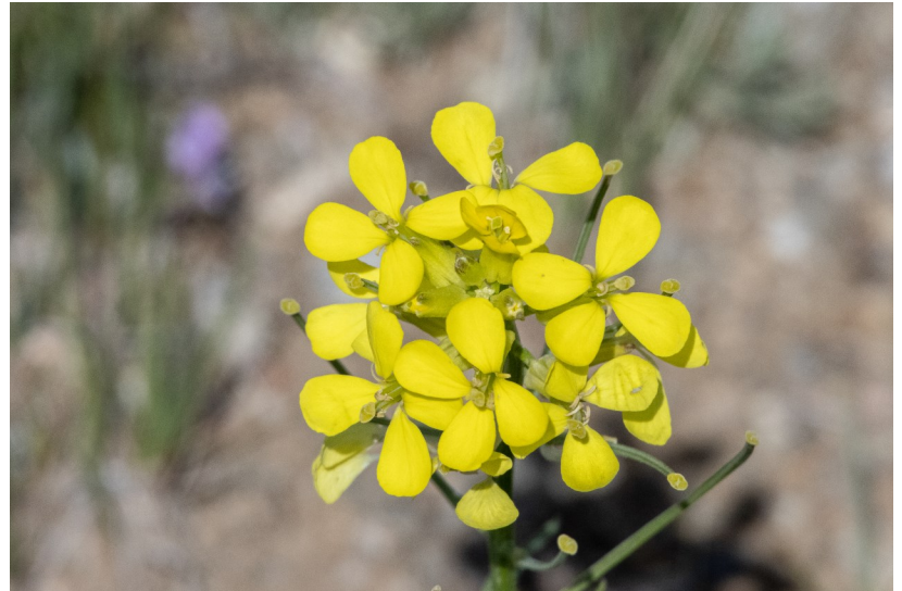
Western wallflower / Erysimum asperum