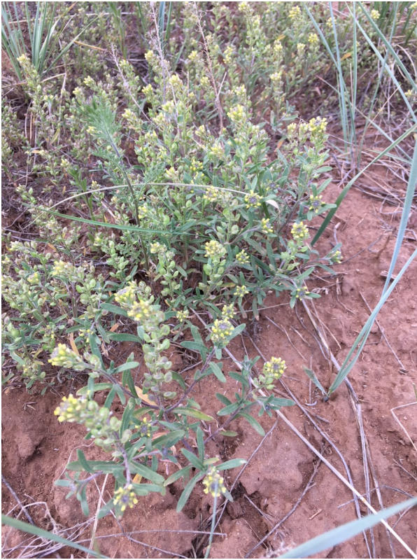
Desert madwort / Alyssum desertorum