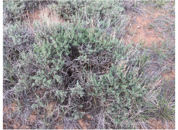
Wyoming Big Sagebrush / Artemisia tridentata