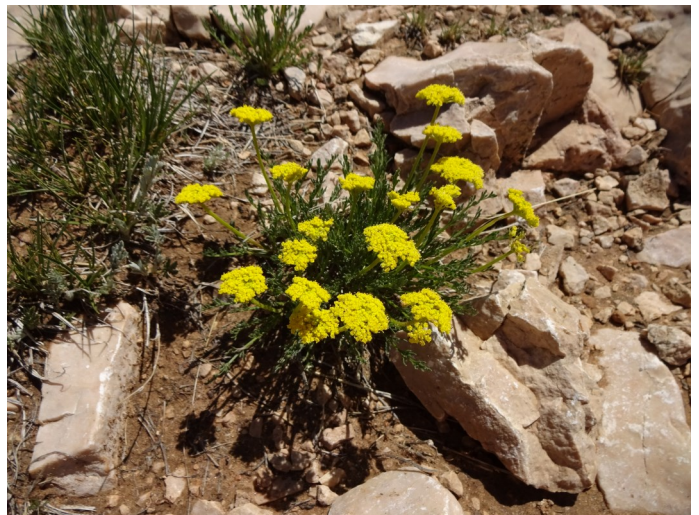
Slender Wild Parsley / Musineon tenuifolium