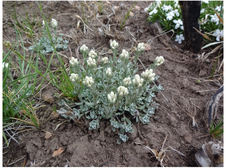
Little leaf pusseytoes / Antennaria microphylla