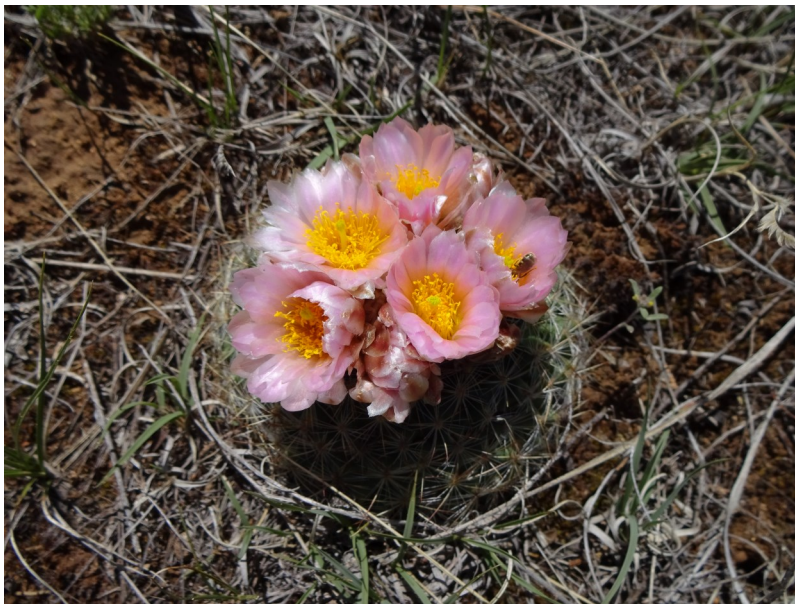
Mountain ball cactus / Pediocactus simpsonii