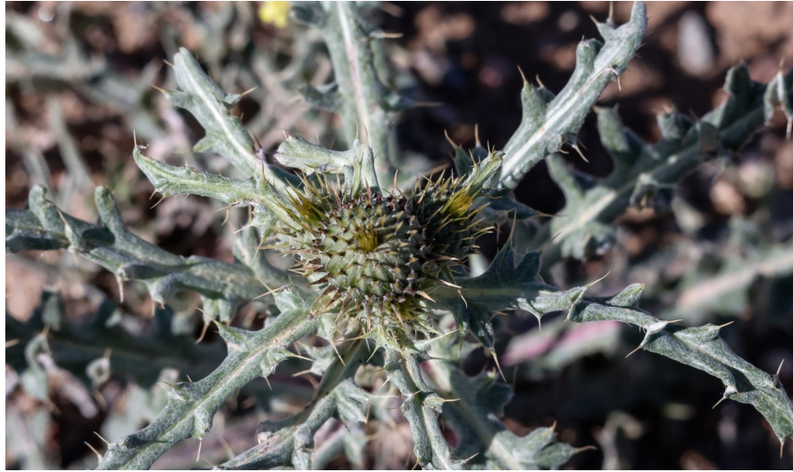
Wavy—leaf thistle / Cirsium undulatum