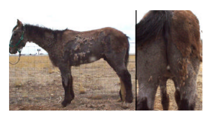
Pemphigus in a young horse with "sudden onset." The horse has severe diffuse crusting dermatitis of the trunk and proximal aspects of the limbs. The horse had clinical signs suggestive of laminitis.