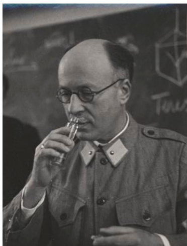
Leopold Ruzicka researched odorous substances and hormones, and served in the Swiss Army in the Second World War.