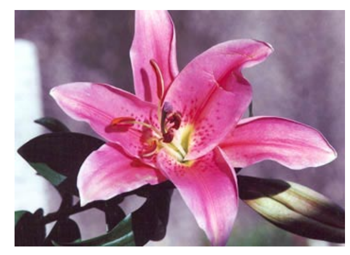
"Stargazer" Lily - Not Hardy in Zone 2.