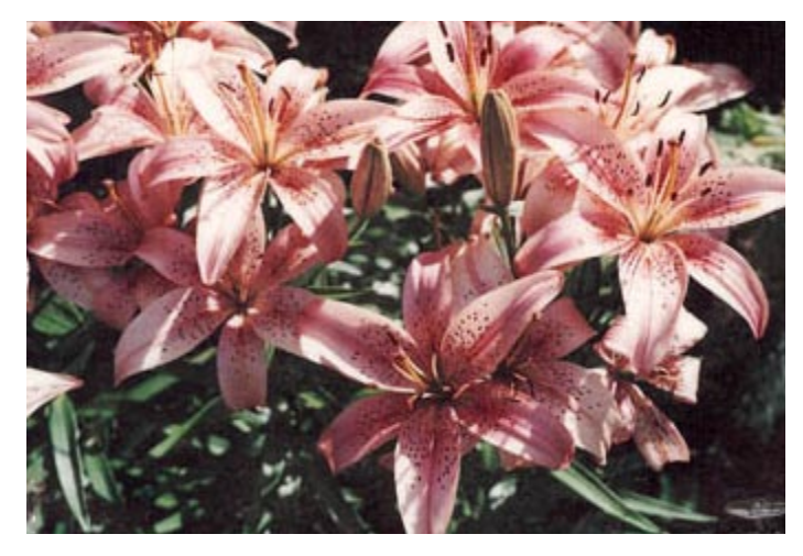
"Wanda" Lily - Asiatic, upfacing