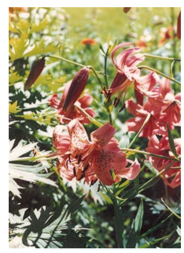
Asiatic Lily "Embarassment"