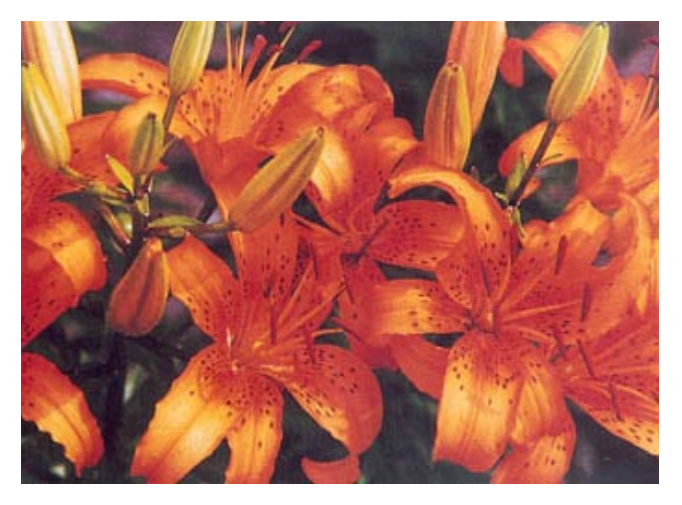
Upfacing Orange "Tiger" Lily