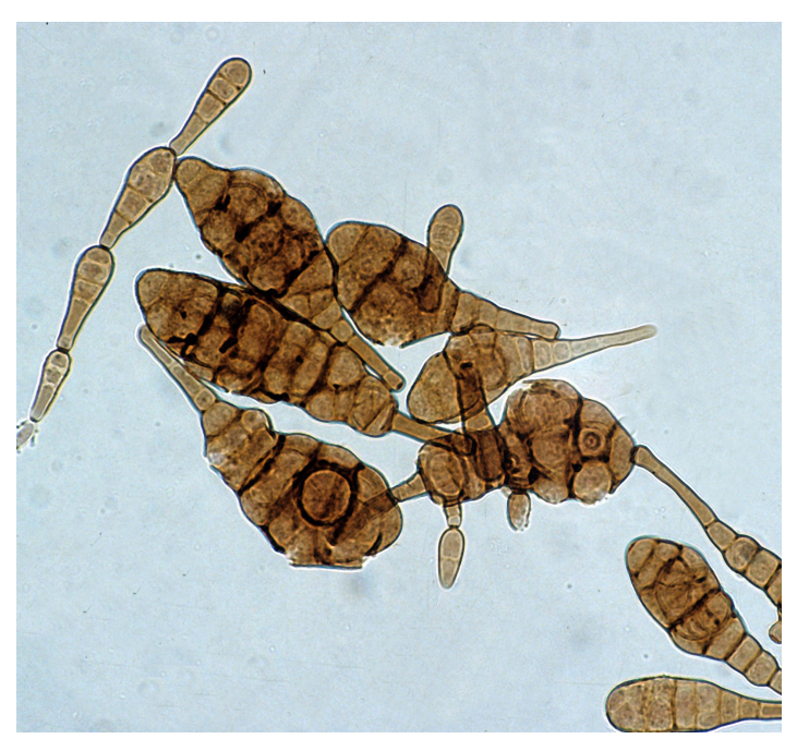
Fig. 2. Alternaria leaf spot on kangaroo paw (above) and typical spores of Alternaria species (below).

seedlings, causing damping-off, stem lesions, or collar rot. The fungus grows and sporulates on plant residues during periods of rain, heavy dew, or under conditions of good soil moisture. Spores are wind blown or splashed onto plant surfaces where infection occurs. The spores must have free moisture to germinate and infect the plant tissue. Penetration of the host can be direct, through wounds or through stomata. Tissues that are stressed, weak, old or wounded are more susceptible to invasion than sound, vigorous tissues.