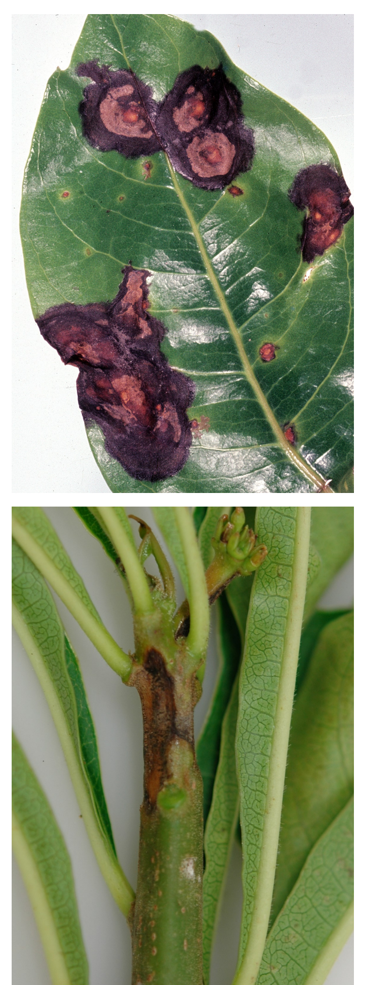
Fig. 3. Alternaria panax causing leaf spots on umbrella tree (above) and Alternaria stem blight on Frangipani (below).

Adoption of appropriate nursery hygiene practices is the key to effective management of Alternaria . Control measures can be specific for particular crops, but there are some basic principles which generally apply for most hosts.