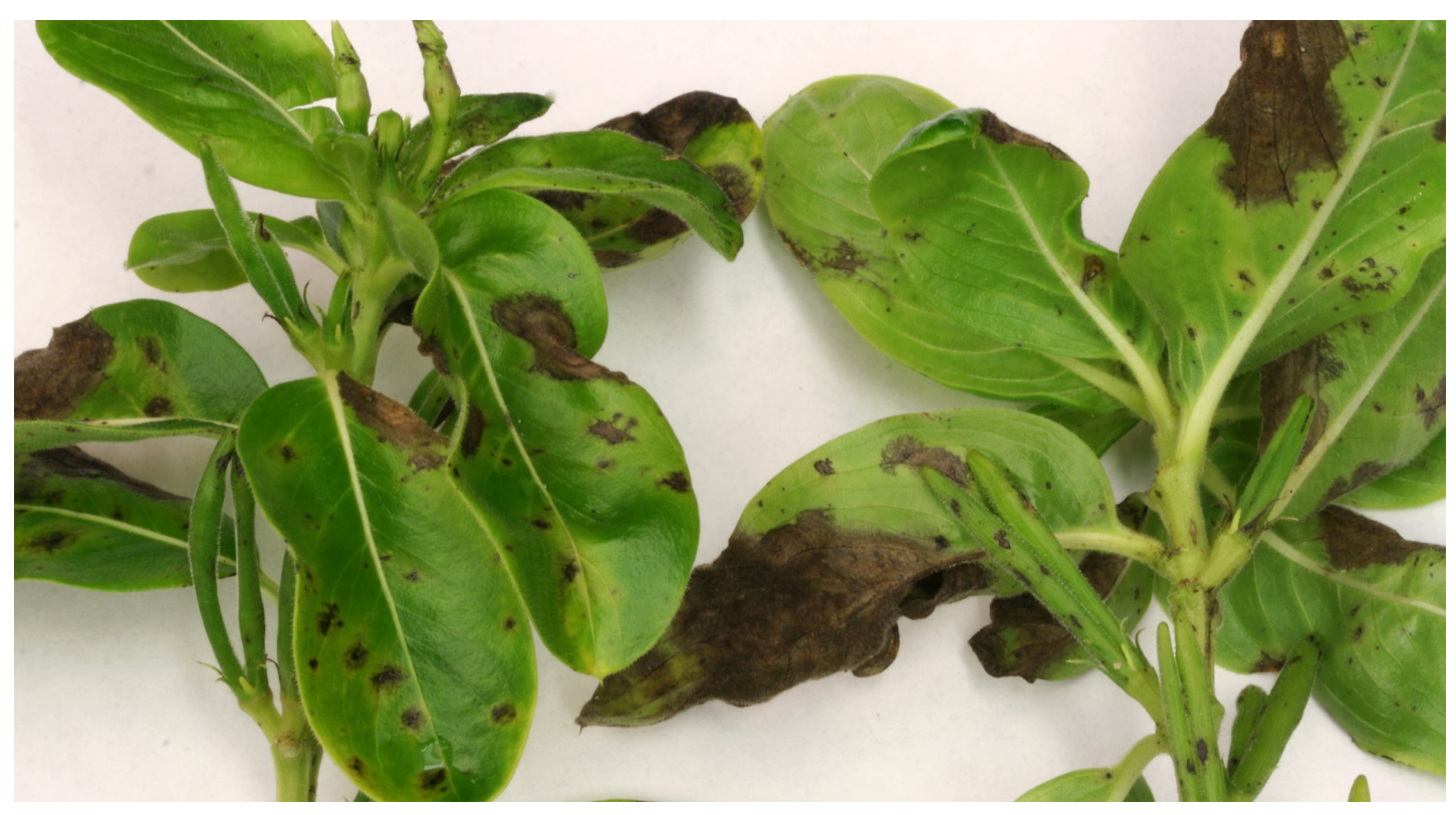
Fig. 1. Alternaria leaf spot on Vinca.

Some Alternaria diseases are seedborne with the fungus occurring on or within seed and this can result in rotting of seed or infection of radicles followed by death of seedlings. Symptoms produced by the suite of fungi causing leaf spots are often very similar; therefore an accurate diagnosis of the pathogen is required before successful disease management measures can be implemented.