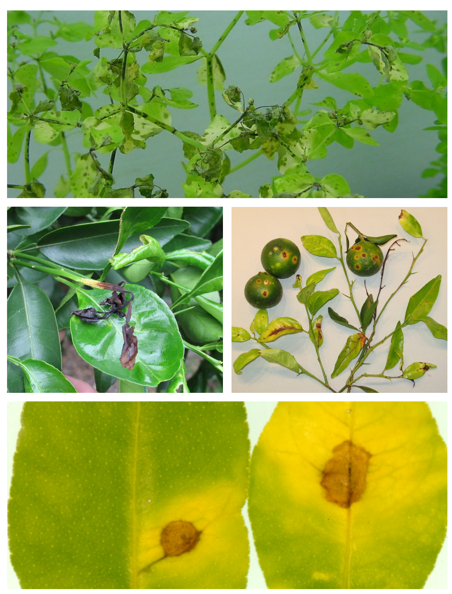
Fig. 4. Alternaria leaf and stem blight on Peplus (above). Alternaria diseases on citrus including blackening and blighting of young shoots (middle left), brown spot symptoms on leaves, shoots and young fruit (middle right), and leaf spots on seedling leaves where leaf spots are surrounded by chlorotic tissue and leaf veins turn brown from toxins produced by Alternaria (below).