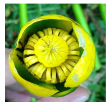
Figure 1: Nuphar sagittifolia flower

Nuphar sagittifolia (Walter) Pursh (Nymphaeaceae; Fig. 1), Cape Fear spatterdock, is an aquatic macrophyte endemic to the Atlantic Coastal Plain from Virginia to South Carolina (Padgett 2007). Populations of N. sagittifolia are known from a small area in central coastal Virginia and from southeastern North Carolina into