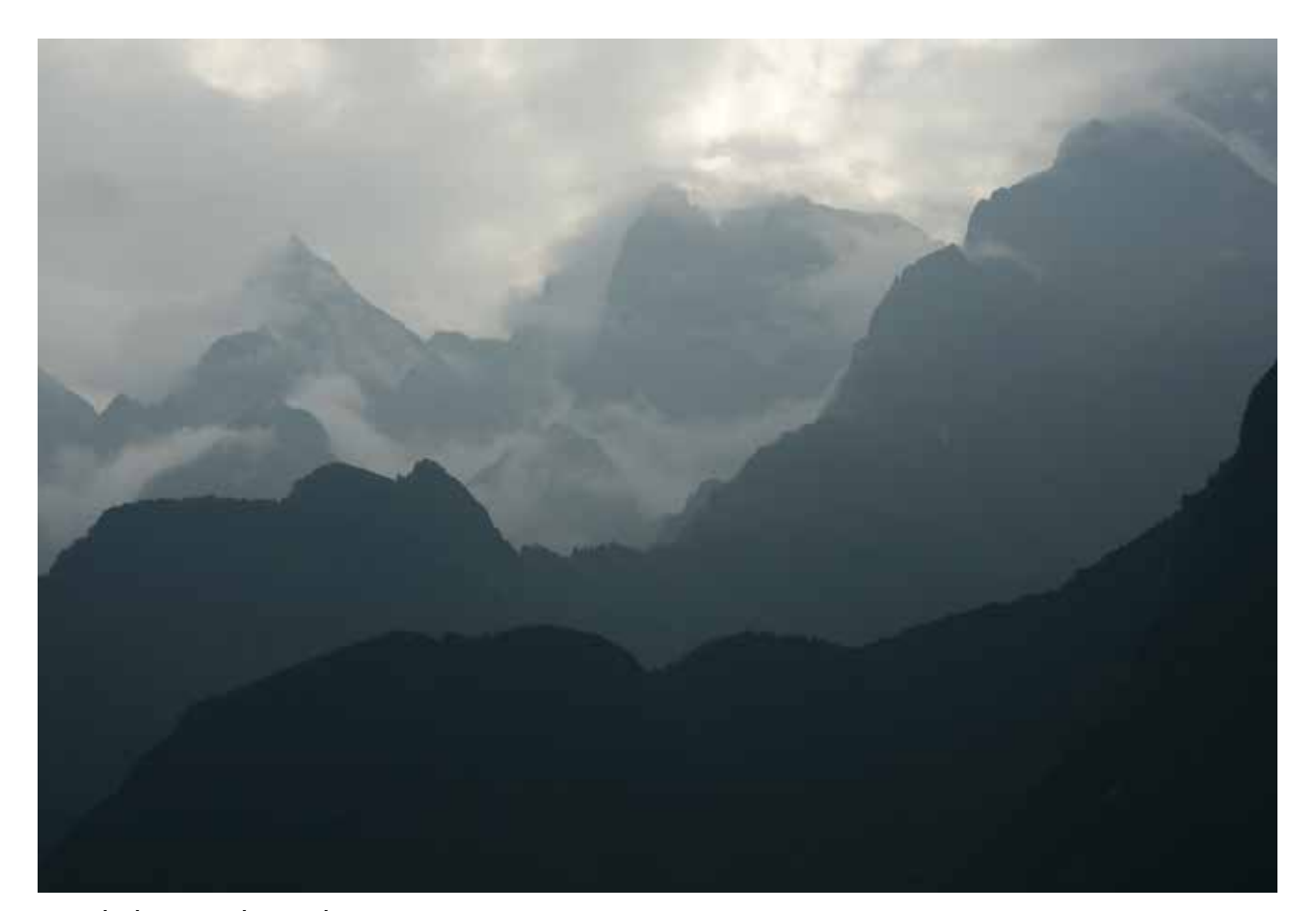
First light on Yulong Shan

However, as ever north-west Yunnan offers a tremendous amount in a more 'compact' area. Locations near Zhongdian offer stunning drifts of Gentiana arethusae adjacent to marshy flats with countless G. sino-ornata along with a dozen other gentianaceae (of various genera). Drifts of Comastoma traillianum quite literally carpet the roadsides in places, and there are plenty of Lomatogonium rotatum , various Swertia and Halenia elliptica . The latter is common throughout the province. Swertia is an especially appealing and diverse genus and includes the bull's-eye flowers of Swertia cincta and its very lovely cousin S. patula with prominent golden nectaries.