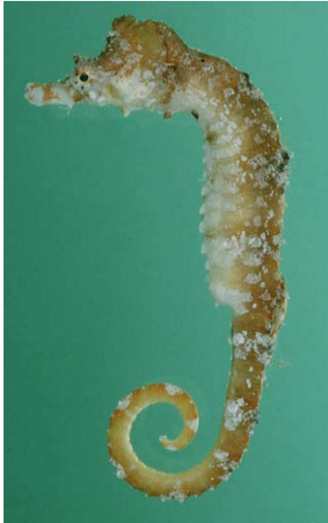
Fig. 1. Holotype of Hippocampus tyro , BPBM 35555, 61 mm total length, Poivre Atoll, Amirantes, Seychelles.

dredge, R/V Tyro Station 766, J. van der Land et al., 29 December 1992.