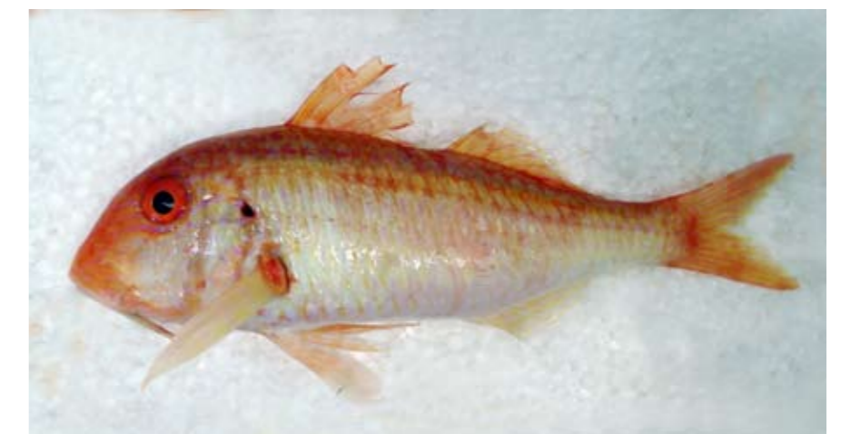
Fig. 6. Parupeneus fraserorum , SAIAB 82829, 117 mm SL, Madagascar.