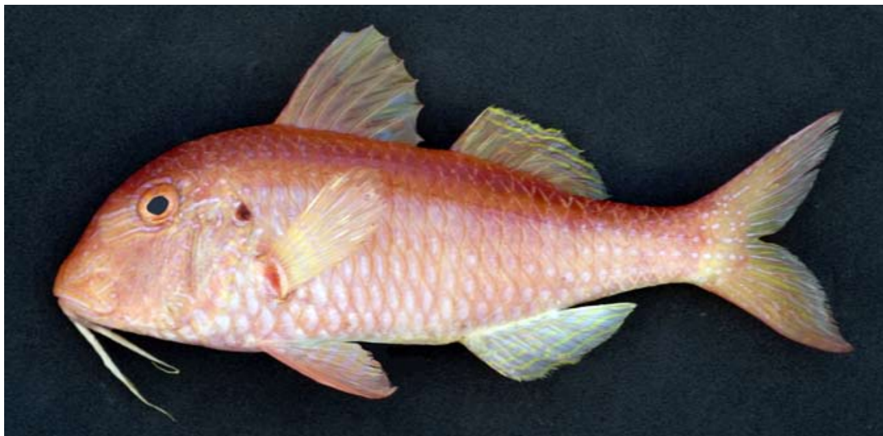
Fig. 1. Holotype of Parupeneus fraserorum , SAIAB 81385, 166.5 mm SL, KwaZulu-Natal.

parentheses refer to paratypes. The data in the table of measurements of the new species are given as percentages of the standard length. Proportional measurements in the text of the diagnosis and description are rounded to the nearest 0.05. Counts of pectoral-fin rays were made on both sides.