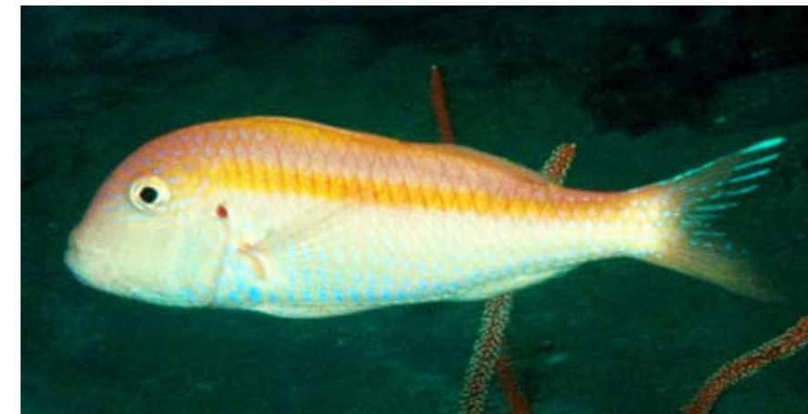
Fig. 3. Parupeneus fraserorum , KwaZulu-Natal.