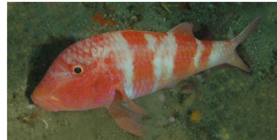
Fig. 5. Parupeneus fraserorum actively feeding, KwaZulu-Natal.