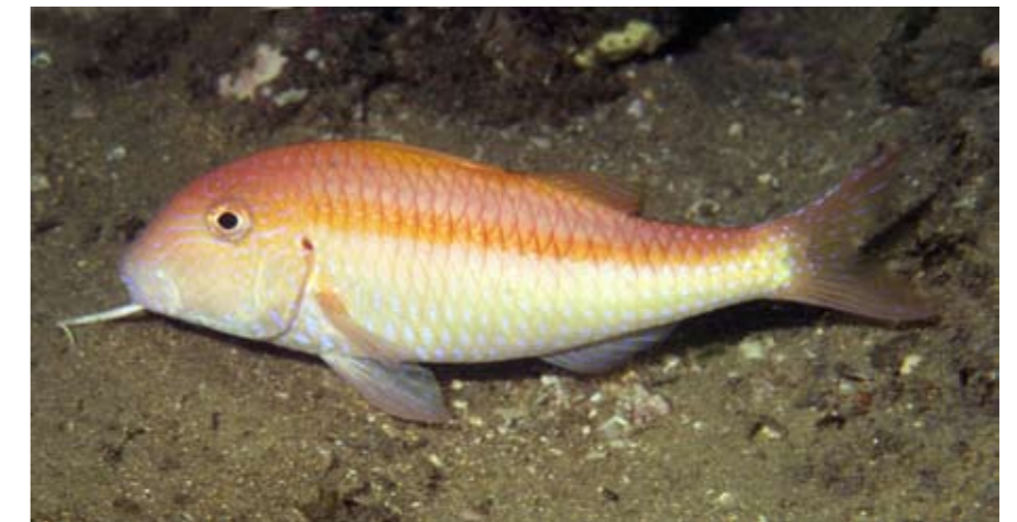
Fig. 4. Parupeneus fraserorum , KwaZulu-Natal.