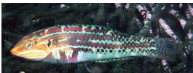
I. Underwater photo of female of Halichoeres zulu , in a rock pool with Caulerpa sp., KwaZulu-Natal (D. R. King).