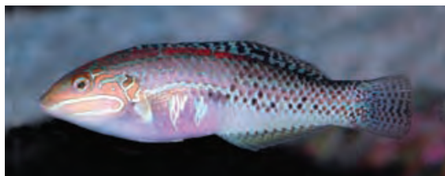
H. Photo of female of Halichoeres zulu, uShaka Marine World, Durban.