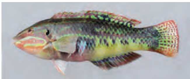
G. Holotype of Halichoeres zulu , SAIAB 83176, male, 135 mm SL, KwaZulu-Natal (D. R. King).