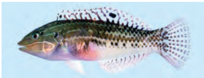
A. Paratype of Halichoeres zulu , SAIAB 82005, female, 79 mm SL, KwaZulu-Natal.