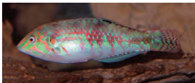
F. Photo of male of Halichoeres nebulosus, uShaka Marine World, Durban.