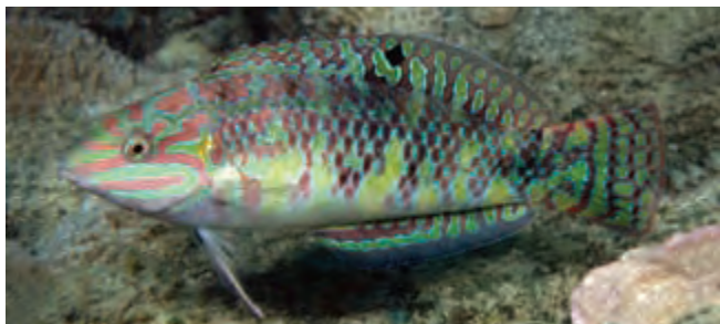
C. Underwater photo of male of Halichoeres margaritaceus , Taiwan.