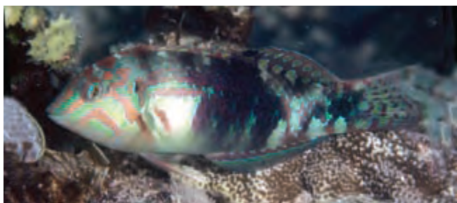
E. Underwater photo of male of Halichoeres nebulosus , Mauritius (J.E. Randall).