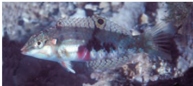
D. Underwater photo of female of Halichoeres nebulosus , Mauritius.