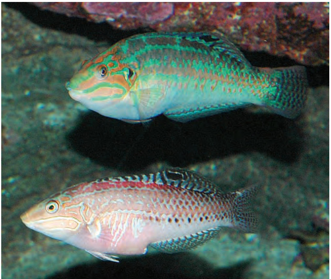
Fig. 1. Male and female of Halichoeres zulu , uShaka Marine World, Durban (D. R. King).

Table I gives the measurements of the new species as percentages of the standard length. Proportional measurements in the text are rounded to the nearest 0.05. Data in parentheses in the description refer to the paratypes.