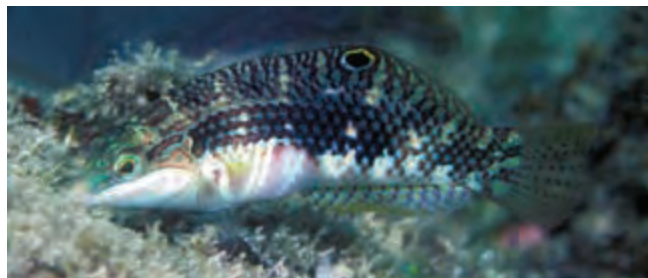
B. Underwater photo of female of Halichoeres margaritaceus , Taiwan (J. E. Randall).