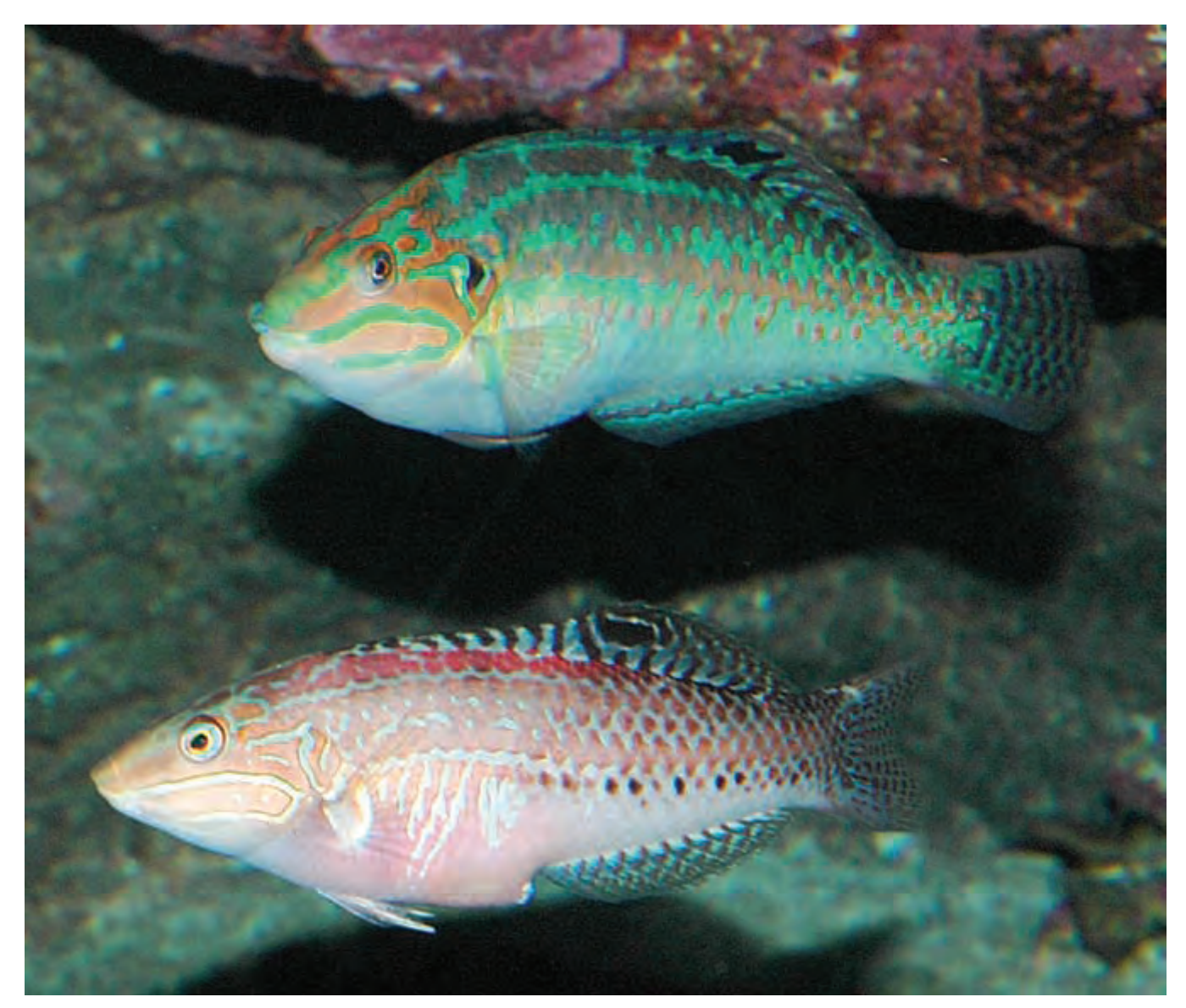
Fig. 1. Male and female of Halichoeres zulu , uShaka Marine World, Durban (D. R. King).

Table I gives the measurements of the new species as percentages of the standard length. Proportional measurements in the text are rounded to the nearest 0.05. Data in parentheses in the description refer to the paratypes.