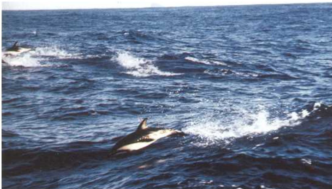
Fig. 2: Dusky dolphins speeding alongside the R.V. Shonan Maru 2 north of the Prince Edward Islands in the South-West Indian Ocean on 1 February 1988 (Record Number ii). This is the first authenticated sighting of dusky dolphins from the Indian Ocean

and 42°34'S, 40°49'E respectively (IWC/IDCR files, International Whaling Commission (IWC) Secretariat, Cambridge). A photograph of two jumping dolphins taken from one of these four schools, identified as L. obscurus (P. Ensor, in litt. to PBB, 5 July 1994), is shown in Figure 2. The similarities between the key external features of the dolphins in this photograph and those illustrated in Figure 3a confirm these sightings as being of L. obscurus . All sightings were made within a short period between 17:40 and 18:36, suggesting that the dolphins probably belonged to a single supergroup of the same species.