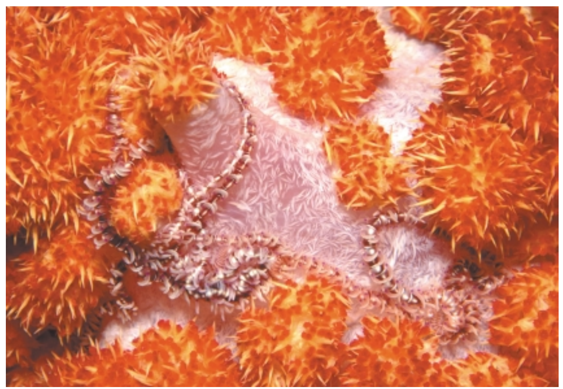
Fig. 1. Alcyonosyllis phili n. gen., n. sp. in situ on a species of Dendronephthya , Bootless Bay, Port Moresby, New Guinea.