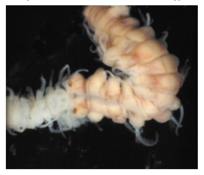
Fig. 4. Alcyonosyllis phili n.gen, n. sp. Non-type specimen (NTM W17217), dorsal view, with fully mature stolon attached to stock showing 2 pairs of anterolateral eyes and 2 pairs of lateral antennae.

Variation. A few non-type specimens (e.g. NTM W17217) with fully mature stolons attached to stock. Stolons with 2 pairs of anterolateral eyes and 2 pairs of lateral antennae (Fig. 4); body generally enlarged relative to that of stock, hook chaetae are withdrawn within parapodia, and emergent capillary epitokal