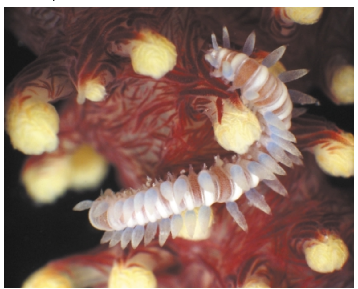
Fig. 2. Alcyonosyllis phili n. gen, n. sp. in vitro on a nephtheid host from Darwin Harbour (NTM W17242). The recently fixed specimen differs from the live appearance in having less pigment intensity and in the large dorsal cirri which are held erect rather than arching over the dorsum.