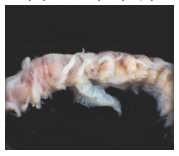
Fig. 5. Alcyonosyllis phili n.gen, n. sp. Non-type specimen (NTM W17217), lateral view, with regenerating tail end on venter at junction of stock and stolon comprising about 20 short segments and small pygidium bearing a pair of anal cirri.